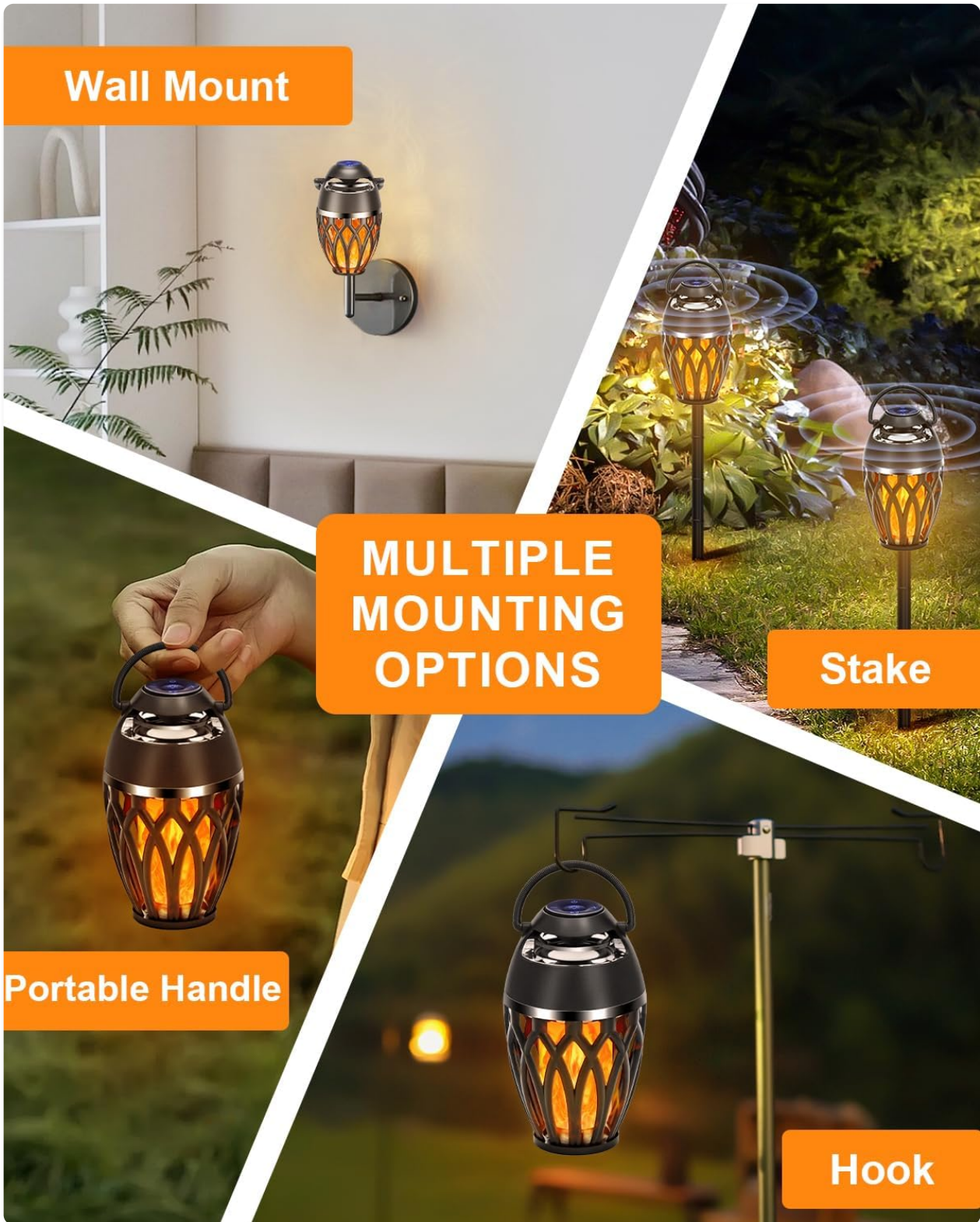
Image: Various mounting configurations for the MOFOKEAY OBS-2PCS speakers, including wall, stake, portable, and hook options.