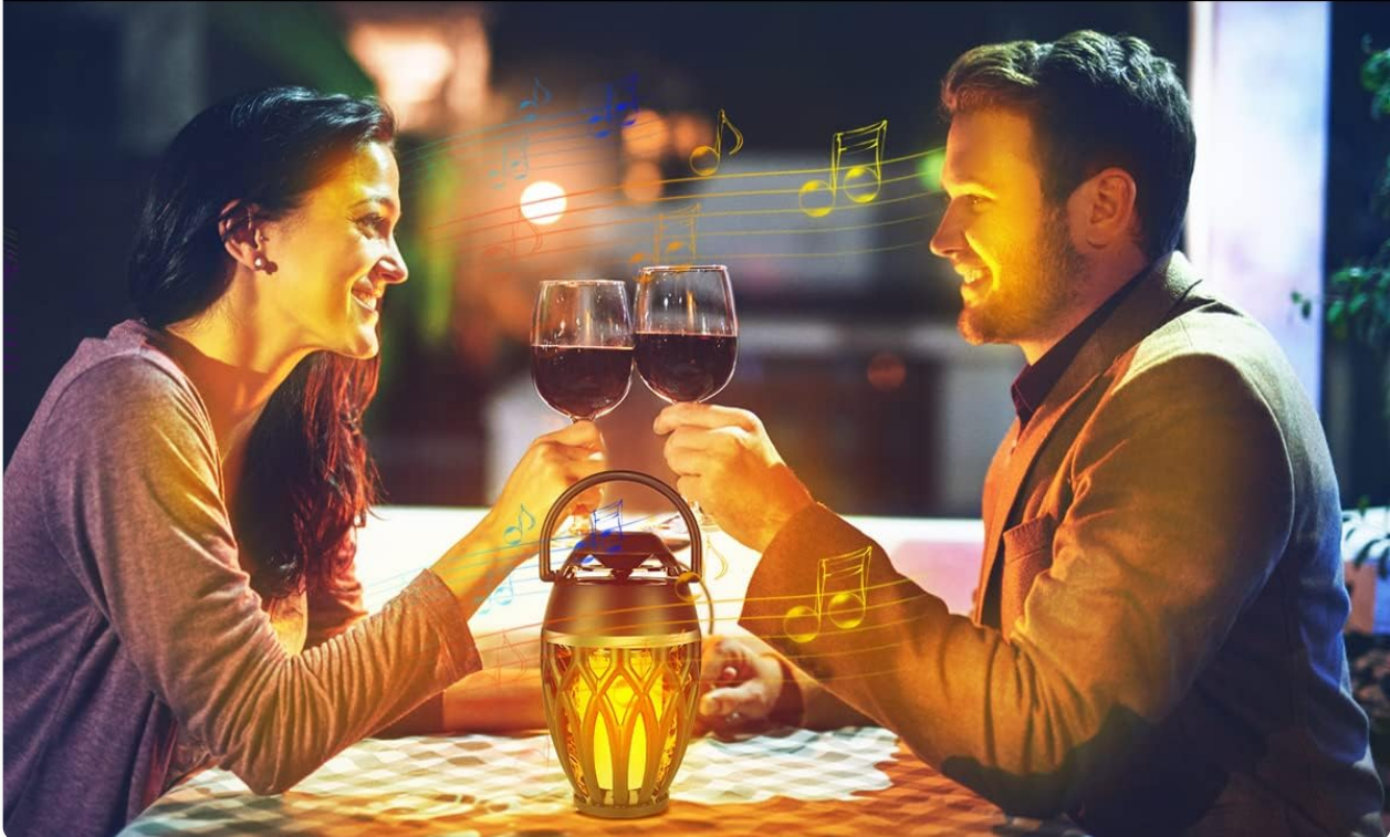
Image: The MOFOKEAY speaker demonstrating its realistic LED flame effect in an outdoor setting.