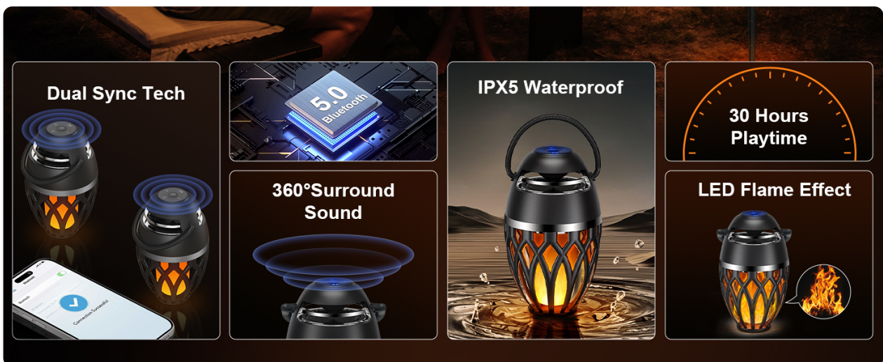
Image: Visual representation of two MOFOKEAY speakers paired for True Wireless Stereo (TWS) functionality.

To achieve a stereo sound experience, you can pair two MOFOKEAY OBS-2PCS speakers together.