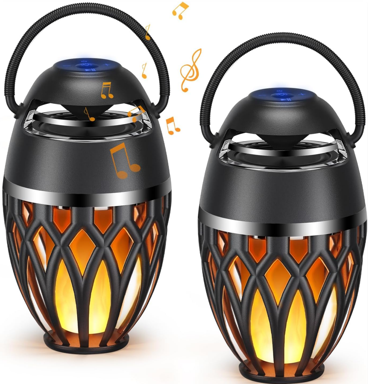
Image: Two MOFOKEAY OBS-2PCS Outdoor Bluetooth Speakers, showcasing their design with an LED flame effect and musical notes indicating sound output.