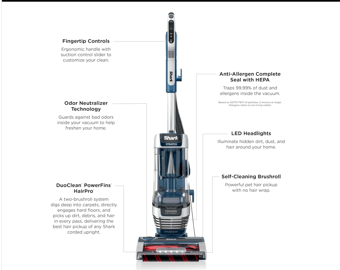
Figure 5.3: Comparison showing a standard brushroll with hair wrap versus the Shark Stratos's self-cleaning brushroll with no hair wrap, effective for pet hair and long hair.