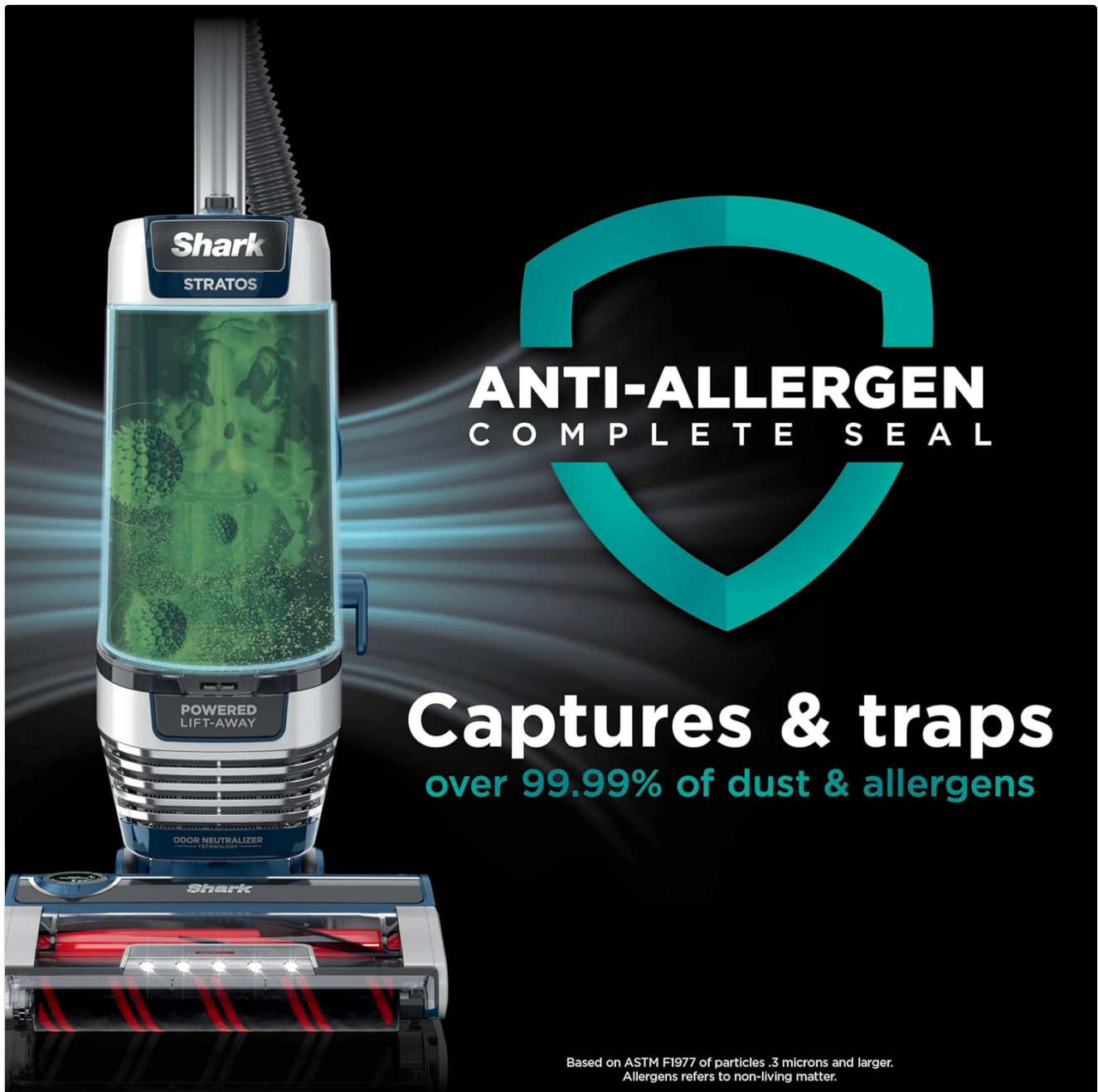
Figure 5.1: Demonstrating the easy-empty dust cup feature of the Shark Stratos Vacuum, allowing for quick and mess-free disposal of collected debris.