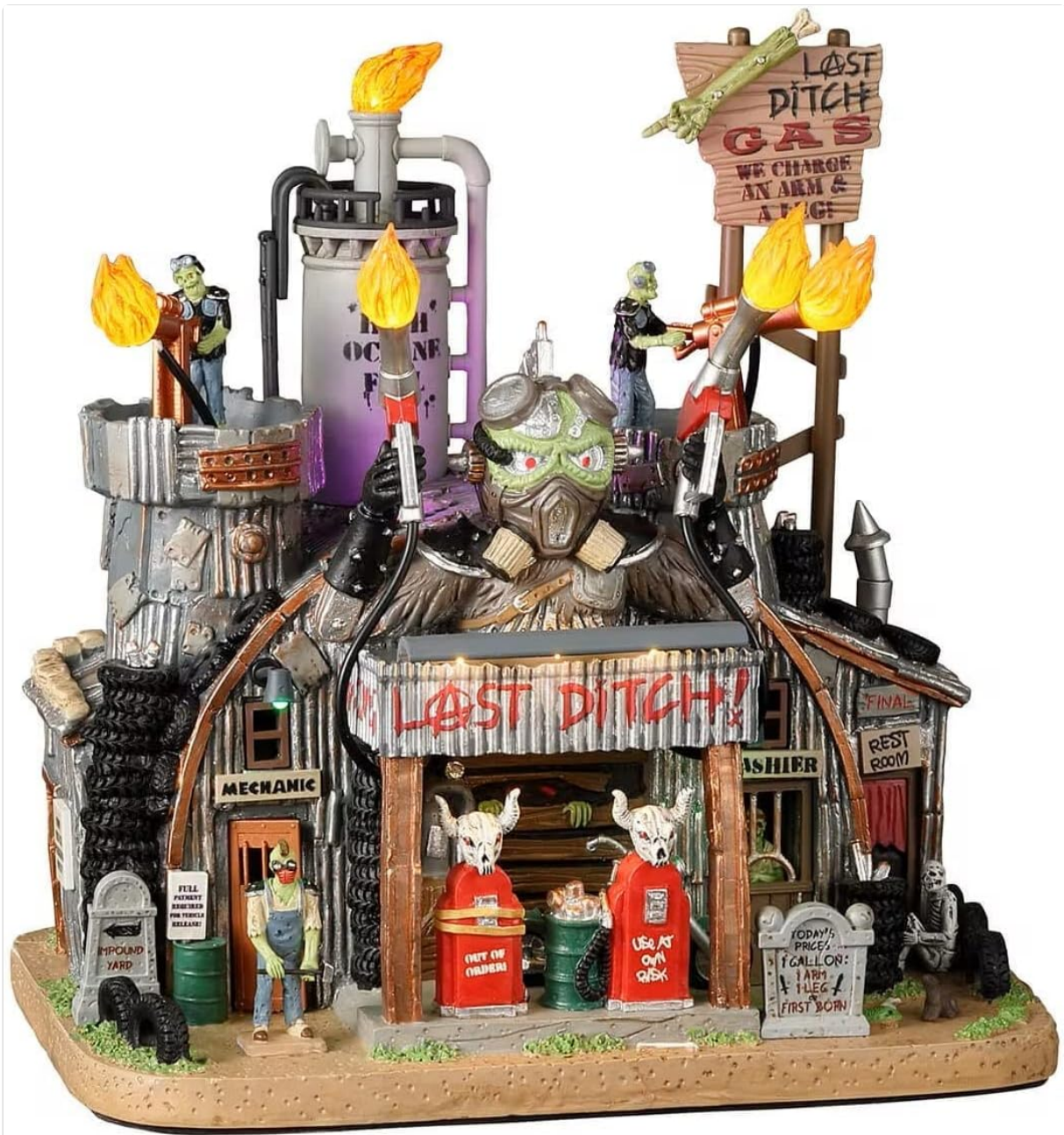
Image 1.1: The LEMAX Last Ditch Gas & Salvage building. This image displays the full collectible building, featuring a gas station theme with post-apocalyptic elements. It includes zombie figures, gas pumps, a "Last Ditch Gas" sign, and various distressed architectural details with illuminated flame effects.