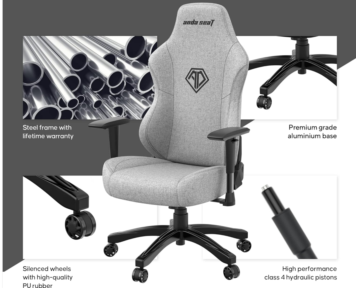
Image: Illustration of premium build quality components, including the steel frame, aluminum 5-point base, silenced wheels, and Class 4 hydraulic piston.