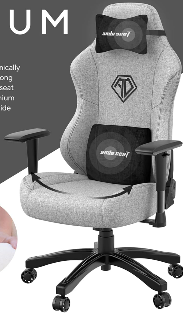
Image: Illustrates the chair's ergonomic design and high-density molded foam for comfort and support, with a close-up of the lumbar pillow.