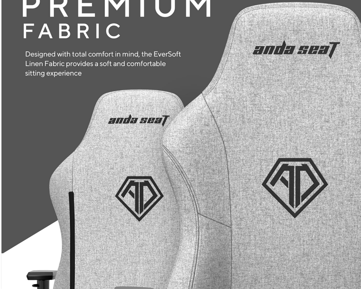
Image: Highlights the premium fabric material, designed for comfort and durability.

Designed with total comfort in mind, the EverSoft Linen Fabric provides a soft and comfortable sitting experience