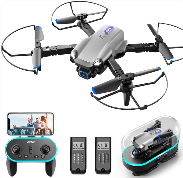
Image of the 4DRC Mini Drone kit, including the foldable drone, remote controller with phone mount, two modular batteries, and a transparent storage case.