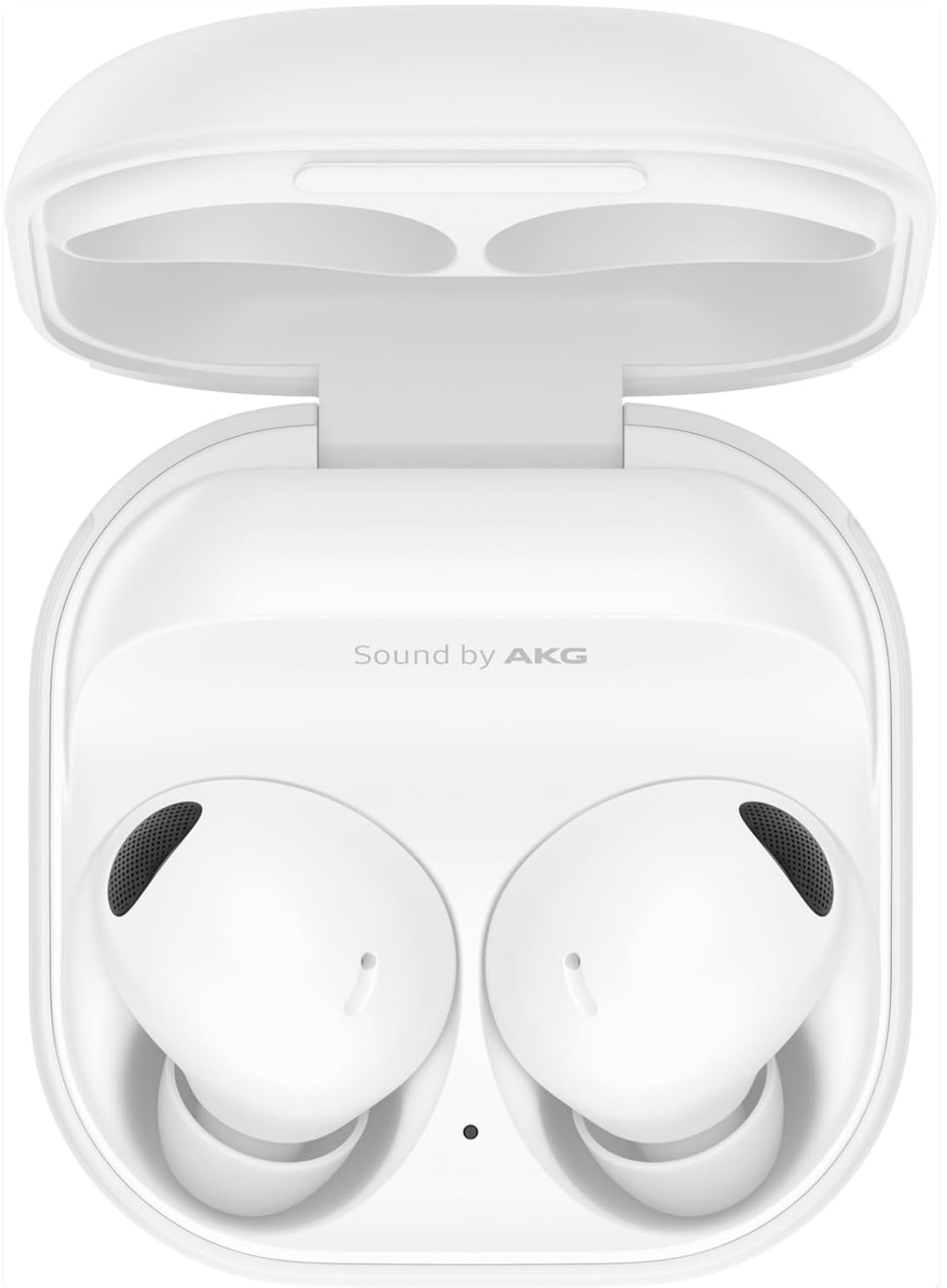
Figure 1.1: Samsung Galaxy Buds 2 Pro earbuds in their charging case.