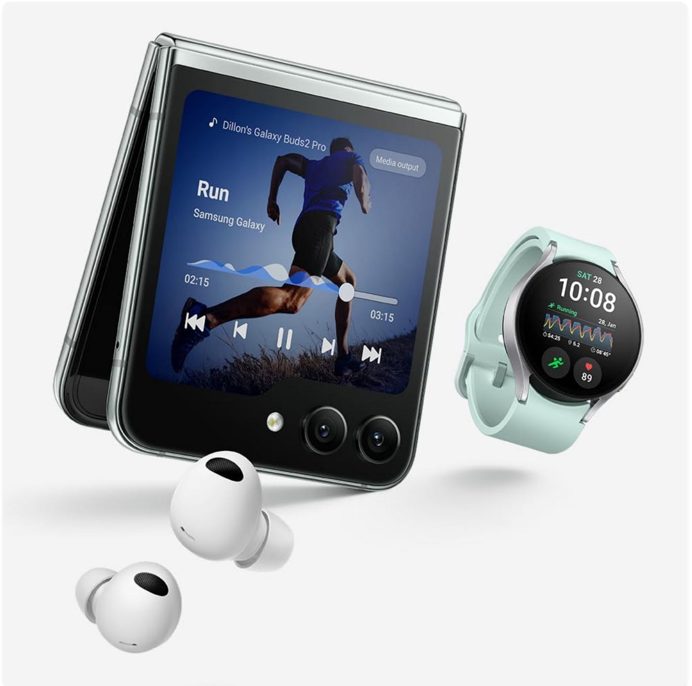
Figure 2.2: The Galaxy Buds 2 Pro seamlessly integrate with other Samsung Galaxy devices.