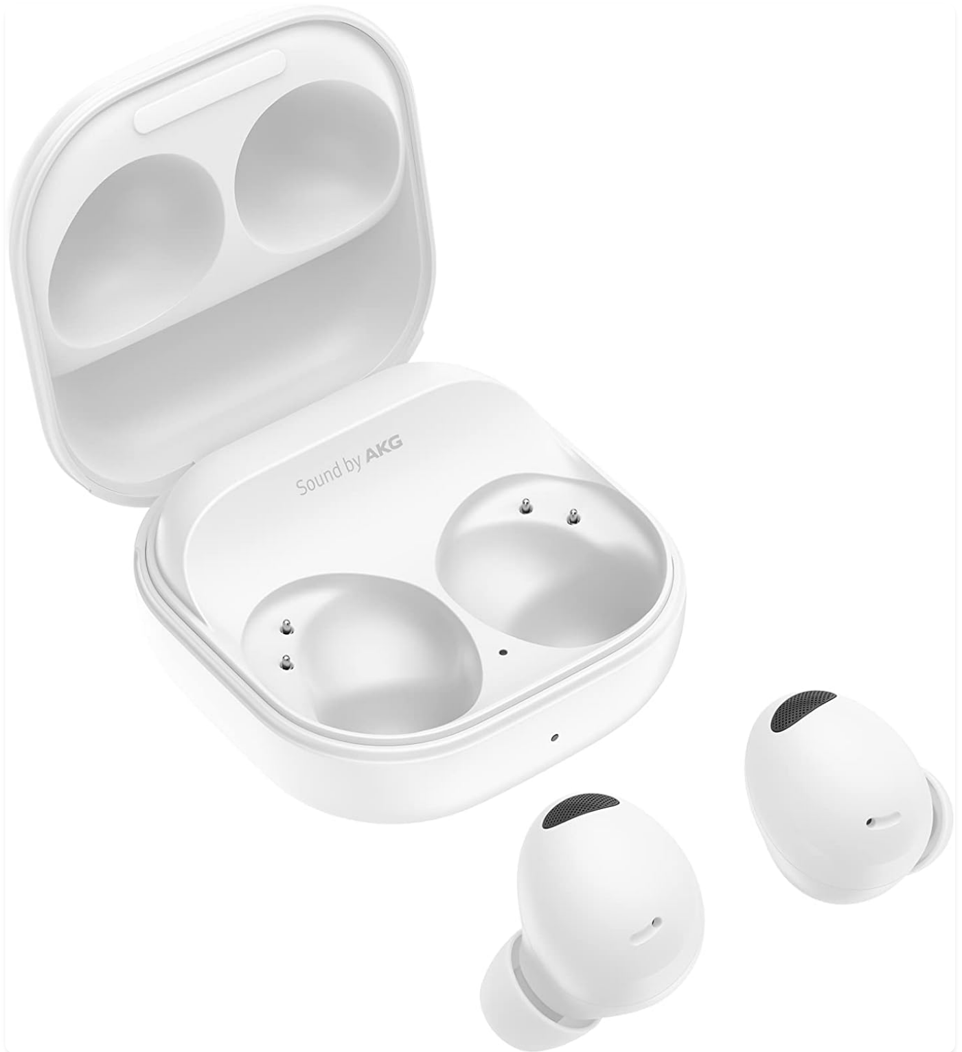
Figure 2.1: The Galaxy Buds 2 Pro earbuds removed from their charging case.