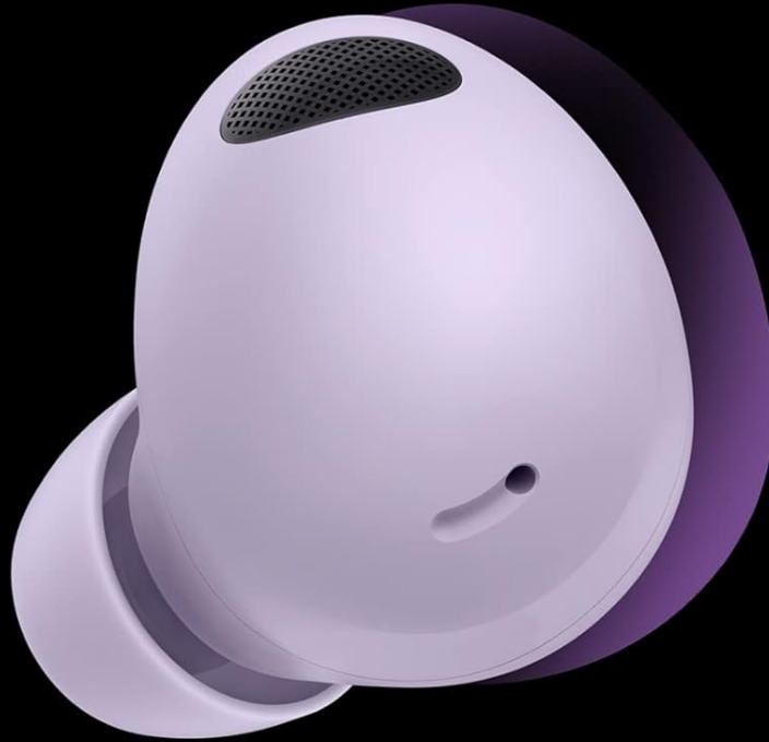
Figure 5.1: The ergonomic design ensures a comfortable and secure fit.