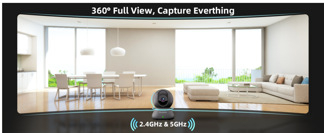
Figure 2: Overview of blurams Indoor Camera A31 features.