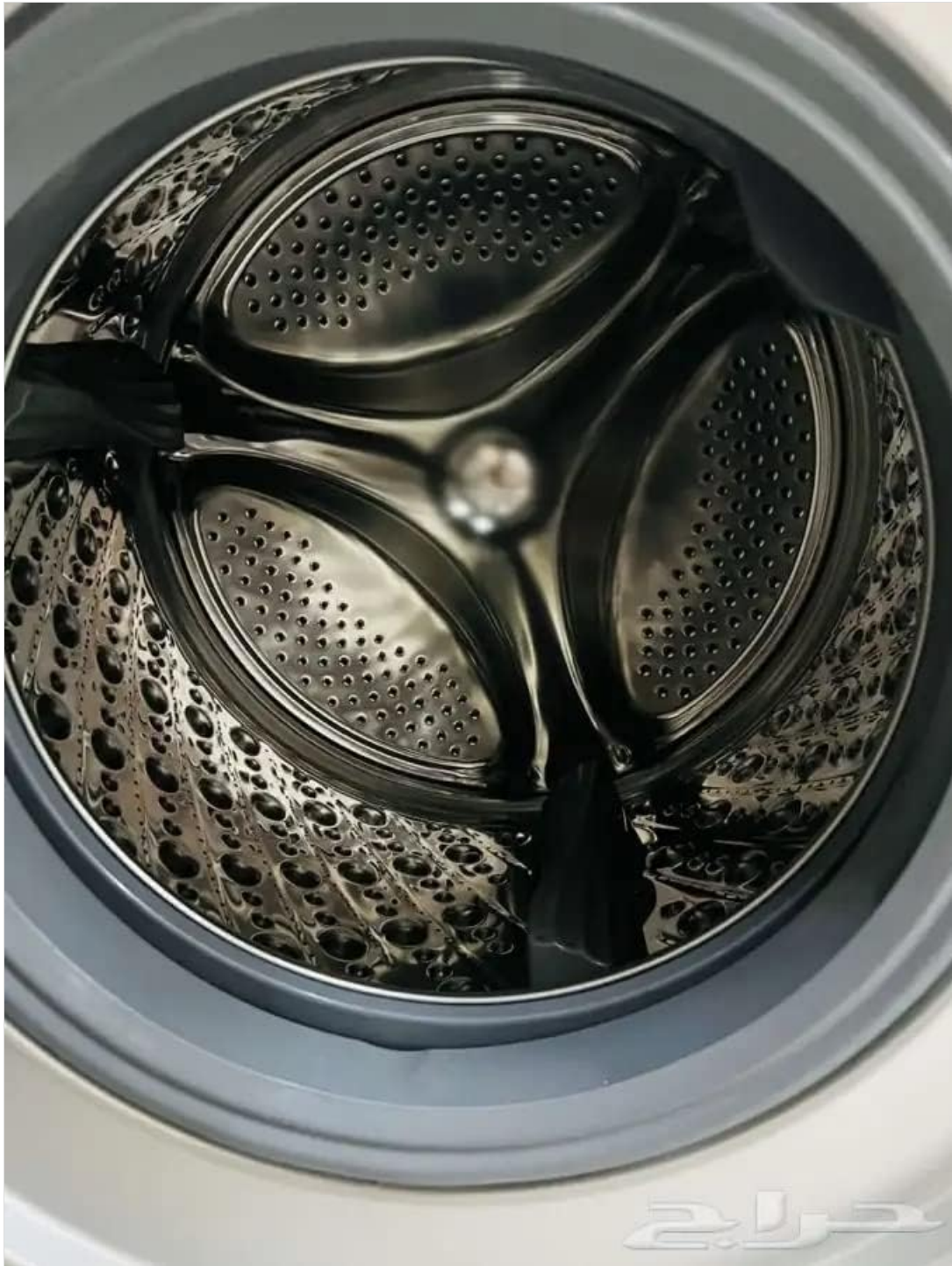
Figure 3.2: Interior view of the stainless steel drum. The drum features a textured surface designed for effective washing and drying, ensuring durability and hygiene.