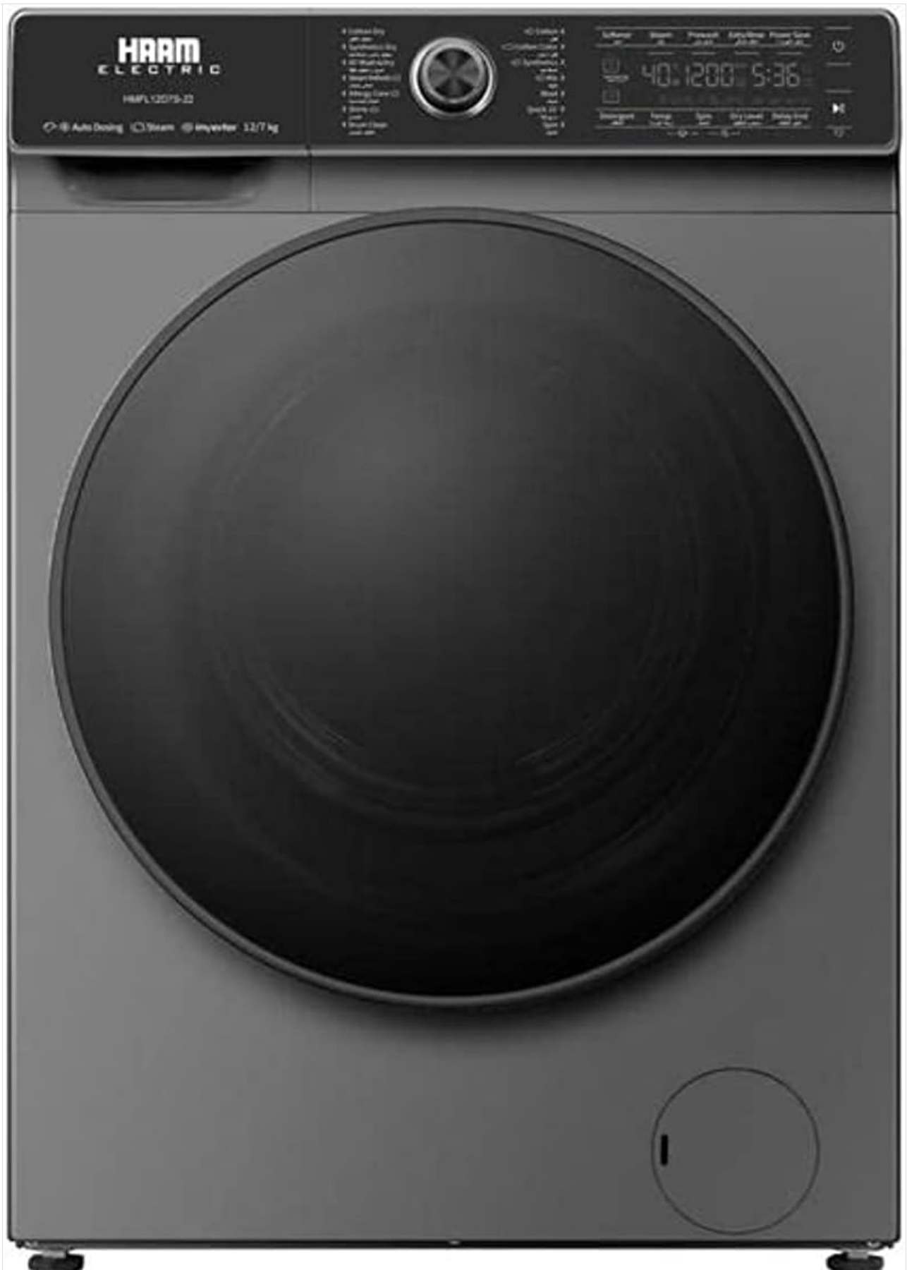
Figure 3.1: Front view of the Haam Electric HMFL12D7S-22 Washer and Dryer. This image displays the appliance's silver finish, the large front-loading door, and the control panel located at the top.

The Haam Electric HMFL12D7S-22 is a front-loading washer and dryer combination unit. Key components include the main control panel, detergent dispenser, and the stainless steel drum.