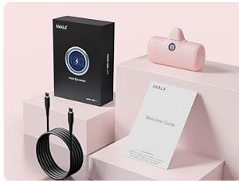
Image: The iWALK power bank, a USB-C charging cable, and the welcome guide, as included in the product package.