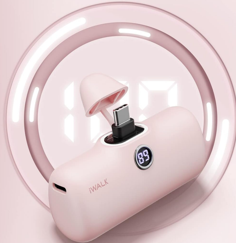
Image: A close-up view of the iWALK power bank, highlighting its digital display which shows the current battery percentage.