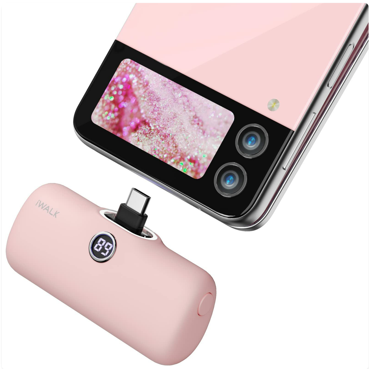
Image: The iWALK DBL5000PC portable USB-C power bank in pink, showcasing its compact design.