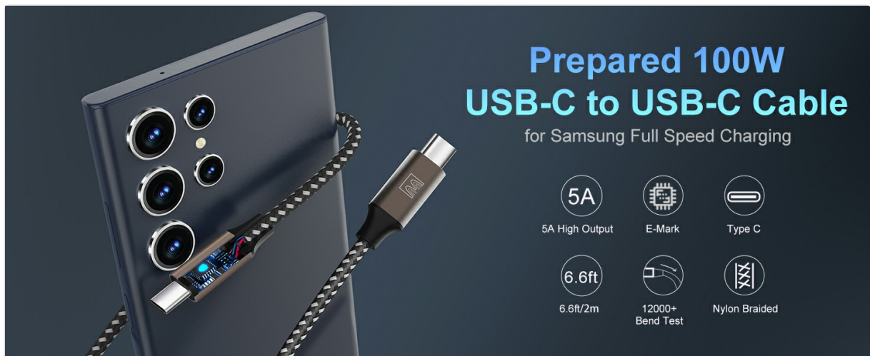
Image: A detailed view of the USB-C to USB-C cable, highlighting its 5A high output, E-Marker chip, Type-C connector, 6.6ft length, 12000+ bend test rating, and nylon braided construction.