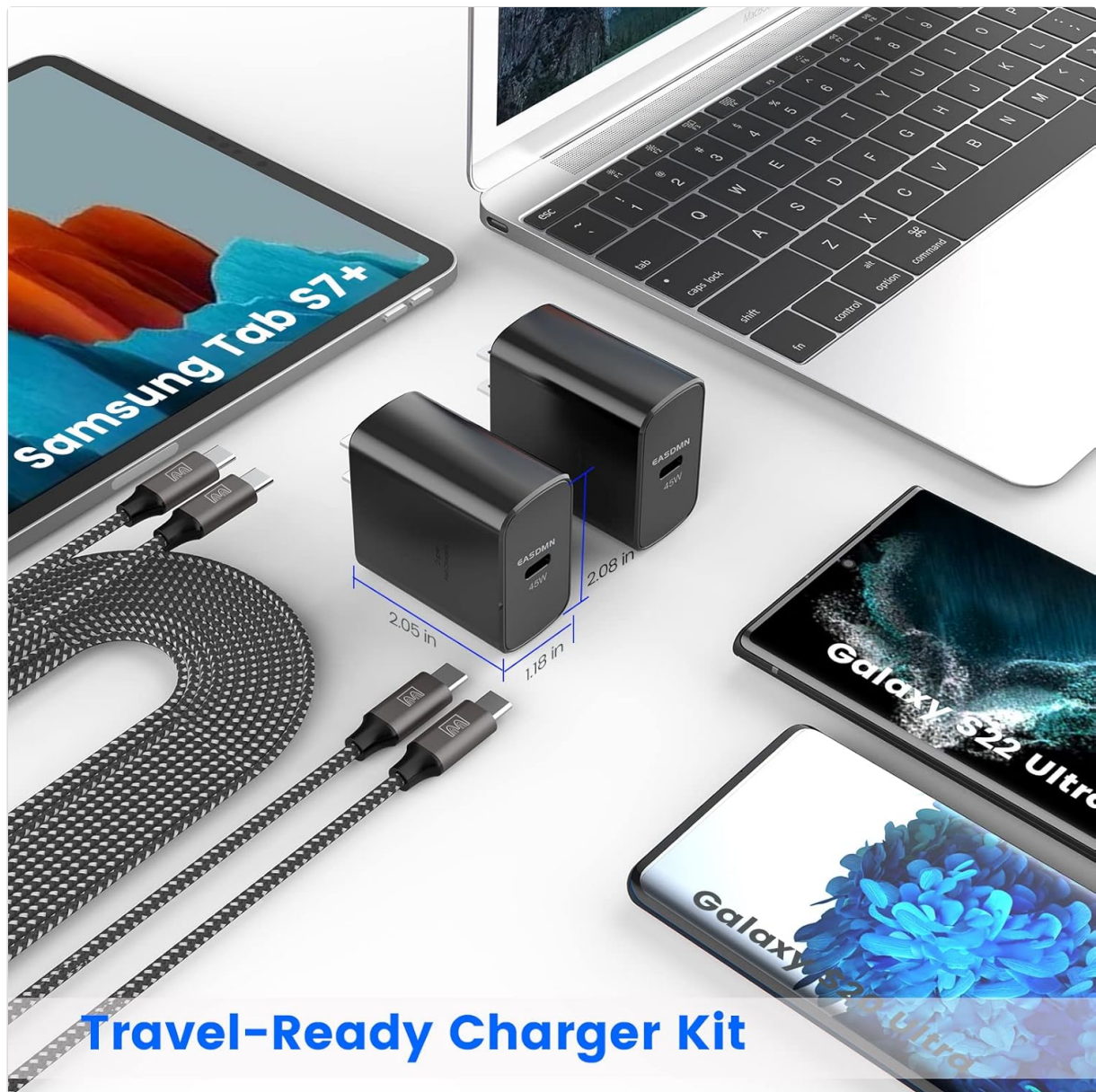
Image: The charger block with its dimensions displayed, alongside a laptop, tablet, and smartphone, illustrating its compact size.