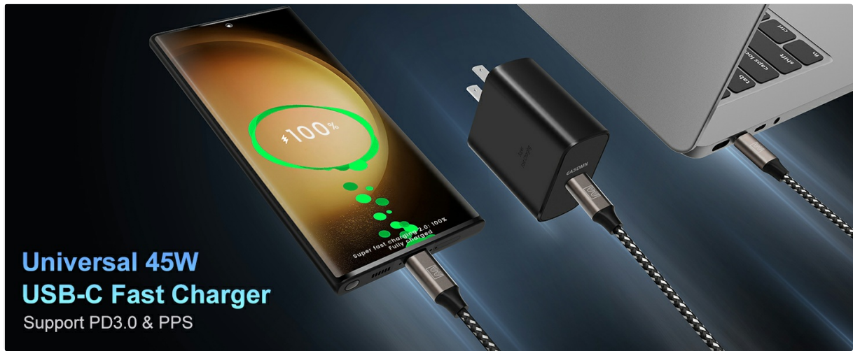
Image: A 45W USB-C charger block connected to a wall outlet, with its braided USB-C cable connected to a smartphone and a laptop, demonstrating universal compatibility.