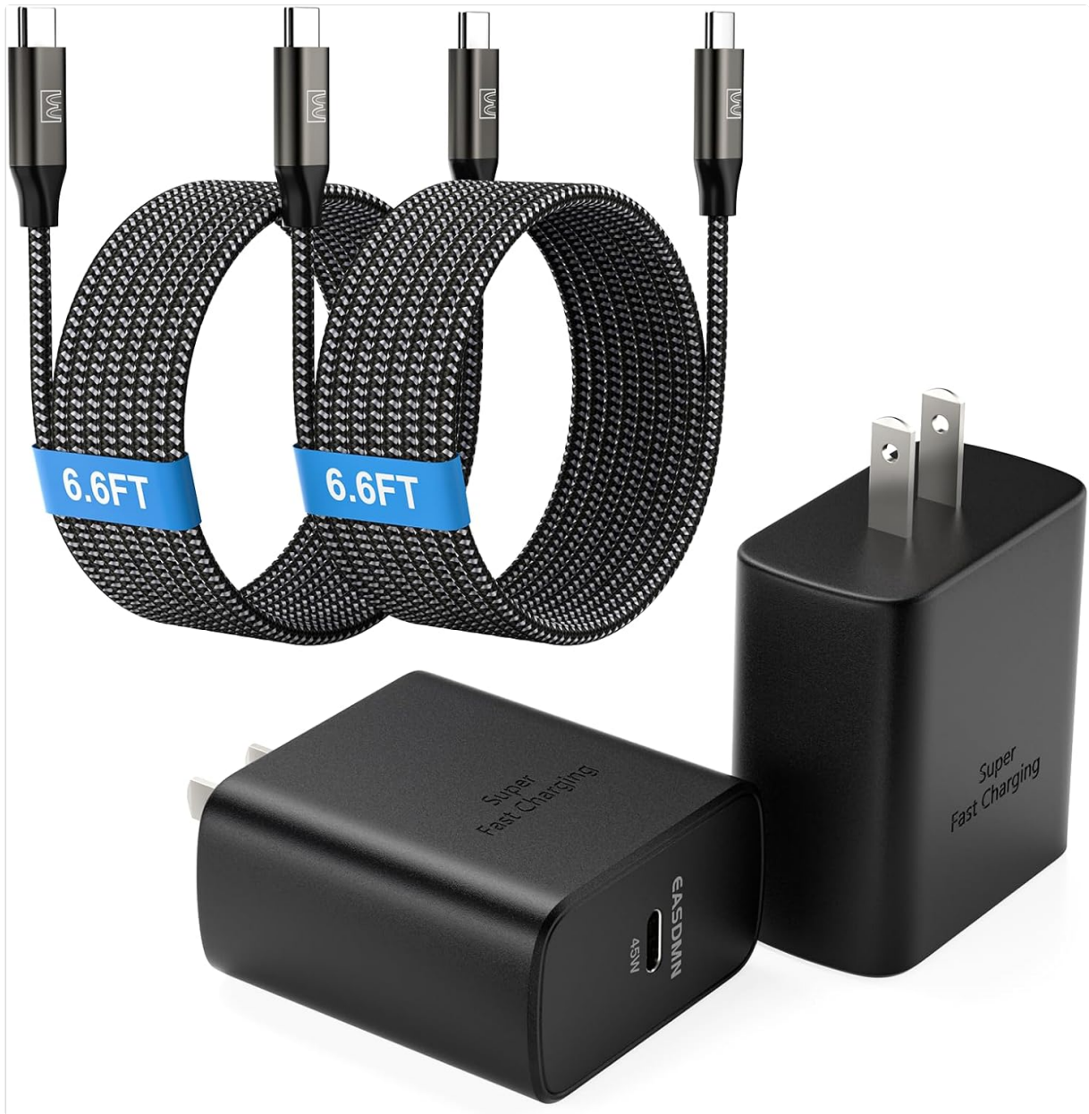
Image: Two EASDMN 45W USB-C charger blocks and two 6.6ft USB-C to USB-C braided cables.