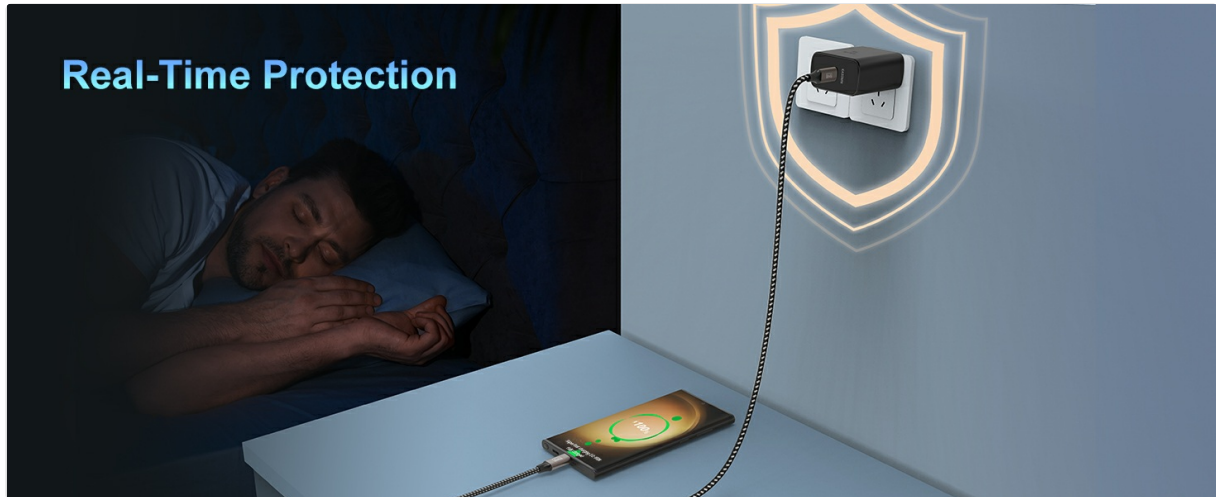
Image: A graphic depicting a person sleeping while their phone charges, with a shield icon overlaying the charger, symbolizing real-time protection against electrical hazards.