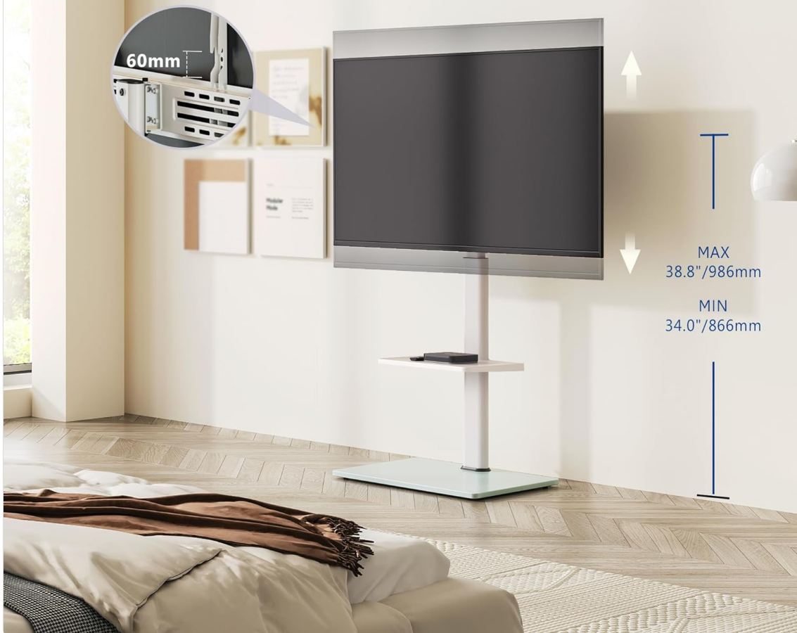
Image: Illustration demonstrating the 8-level height adjustment feature of the TV stand, showing minimum (866mm) and maximum (986mm) TV center heights.