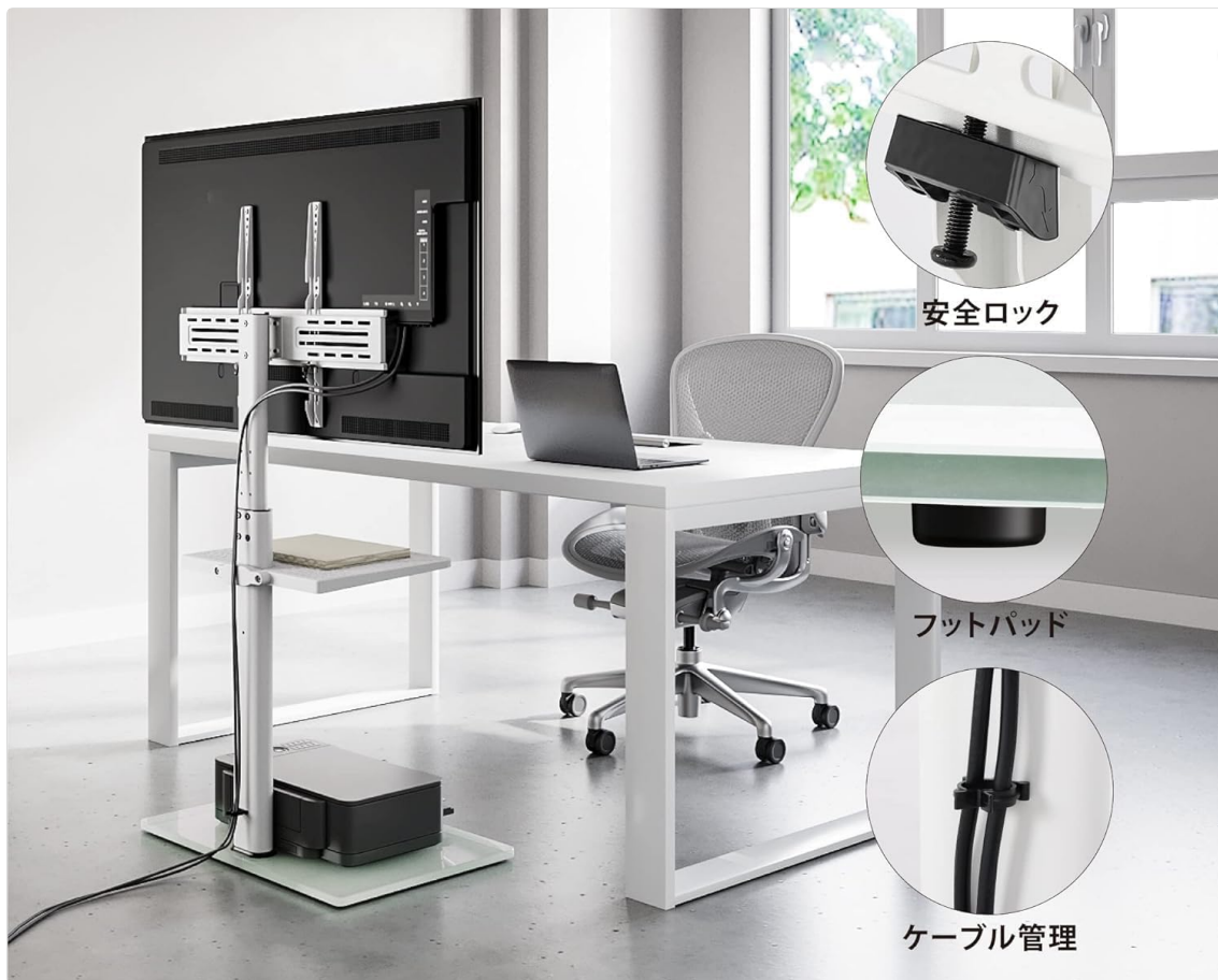
Image: Details showing cable management, a safety lock for the TV bracket, and protective foot pads on the base.