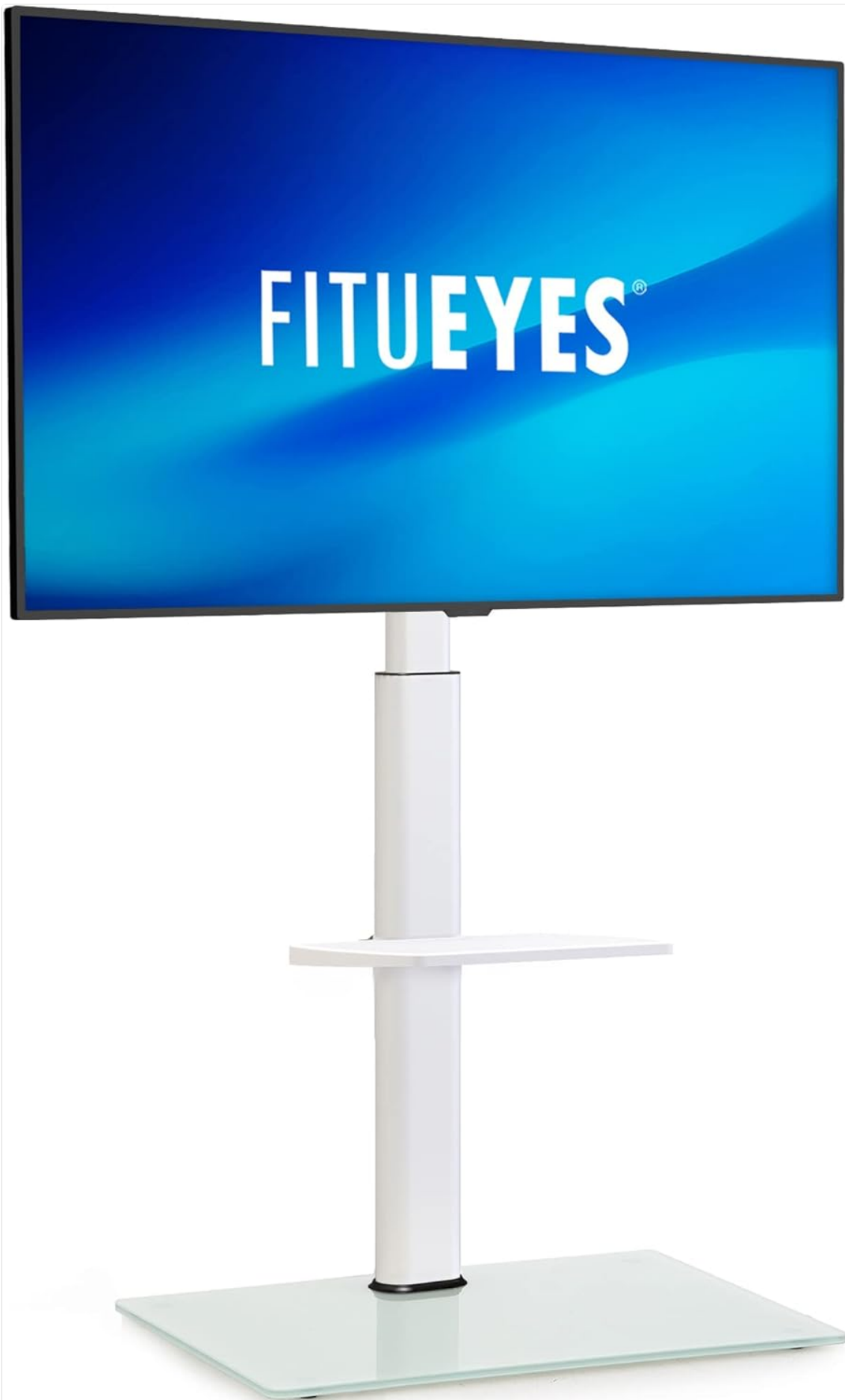
Image: Front view of the assembled FITUEYES TV Stand.