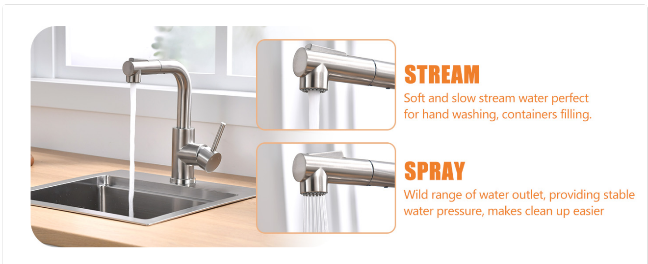
Image: Illustration showing the two spray modes (stream and spray) available from the faucet head.

Switch between modes using the button located on the sprayer head. The sprayer can be pulled out for extended reach and retracts automatically thanks to the gravity ball design.