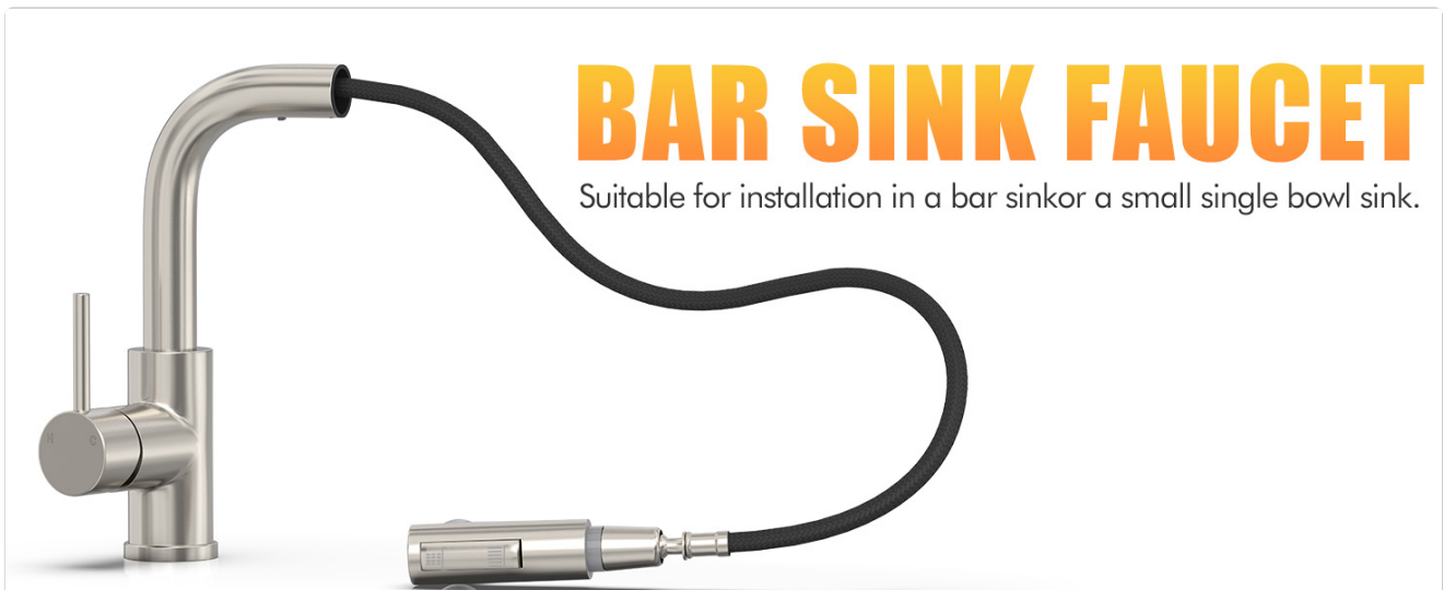
Image: The faucet installed in a modern bar sink setting.

This versatile faucet is suitable for various applications: