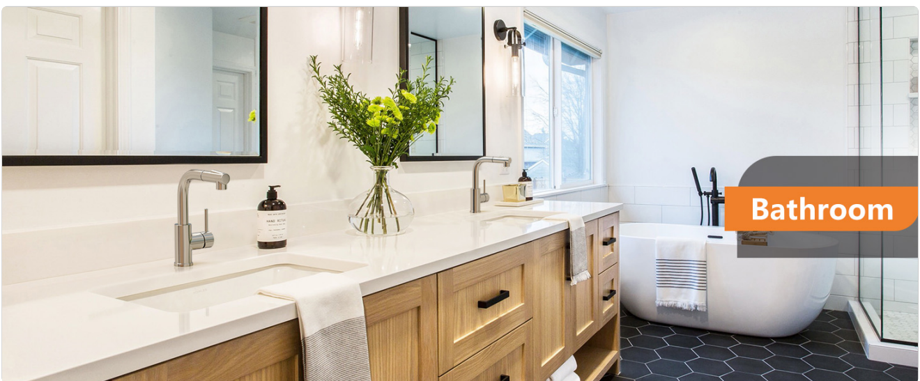
Image: The faucet used as a bathroom basin faucet, showcasing its versatility.