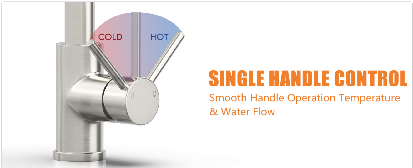
Image: Diagram illustrating the single handle control for adjusting hot and cold water flow.

The single lever handle controls both water flow and temperature. Move the handle up to increase flow and down to decrease it. Pivot the handle left for hot water and right for cold water.