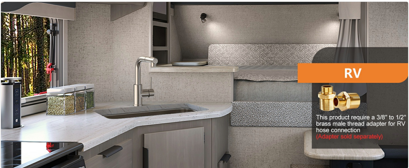
Image: The faucet installed in a compact RV kitchen, highlighting its suitability for mobile living spaces.