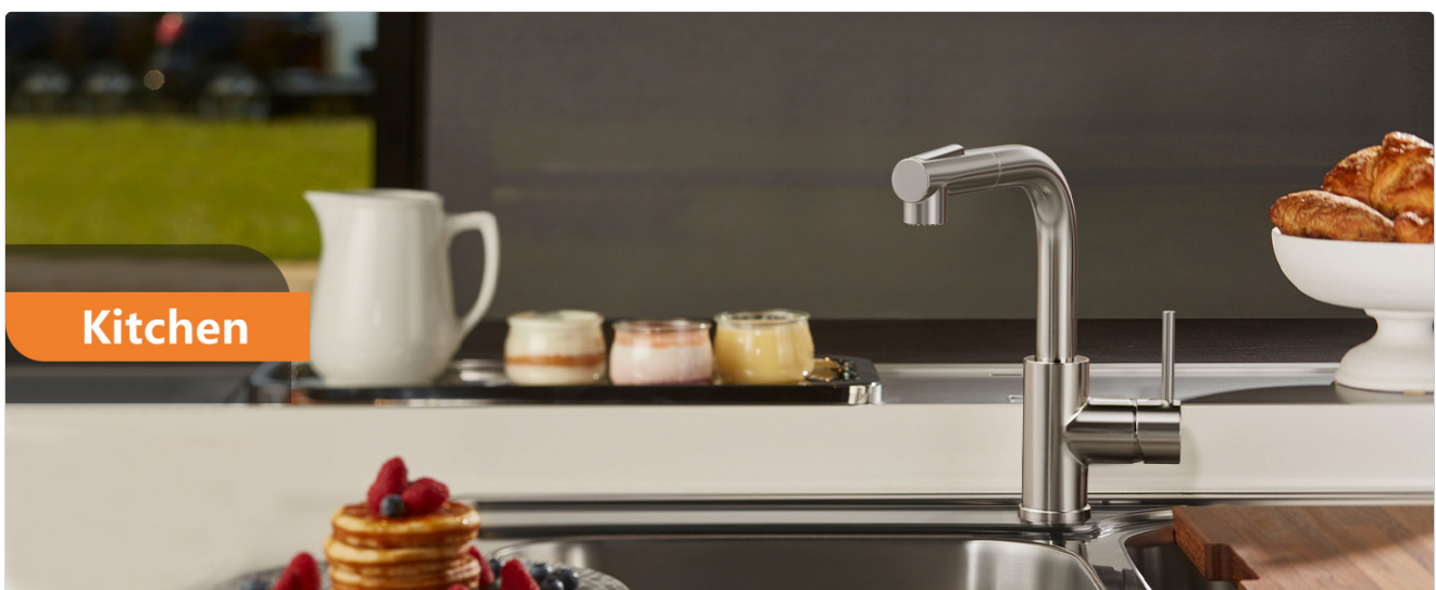
Image: The faucet integrated into a kitchen countertop with a sink.

Image: The faucet installed in a modern bar sink setting.