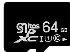
6 SD CARD

Image: The packing list for the Kinbank Super Console X King, showing the console unit, remote control, two gamepads, HDMI cable, power adapter, and an SD card.