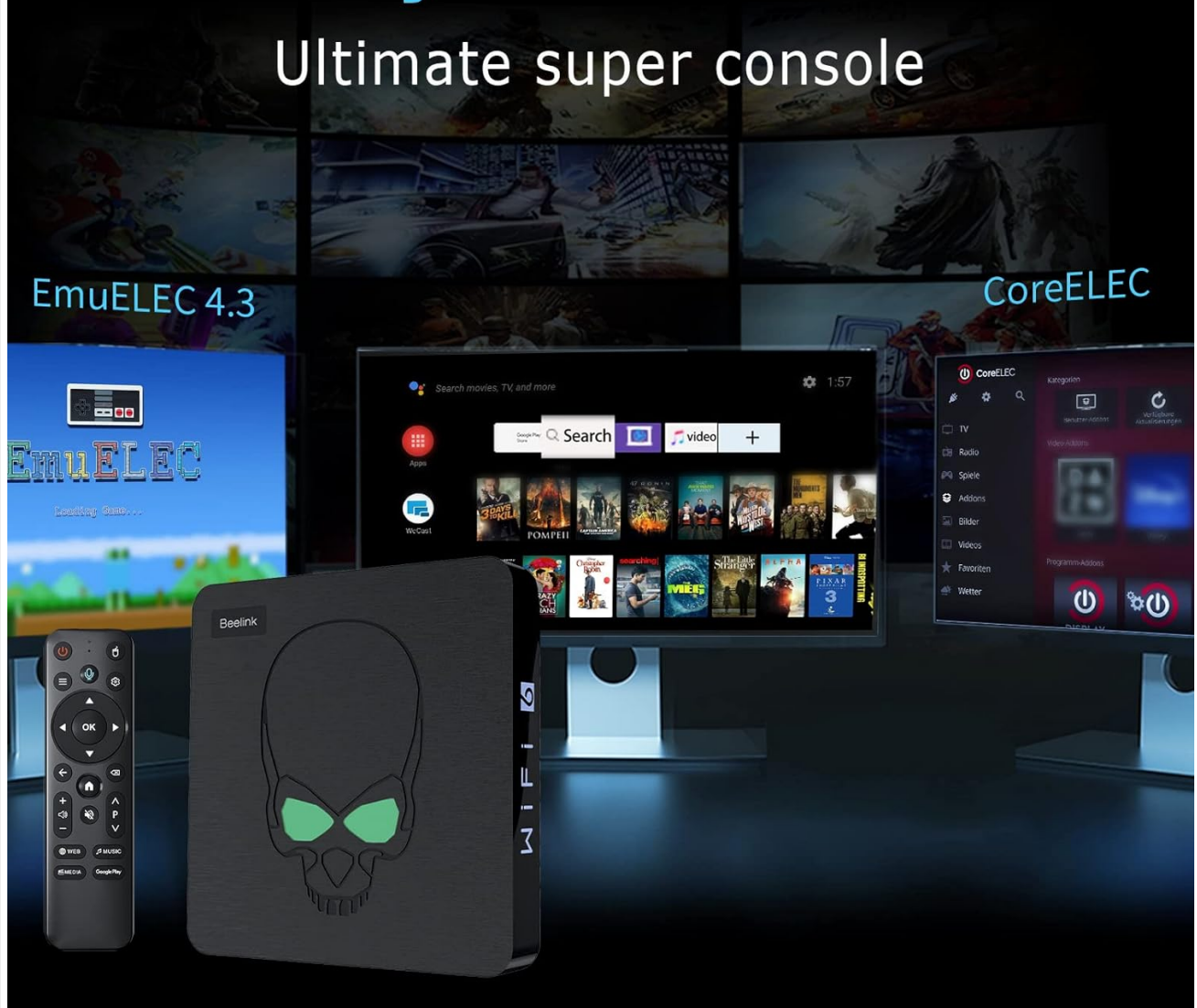
Image: A visual representation of the three systems (EmuELEC, Android, CoreELEC) integrated into the Kinohank Super Console X King, highlighting its versatility.