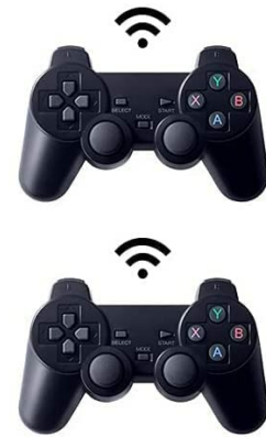
3 GAMEPAD CONTROLLER * 2