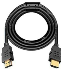
4 CABLE HD * 1