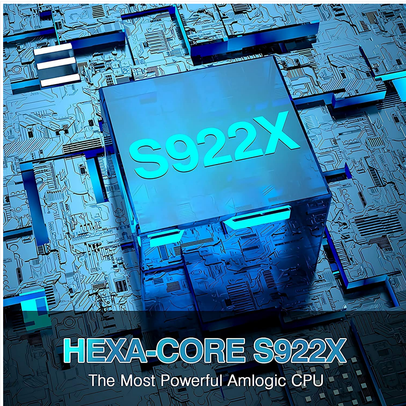
Image: A close-up view of the S922X Hexa-Core Amlogic CPU, highlighting the powerful processing unit of the console.