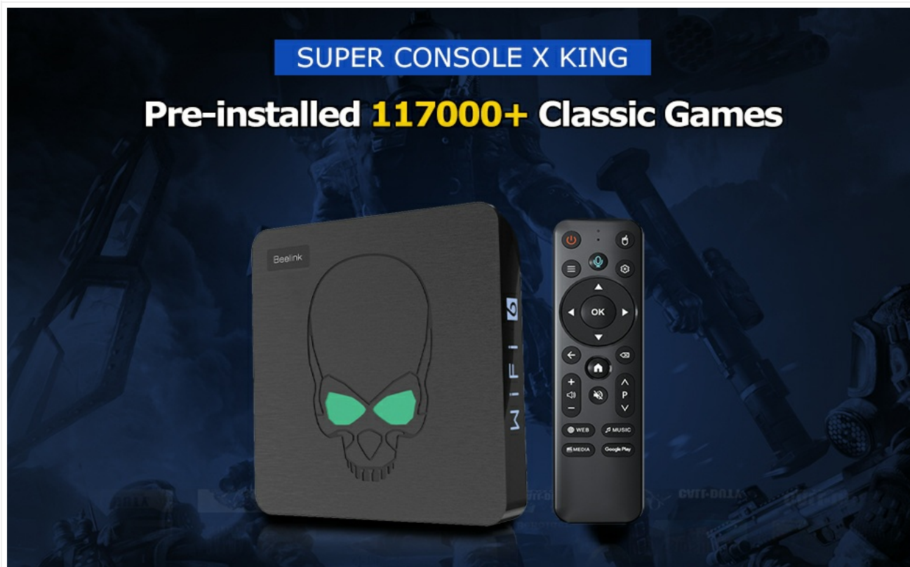
Image: The Kinbank Super Console X King console with a remote, showcasing its capability to run over 117,000 classic games.