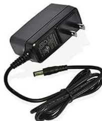
5 POWER ADAPTER * 1