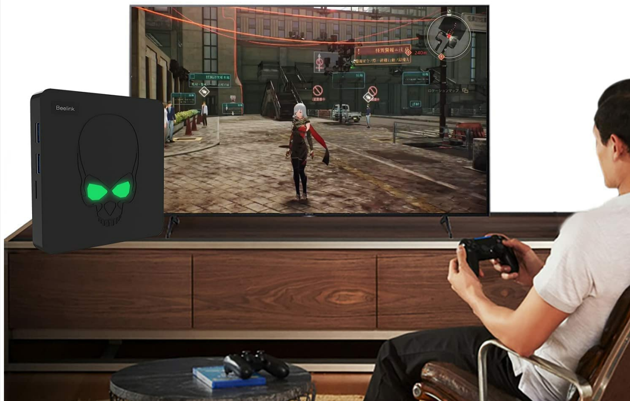
Image: A user playing a game on a 4K television, demonstrating the 4K HD output capability of the Kinbank Super Console X King.