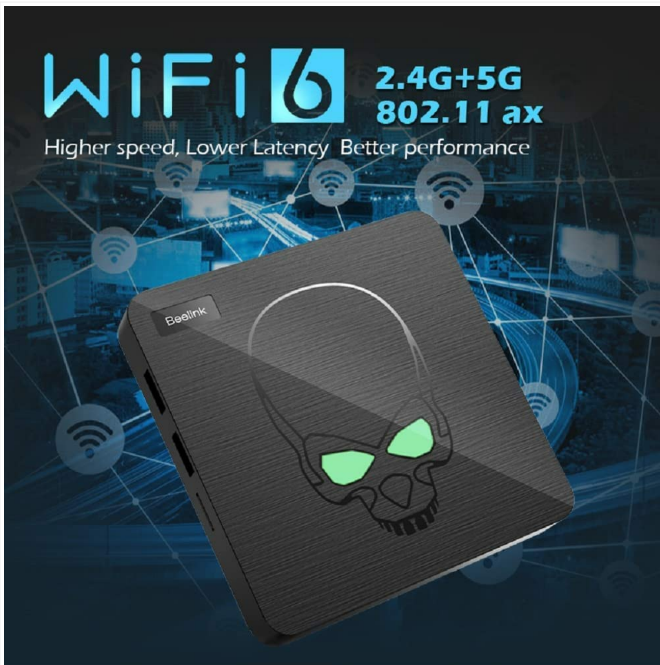
Image: The console unit with an overlay indicating WiFi 6 (2.4G+5G) and Gigabit Ethernet for high-speed network connectivity.