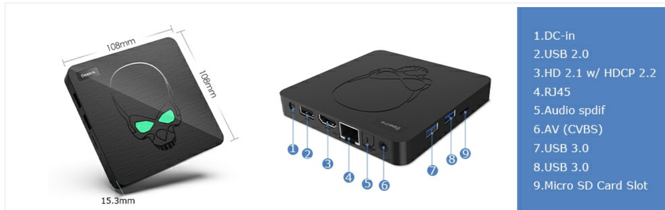
Image: A diagram illustrating the various ports on the Kinhank Super Console X King, including DC-in, USB 2.0, HD 2.1, RJ45, Audio SPDIF, AV (CVBS), USB 3.0, and Micro SD Card Slot.