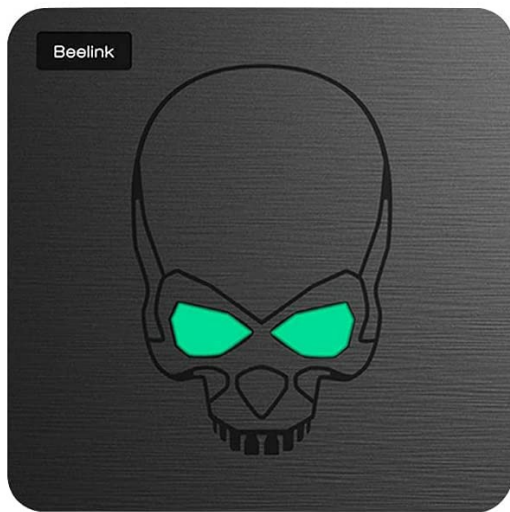
1 Beelink GT KING S922X Box*1