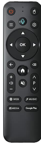
2 REMOTE * 1