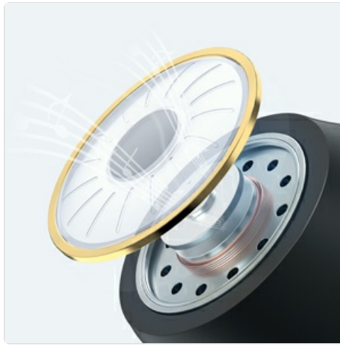
Image: A close-up diagram showing the internal components of an earbud, highlighting the speaker driver and microphone placement for noise cancellation.