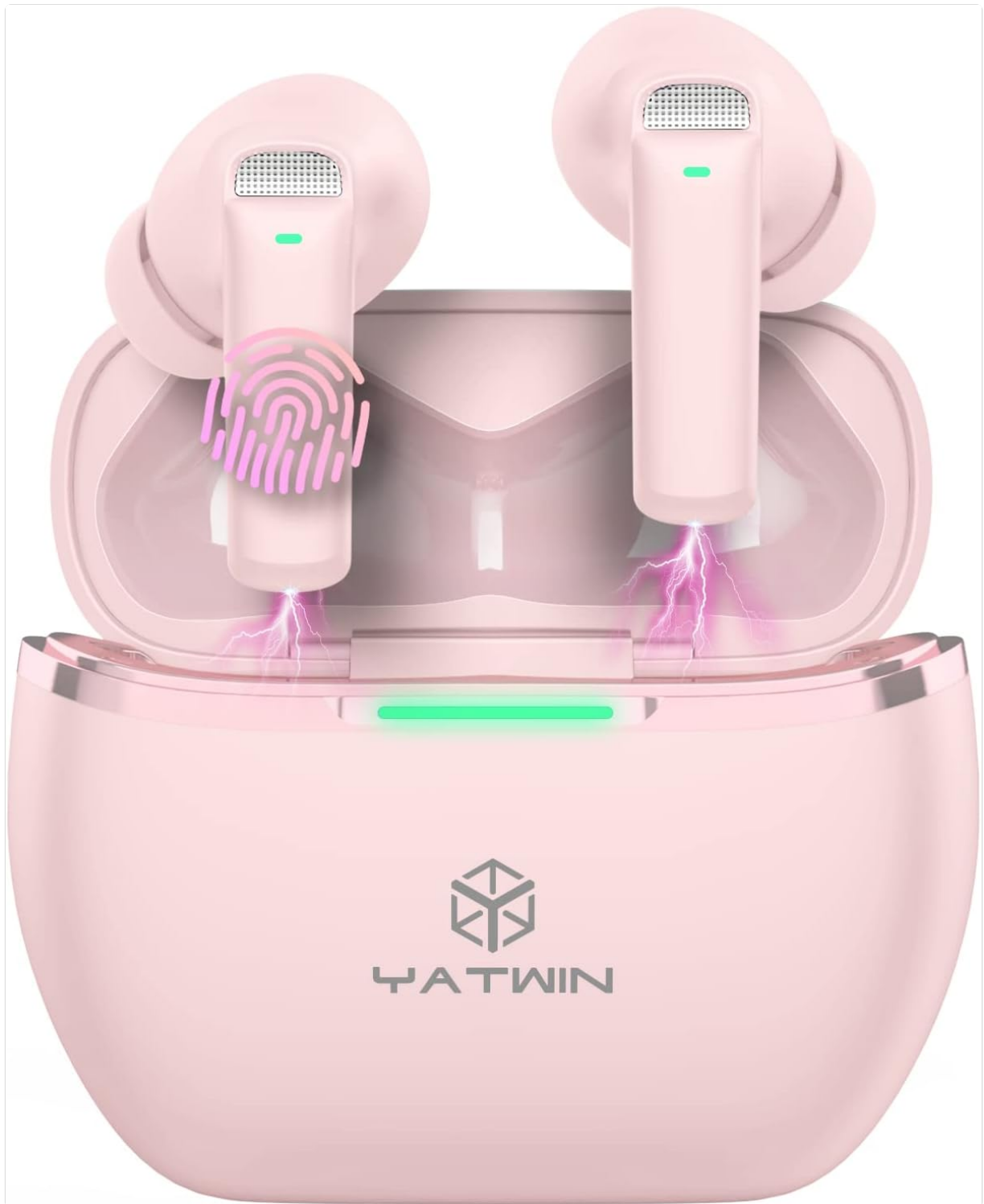
Image: The YATWIN Flybuds F18 earbuds in their open charging case, showcasing the pink color and design. The earbuds are shown with a touch control area indicated by a fingerprint icon.

The earbuds feature touch control areas for various functions, LED indicators for status, and multiple microphones for call clarity and noise cancellation. The charging case protects the earbuds and provides additional battery life.