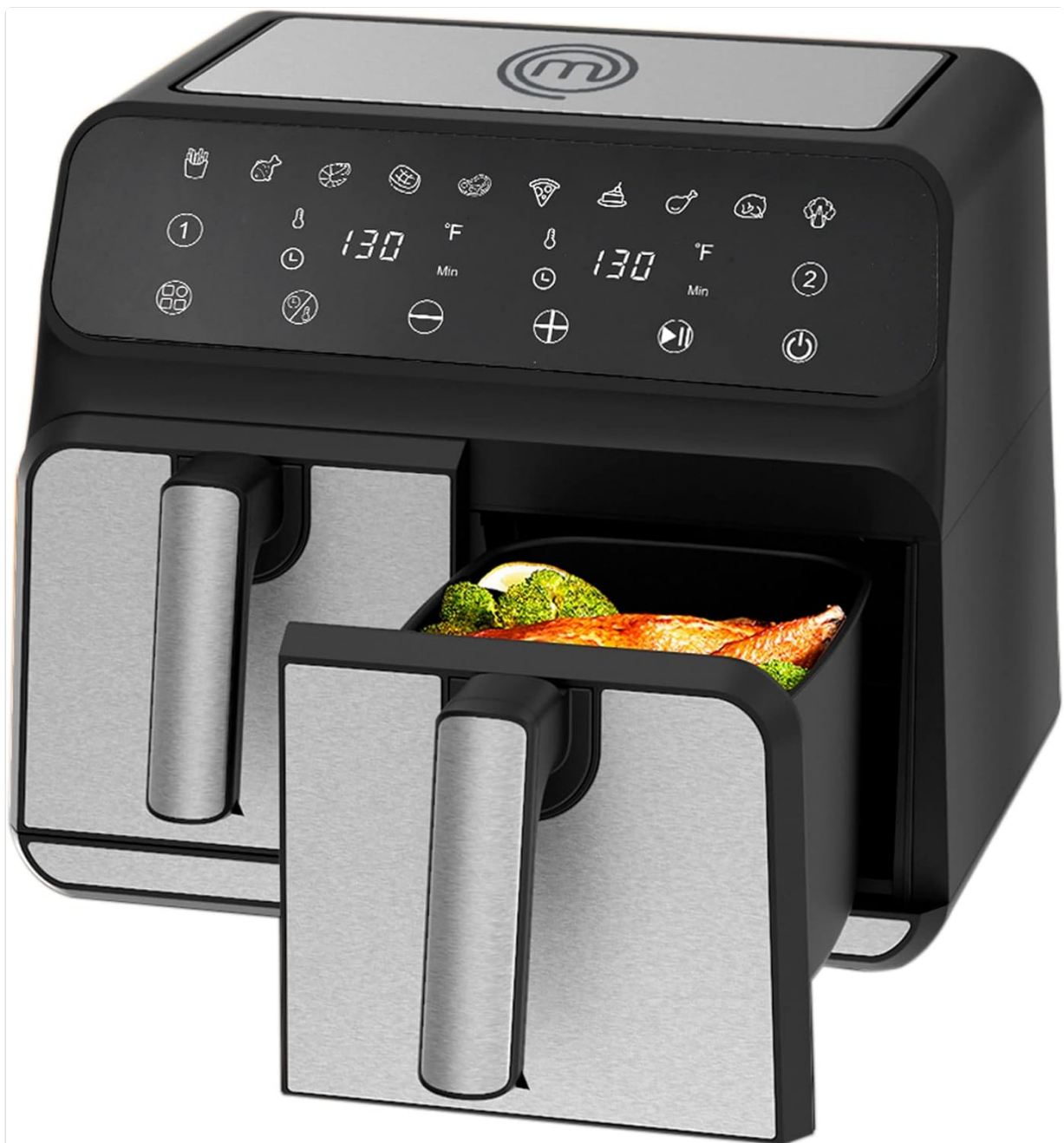
Image: Front view of the Hukën Dual Basket Air Fryer with one basket partially open, revealing food inside.

Familiarize yourself with the main components of your Hukën Dual Basket Air Fryer: