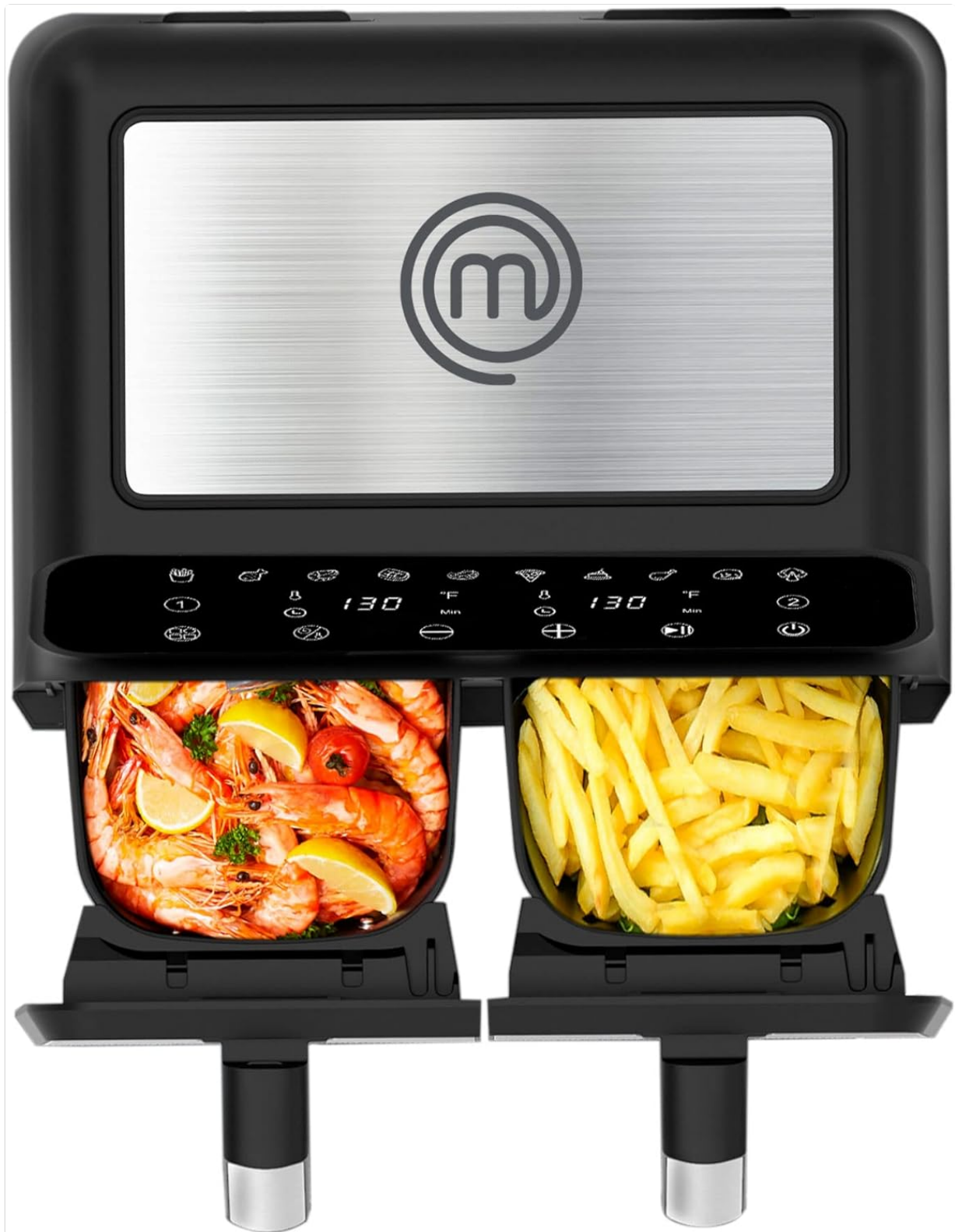
Image: Top view of the air fryer with both baskets pulled out, demonstrating different foods (shrimp and fries) being prepared simultaneously.