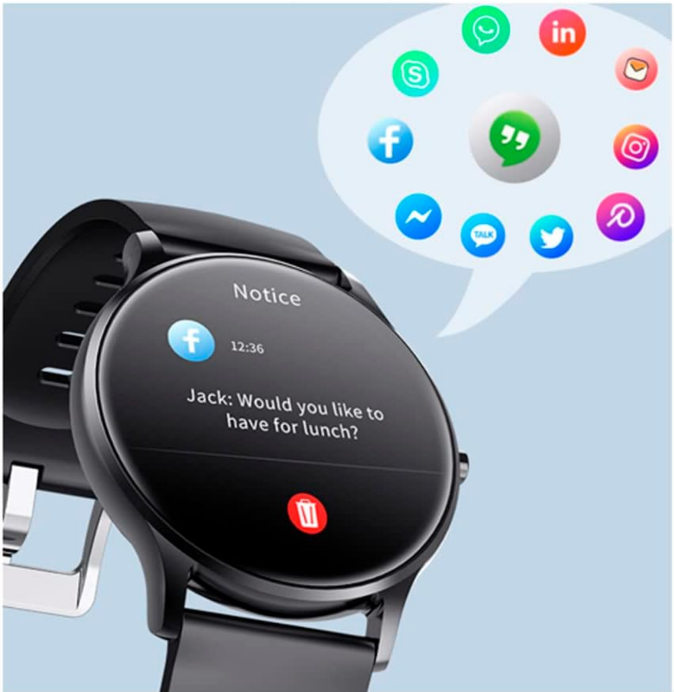
Image 3.3: The smartwatch screen showing an incoming message notification from Facebook.