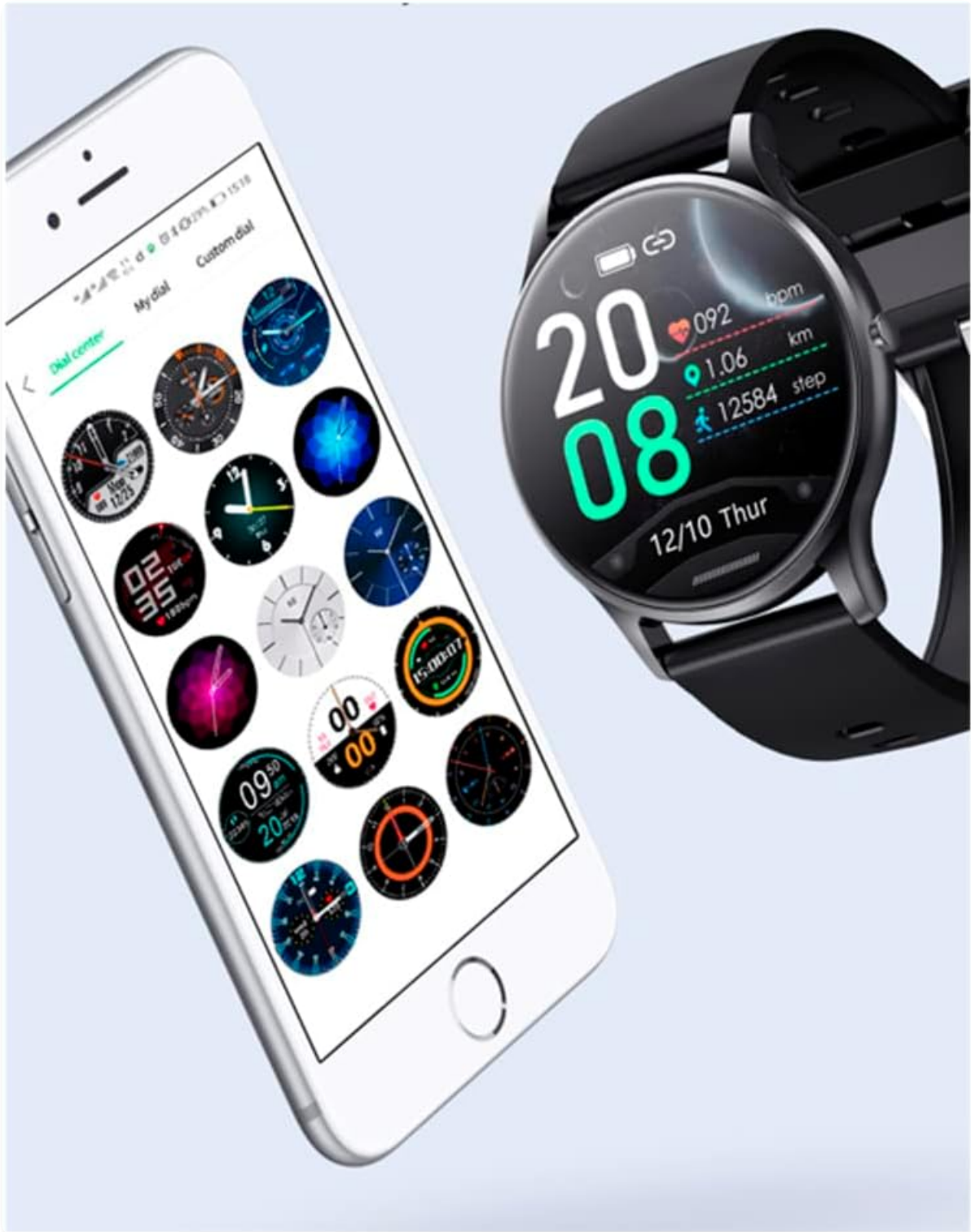
Image 3.4: The companion app's 'Dial Center' displaying multiple watch face options for customization.