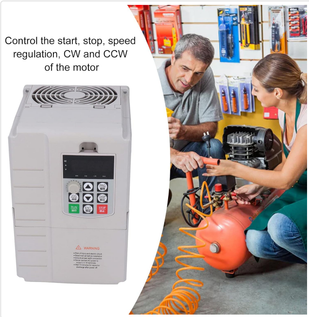
Image: The Jectse AT904-7.5KW VFD positioned in the foreground, with two individuals in the background working on an air compressor, illustrating the VFD's role in controlling industrial equipment.

Control the start, stop, speed regulation, CW and CCW of the motor