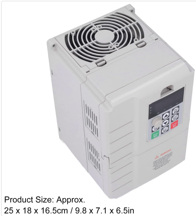
Image: The Jectse AT904-7.5KW VFD from an elevated perspective, highlighting its compact size and dimensions, which are approximately 25 x 18 x 16.5 cm.