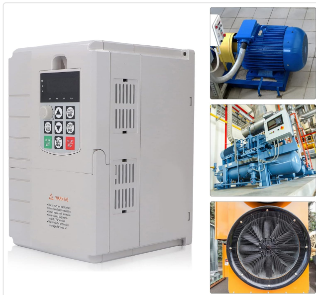
Image: The Jectse AT904-7.5KW VFD unit displayed alongside smaller images of a motor, a chiller unit, and a large fan, illustrating the diverse range of industrial equipment it is designed to control.