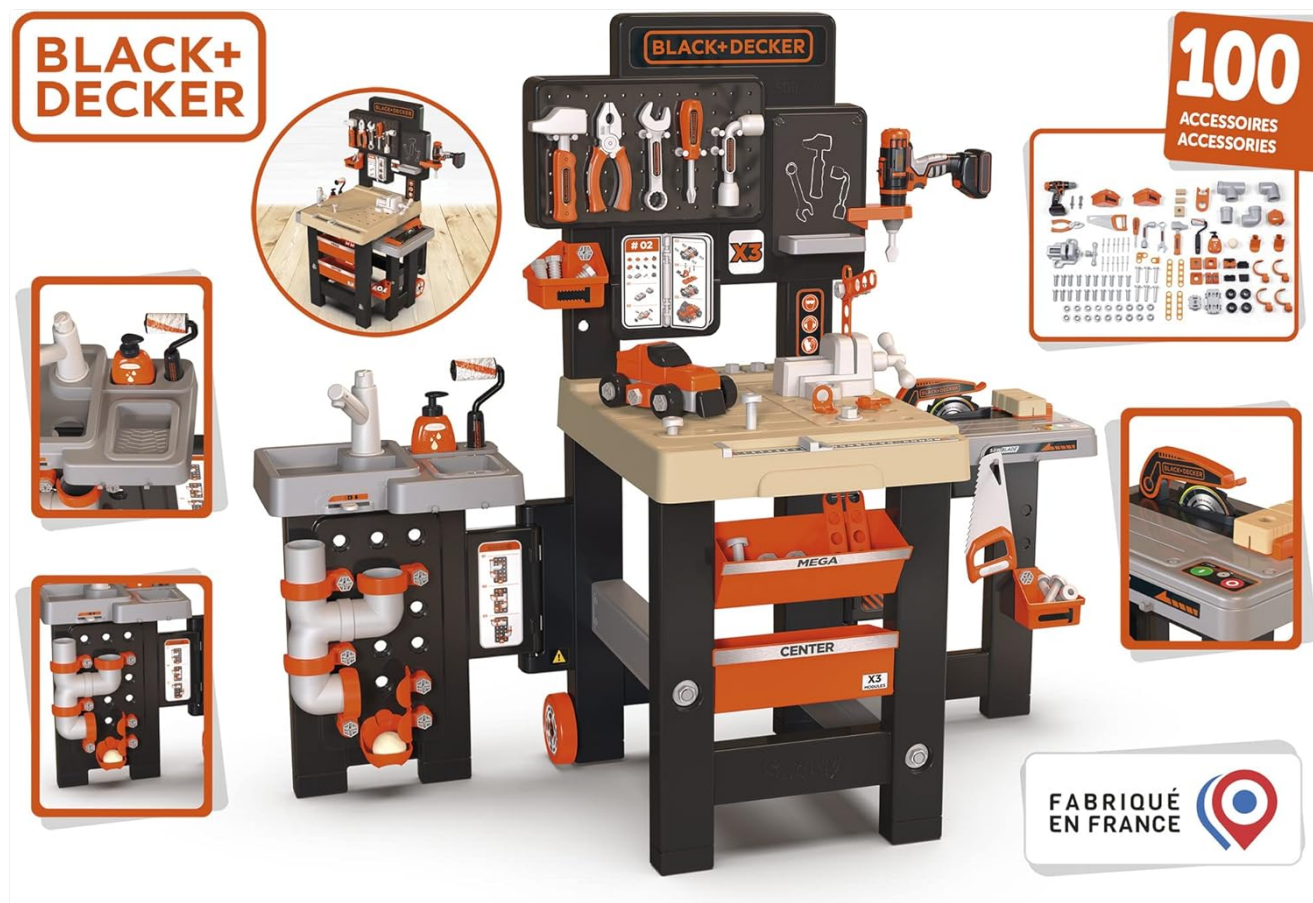
Image 1.1: The Smoby Black+Decker Mega Center Toy Workbench, showcasing its three distinct play areas and included accessories.

The Smoby Black+Decker Mega Center is a comprehensive toy workbench designed to introduce children to various DIY activities. It features three distinct play areas: mechanical, plumbing and painting, and carpentry. This versatile center is foldable and equipped with wheels for easy transport and storage. It comes with 100 accessories to enhance the play experience.