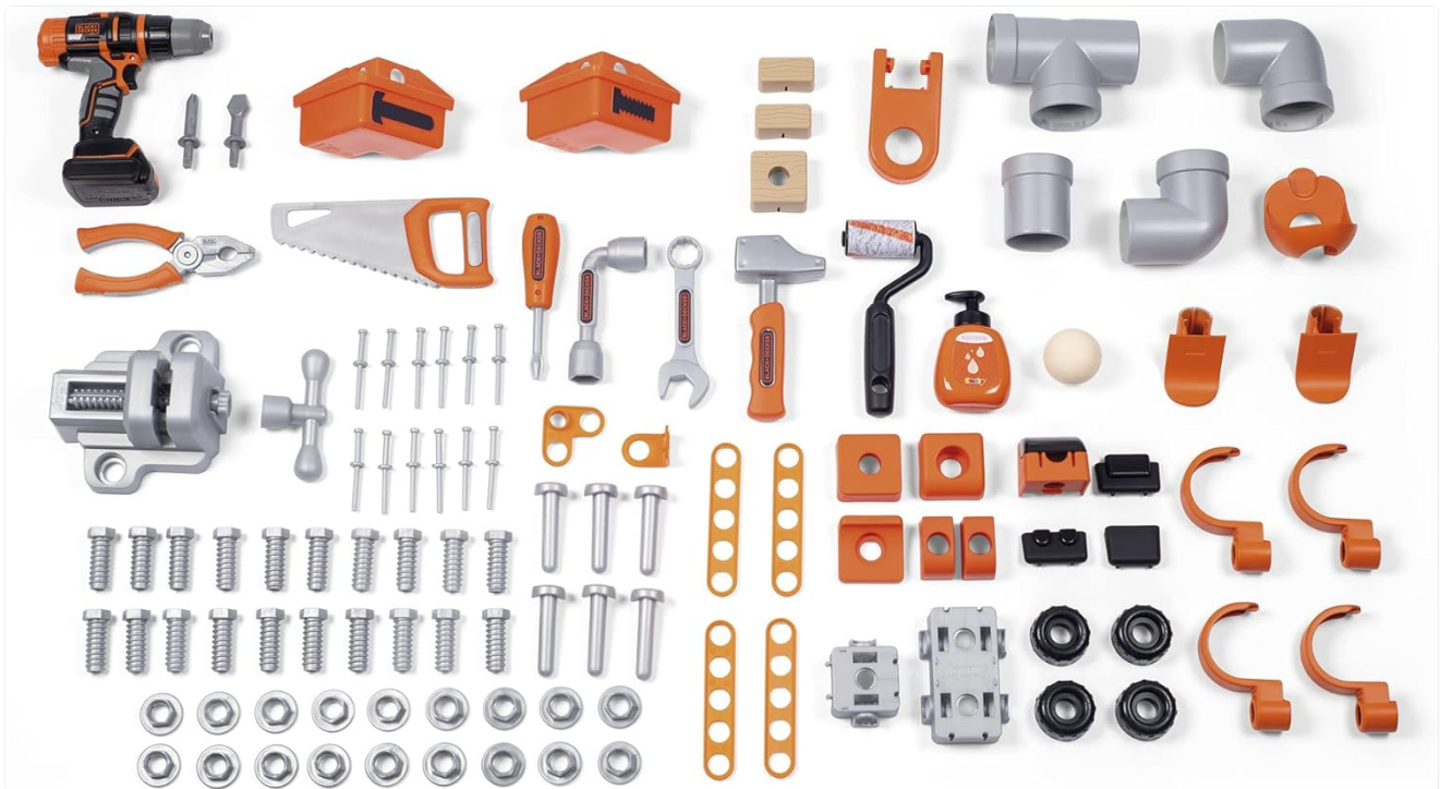
Image 1.2: A detailed view of the 100 accessories provided with the workbench, including various tools, screws, nuts, and construction parts.