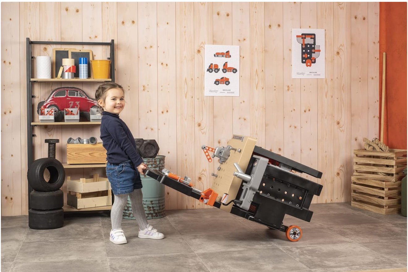
Image 4.4: A child demonstrating the easy transport of the folded workbench using its wheels.