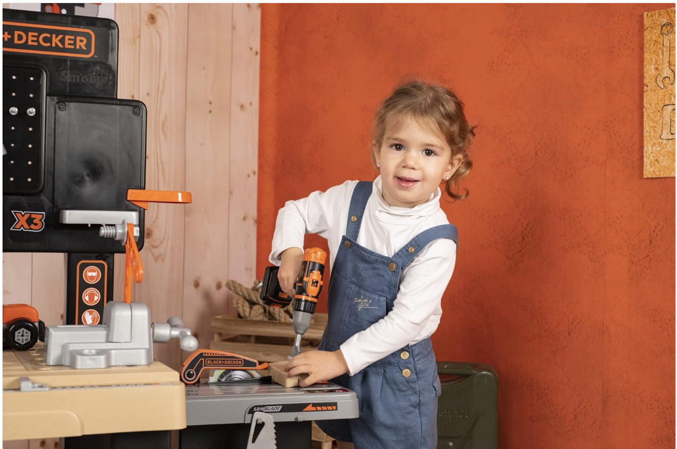
Image 4.3: A child operating the toy circular saw in the carpentry area.