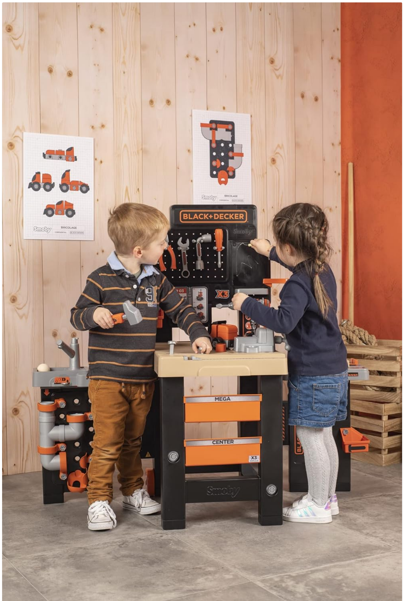
Image 4.2: A child connecting pipes in the plumbing section of the workbench.