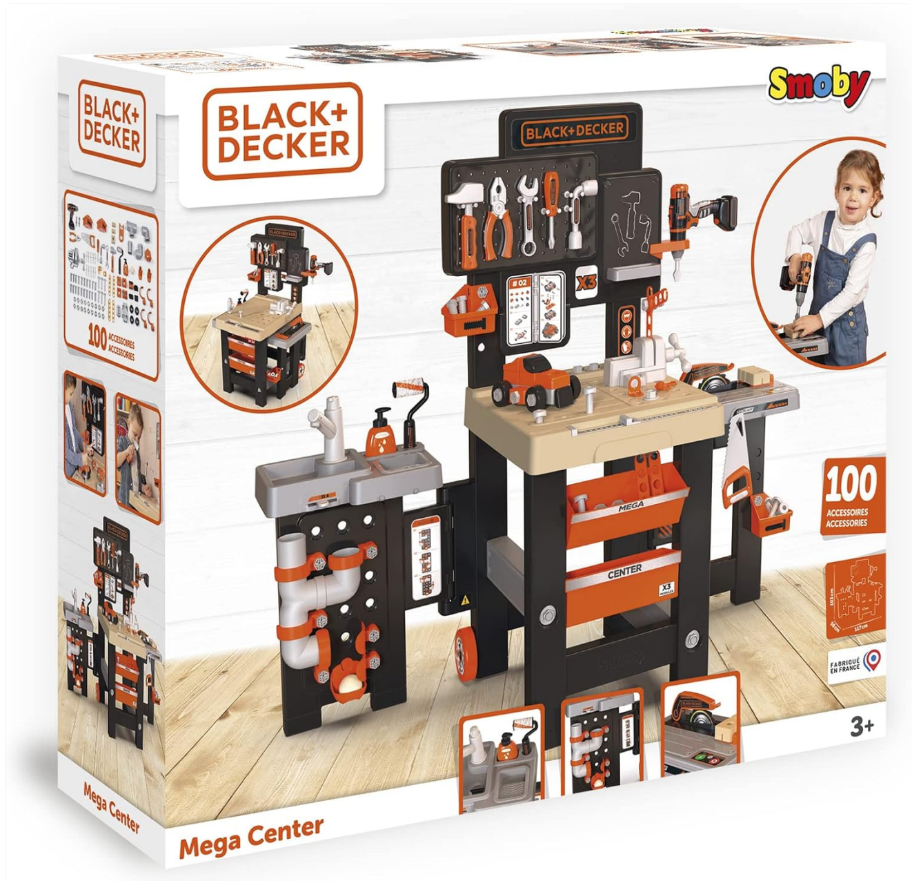
Image 3.1: The product packaging, indicating the contents and age recommendation.