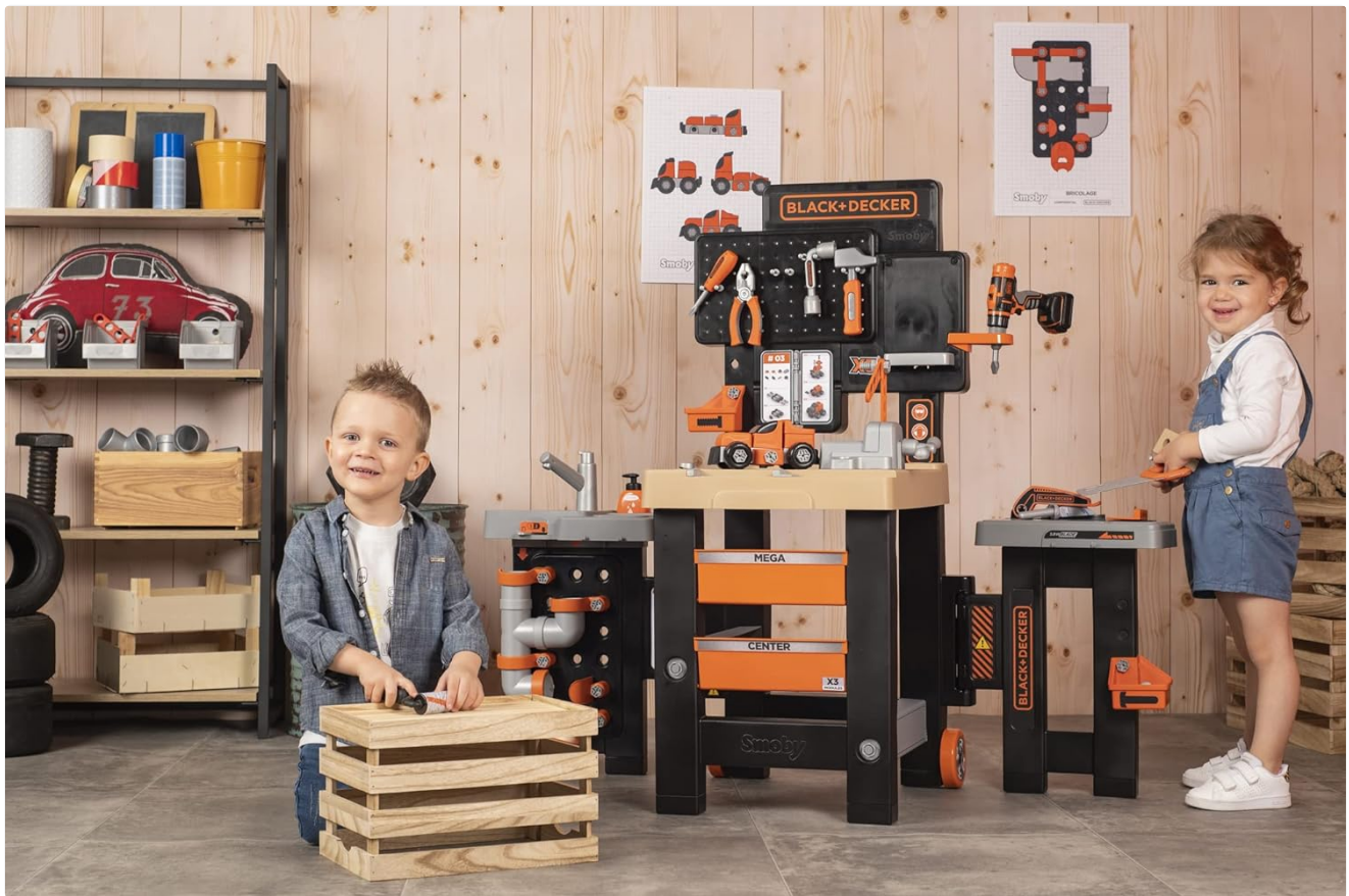
Image 4.1: A child engaging with the mechanical area, using a toy hammer.