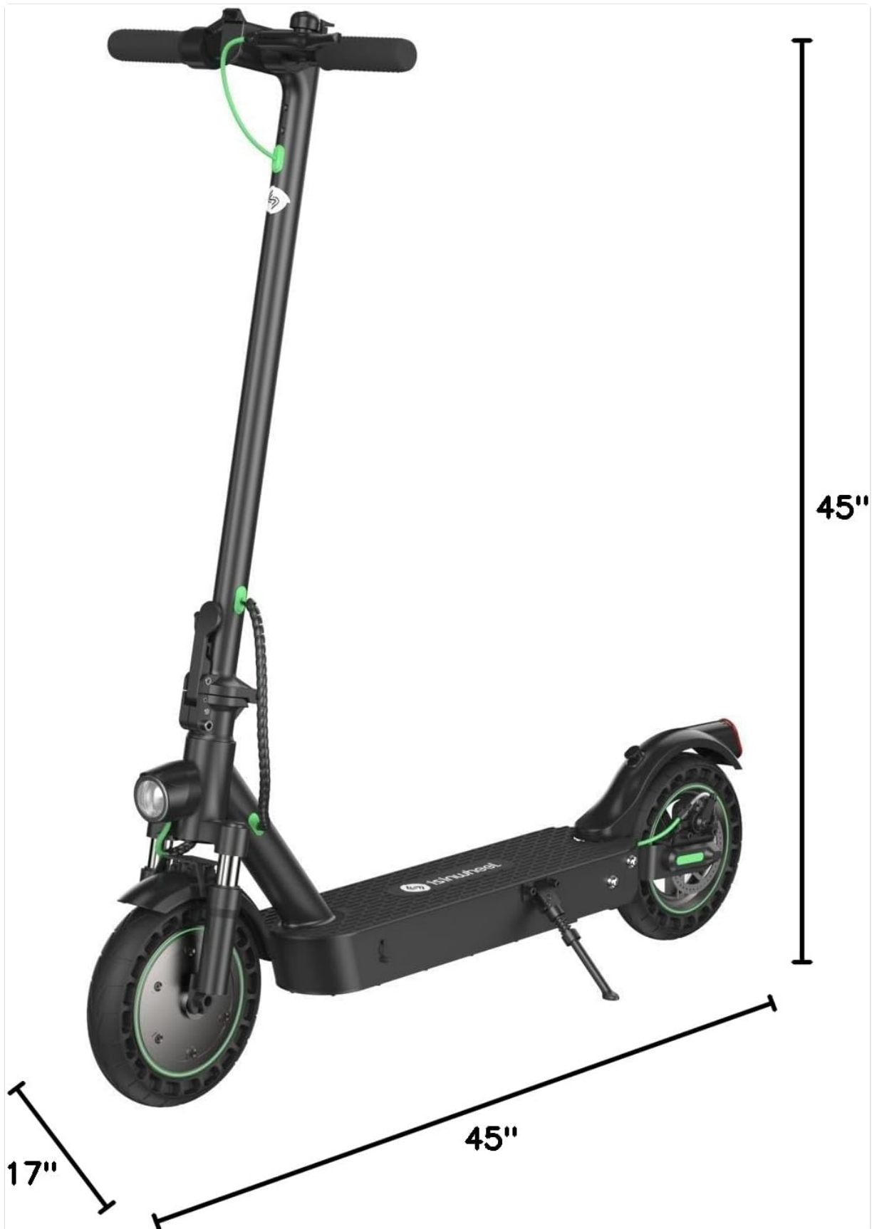
An image illustrating the scooter's dimensions, with a focus on the durable 10-inch solid tires that do not require air.