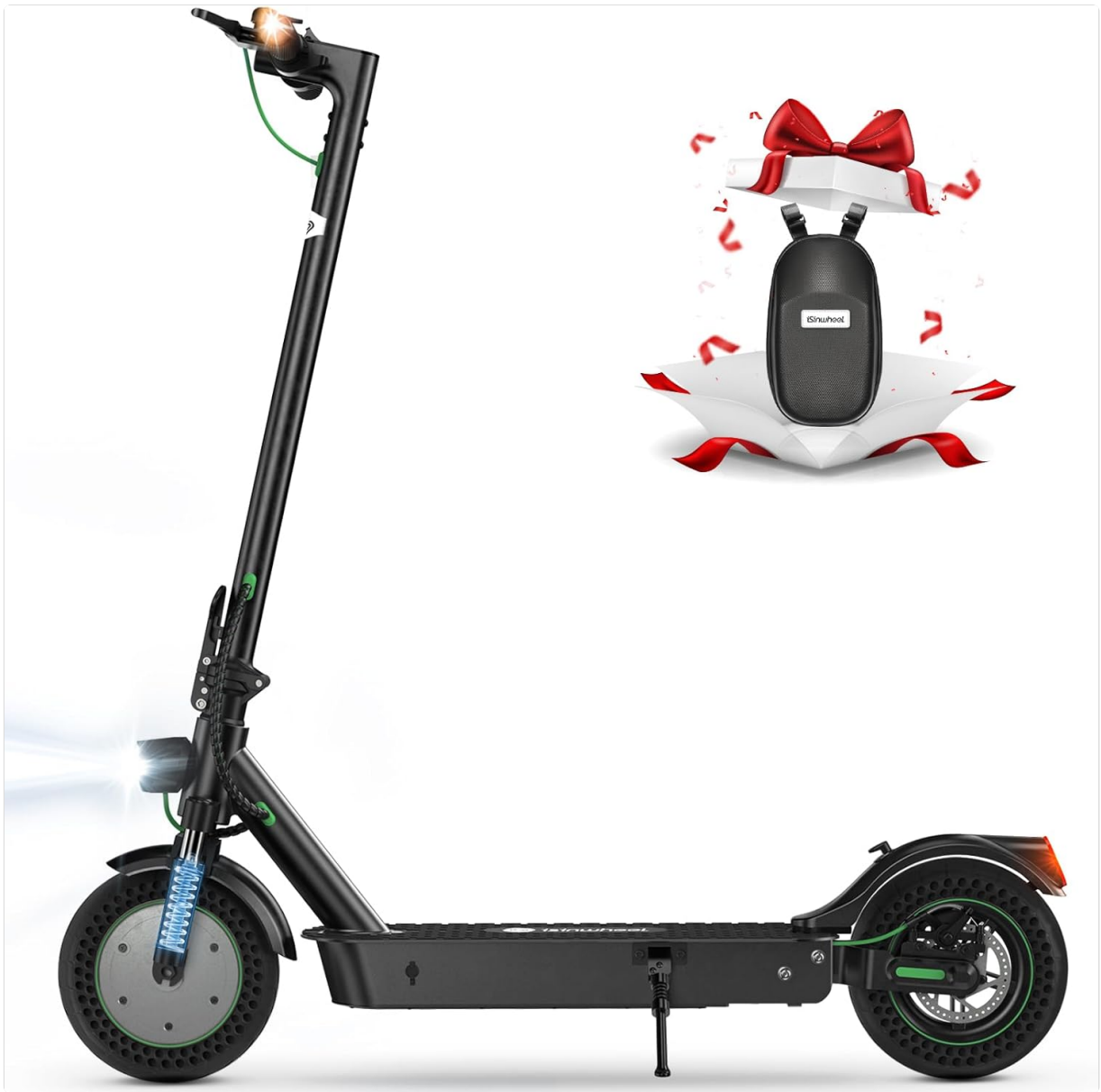
The isinwheel S9 Max Electric Scooter in black, showcasing its sleek design and integrated handlebar bag.