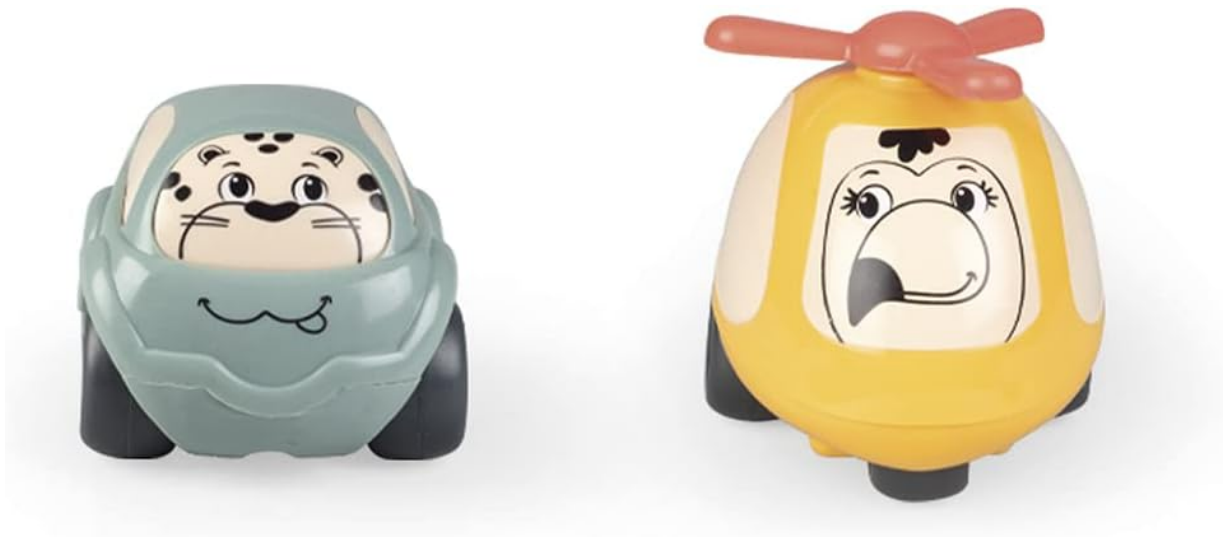
Image 3.2: Close-up of the two distinct toy vehicles included with the parking garage: a blue car and a yellow helicopter.