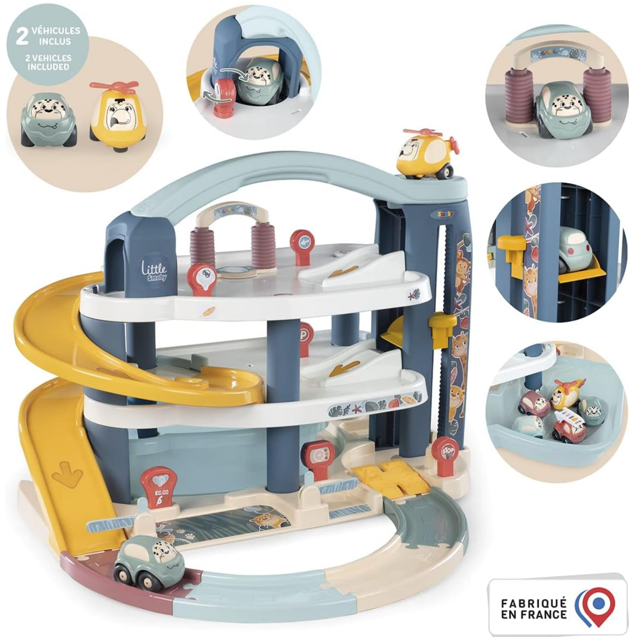
Image 3.1: An exploded view showing the main features of the parking garage, including the two included vehicles, the car wash, and the lift mechanism.