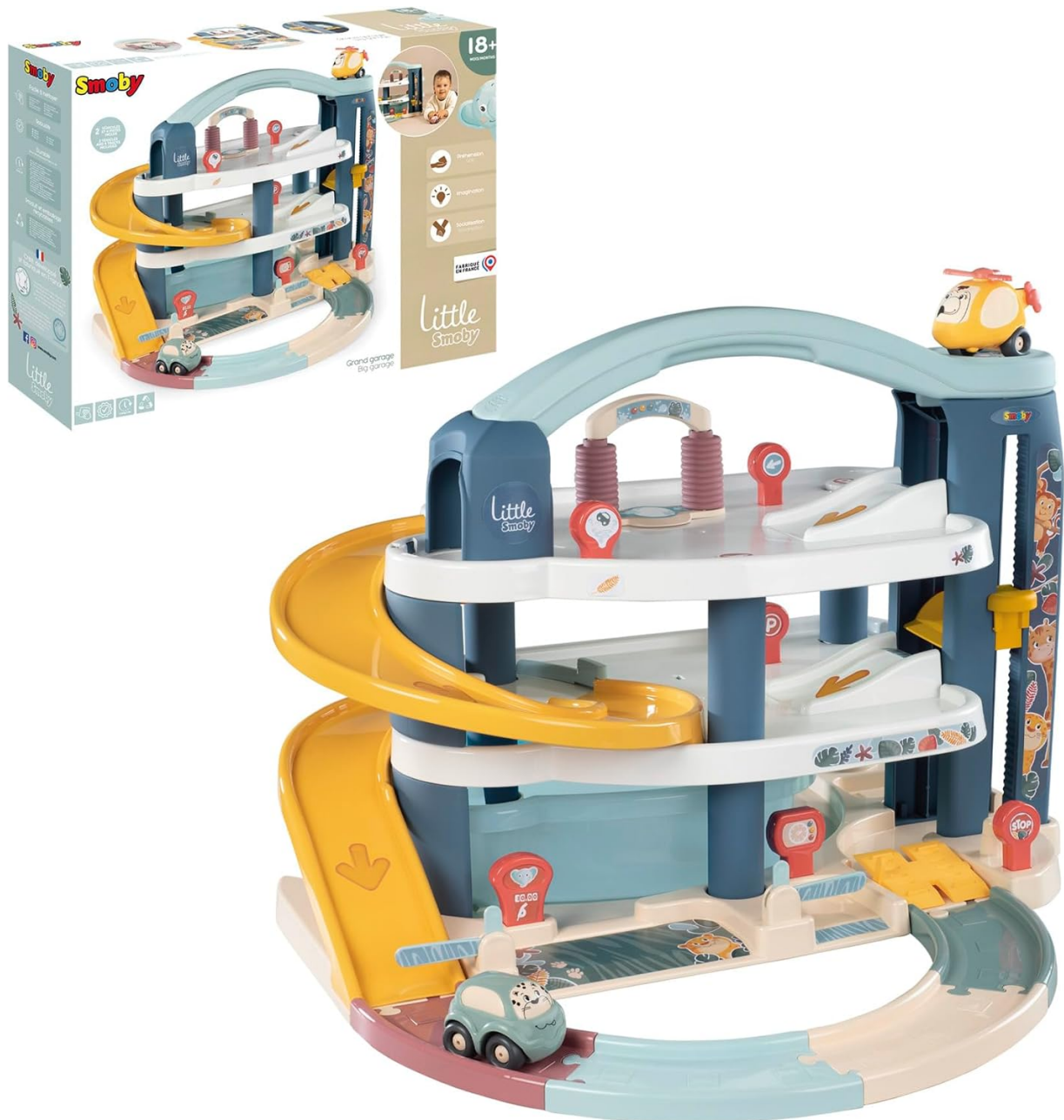
Image 1.1: The Smoby Little Smoby Large Parking Garage, showcasing its multi-level design, ramp, lift, and included vehicles. The product packaging is visible in the background.