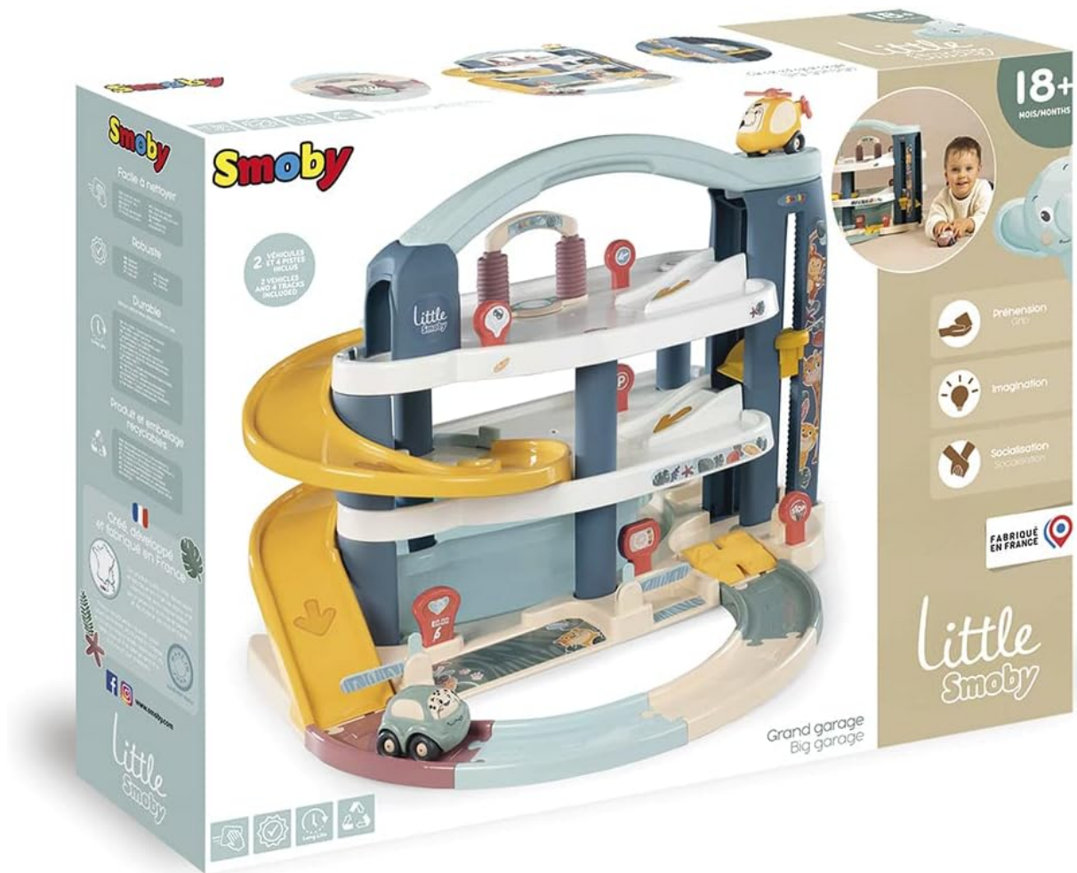
Image 4.1: The product packaging, which contains visual guides and instructions for assembly.