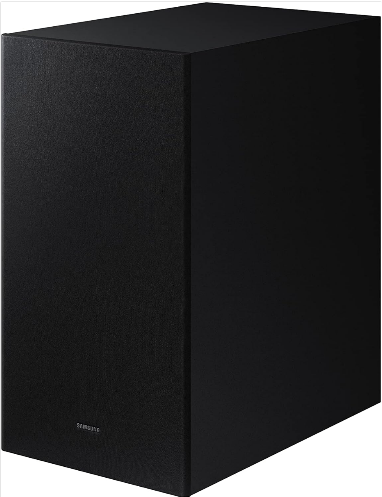
Image: A detailed view of the Samsung wireless subwoofer, highlighting its minimalist design and textured finish.