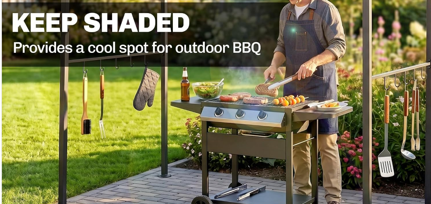
Image: A man grilling under the gazebo, demonstrating how the canopy provides shade for outdoor cooking.