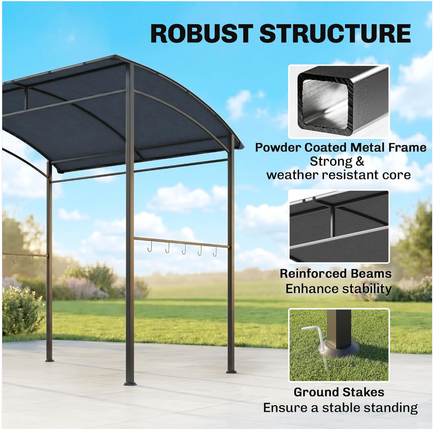
Image: A detailed view of the gazebo's robust structure, including the powder-coated metal frame, reinforced beams, and ground stakes for stability.