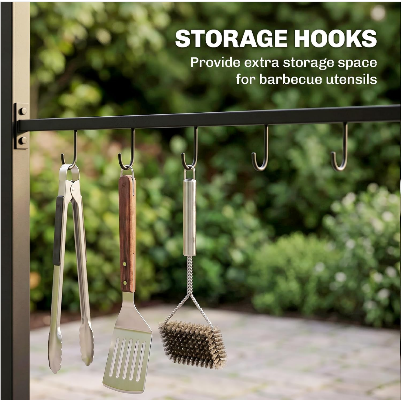
Image: Close-up of the integrated storage hooks on the gazebo frame, designed for hanging barbecue utensils and accessories.

Provide extra storage space for barbecue utensils