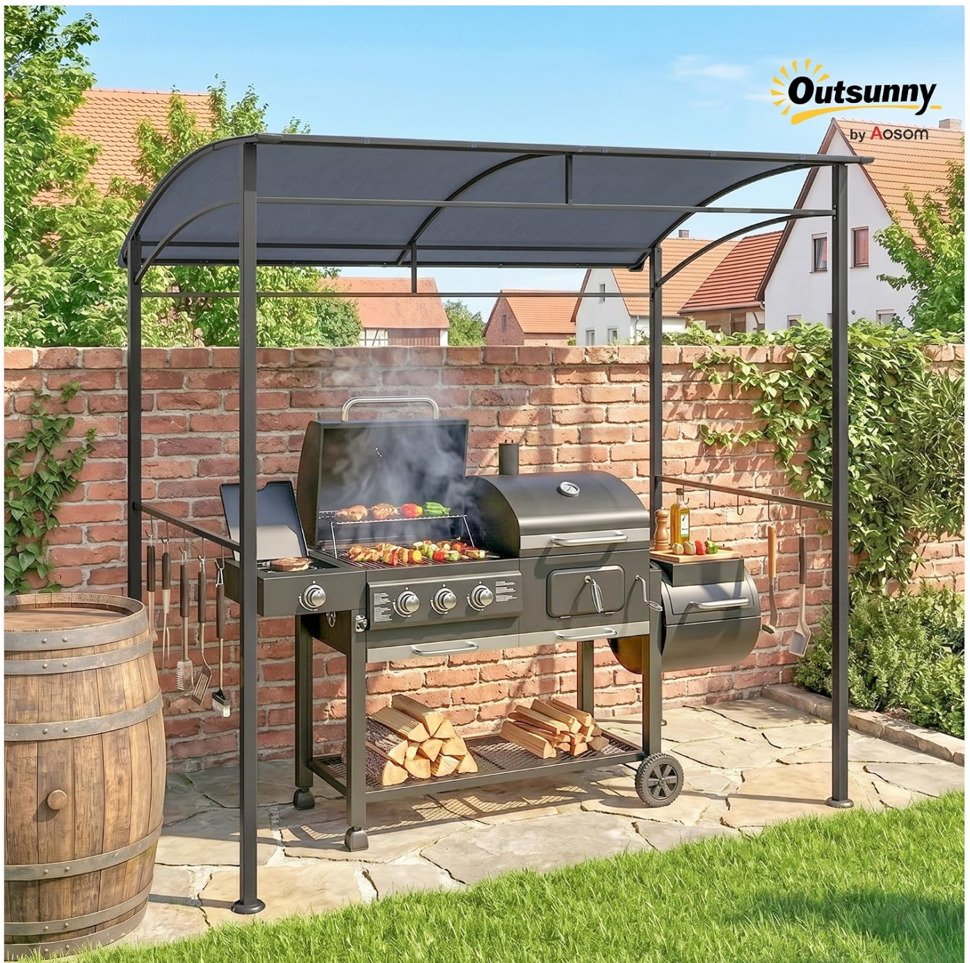
Image: The Outsunny BBQ Grill Gazebo Tent providing shelter for a barbecue grill in an outdoor setting.