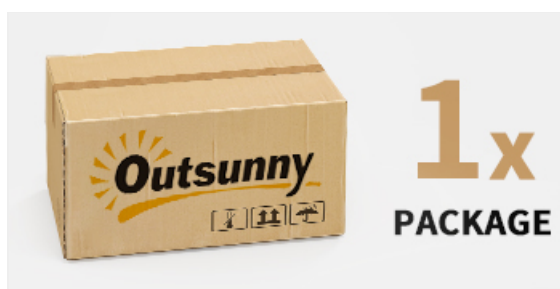
Image: A brown cardboard box with the Outsunny logo, indicating the product comes in one package.