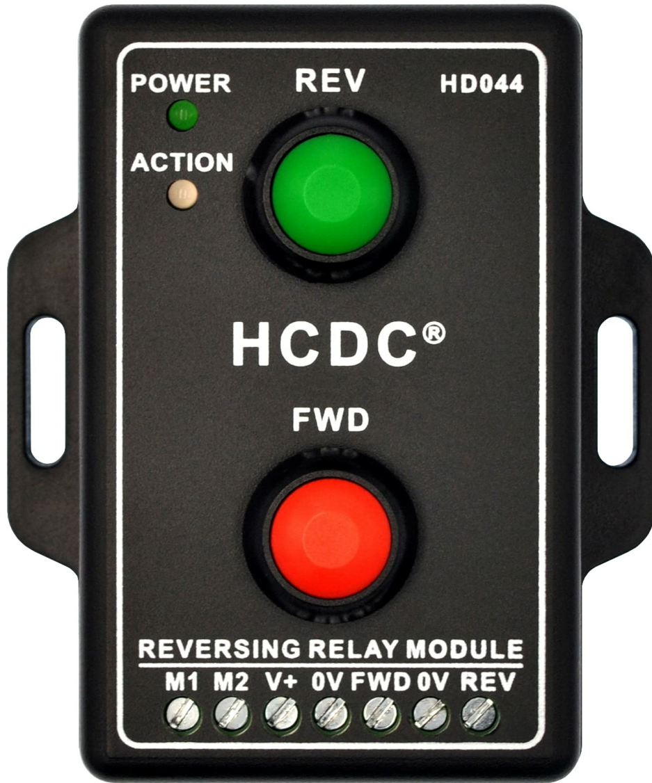
Figure 1: The HCDC HD044 Series Relay Module. This image shows the compact black module with its green 'REV' (Reverse) and red 'FWD' (Forward) push buttons, along with indicator LEDs and screw terminal block.