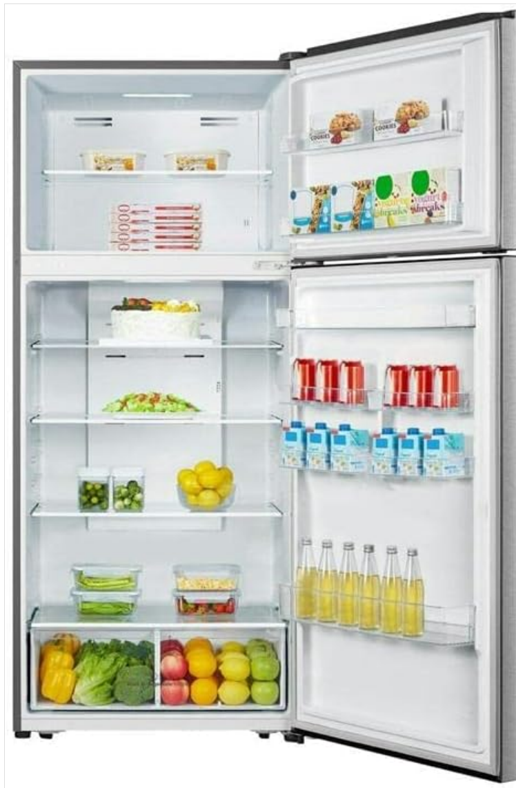
Figure 2: Interior view of the refrigerator compartment, showing shelves and storage.