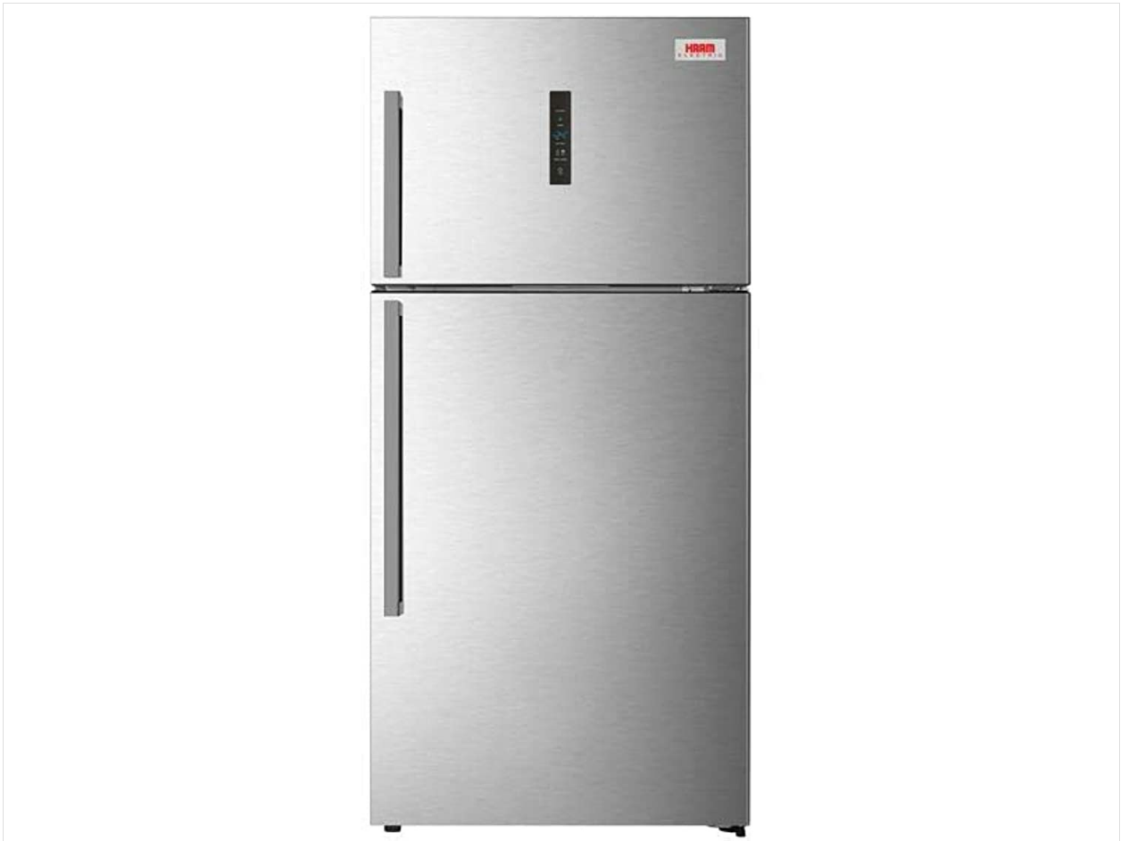
Figure 1: Exterior view of the Haam Electric HM690SRF-H22LINV Refrigerator.