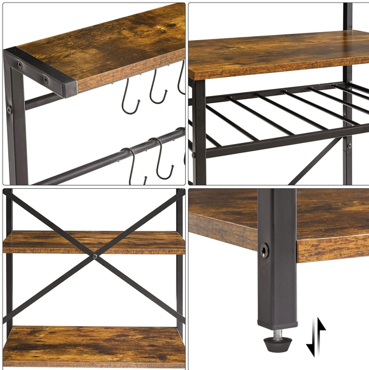
Figure 2: Detailed view of key features including the S-hooks for hanging, the integrated wine rack, the stabilizing X-structure, and adjustable leveling feet.