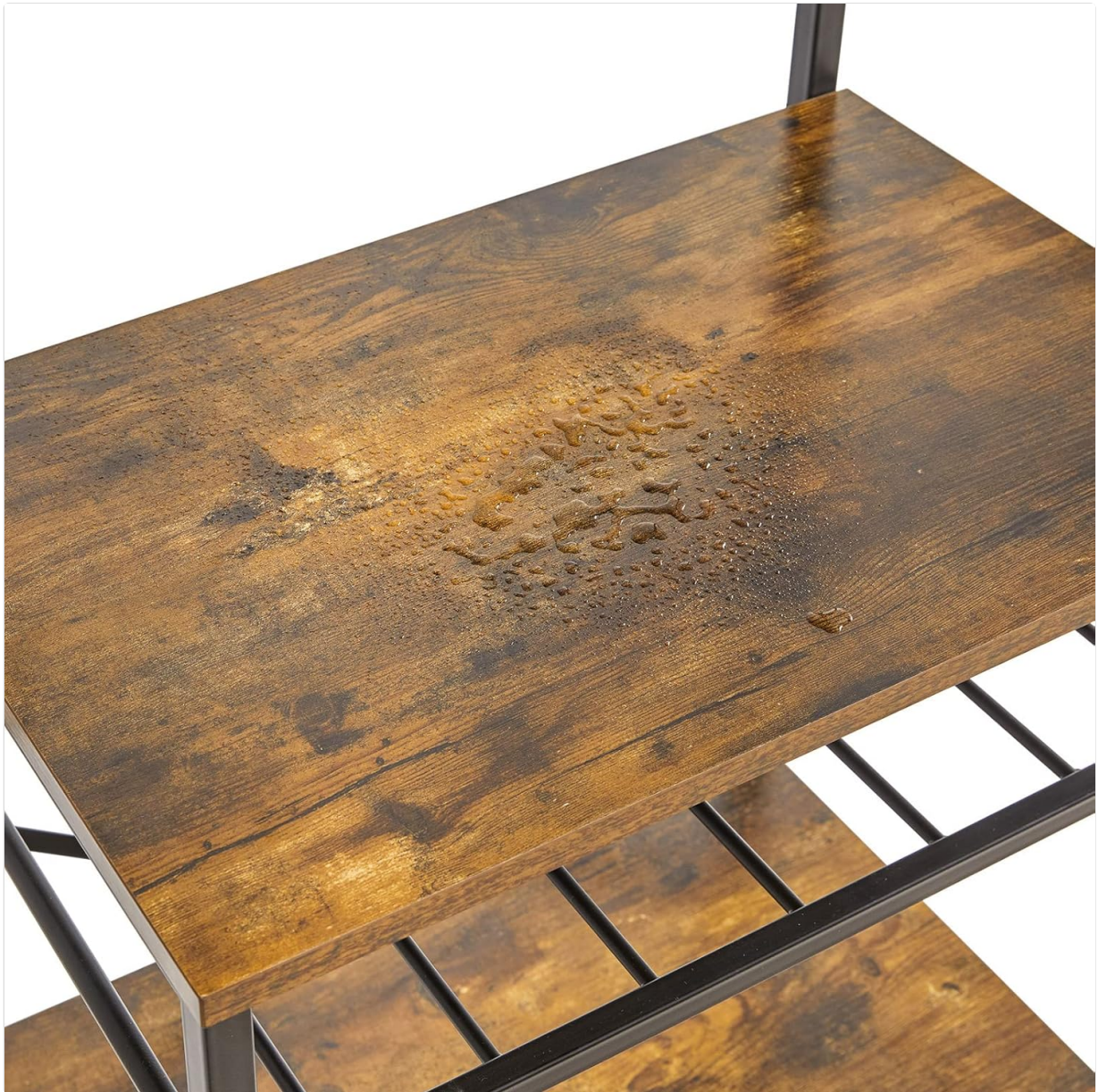
Figure 4: The water-resistant surface of a shelf, highlighting its ease of cleaning and protection against spills.