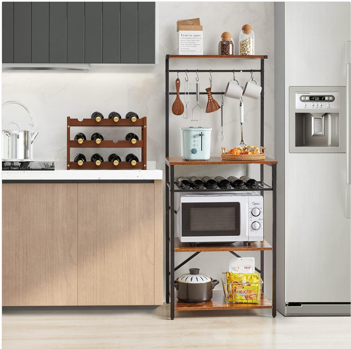
Figure 3: The rack positioned in a kitchen, demonstrating its use for a microwave, wine storage, and hanging kitchen tools.