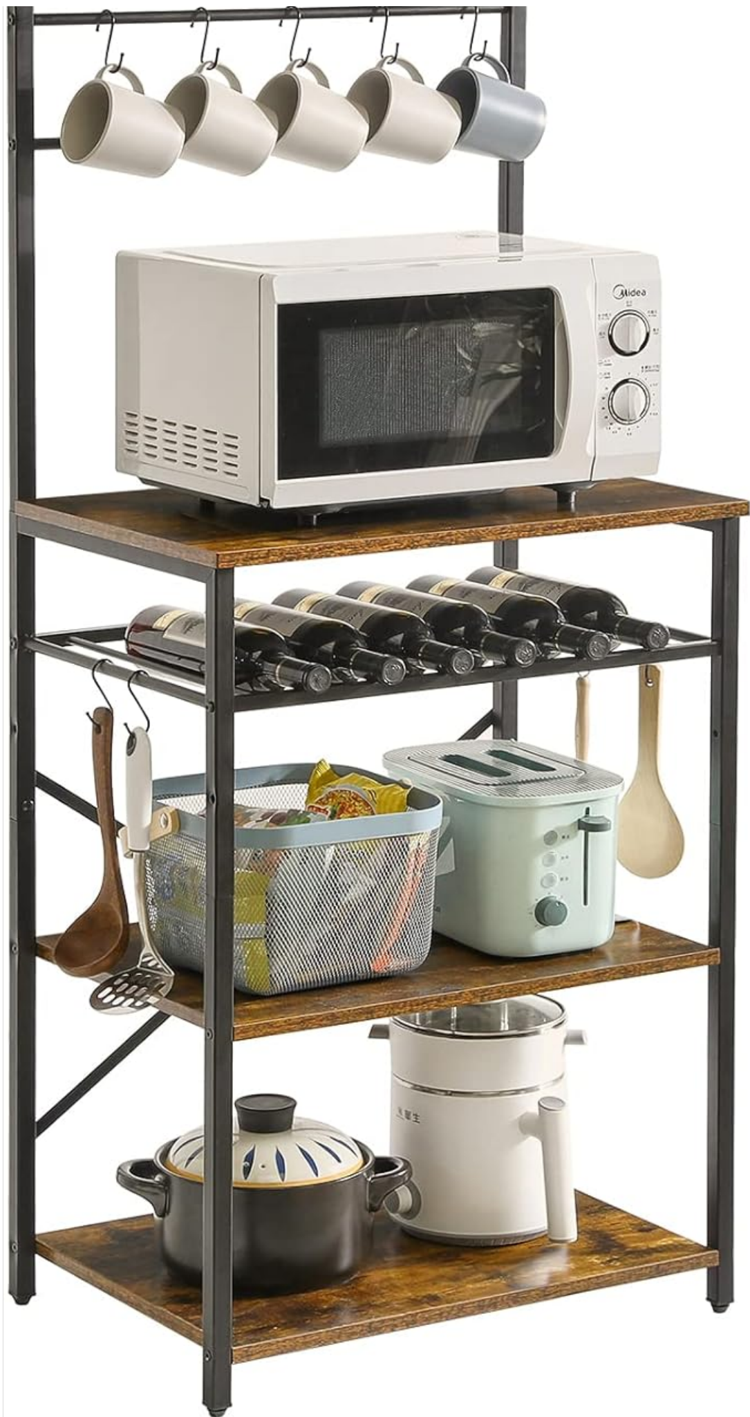
Figure 1: Fully assembled YMYNY Kitchen Baker's Rack, showcasing its multi-functional design with various kitchen items.