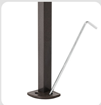
Stakes for Stability

Image: A visual guide showing the three easy setup steps: 1. Open the frame and install the canopy top. 2. Lift the four corner buttons to lock the frame in place. 3. Adjust to desired height.