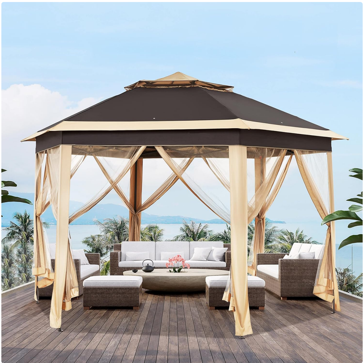
Image: The fully assembled Yaheetech 13x13 Pop Up Hexagonal Gazebo with mesh walls in an outdoor patio setting.