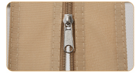
Double Zippered Door