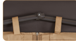
Highly Adhesive Hook & Loop