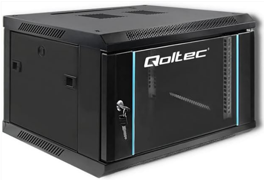
Figure 1: Front view of the Qoltec 19" 6U RACK Cabinet. This image displays the cabinet's front, featuring a glass door with a lock and the Qoltec brand logo.

Qoltec RACK cabinets are designed for storing servers, network peripherals, UPS devices, and switches. Their primary function is to secure equipment, ensure stable operation, and maintain an organized IT environment. These cabinets are utilized across various sectors, including information technology, energy, and general industry. They feature rubber damping feet for stability and an integrated ventilation system, primarily through vents, to manage internal temperatures.