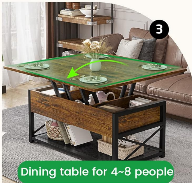
Figure 2: Versatile 3-in-1 lift design.