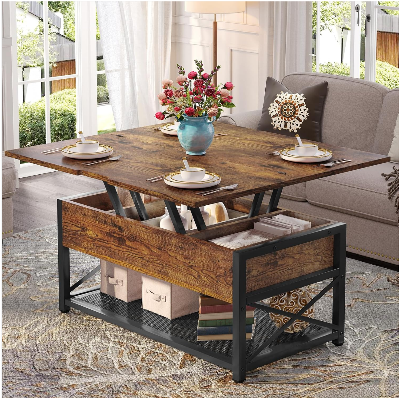
Figure 1: Itaar 43-inch Lift Top Coffee Table in a living room.