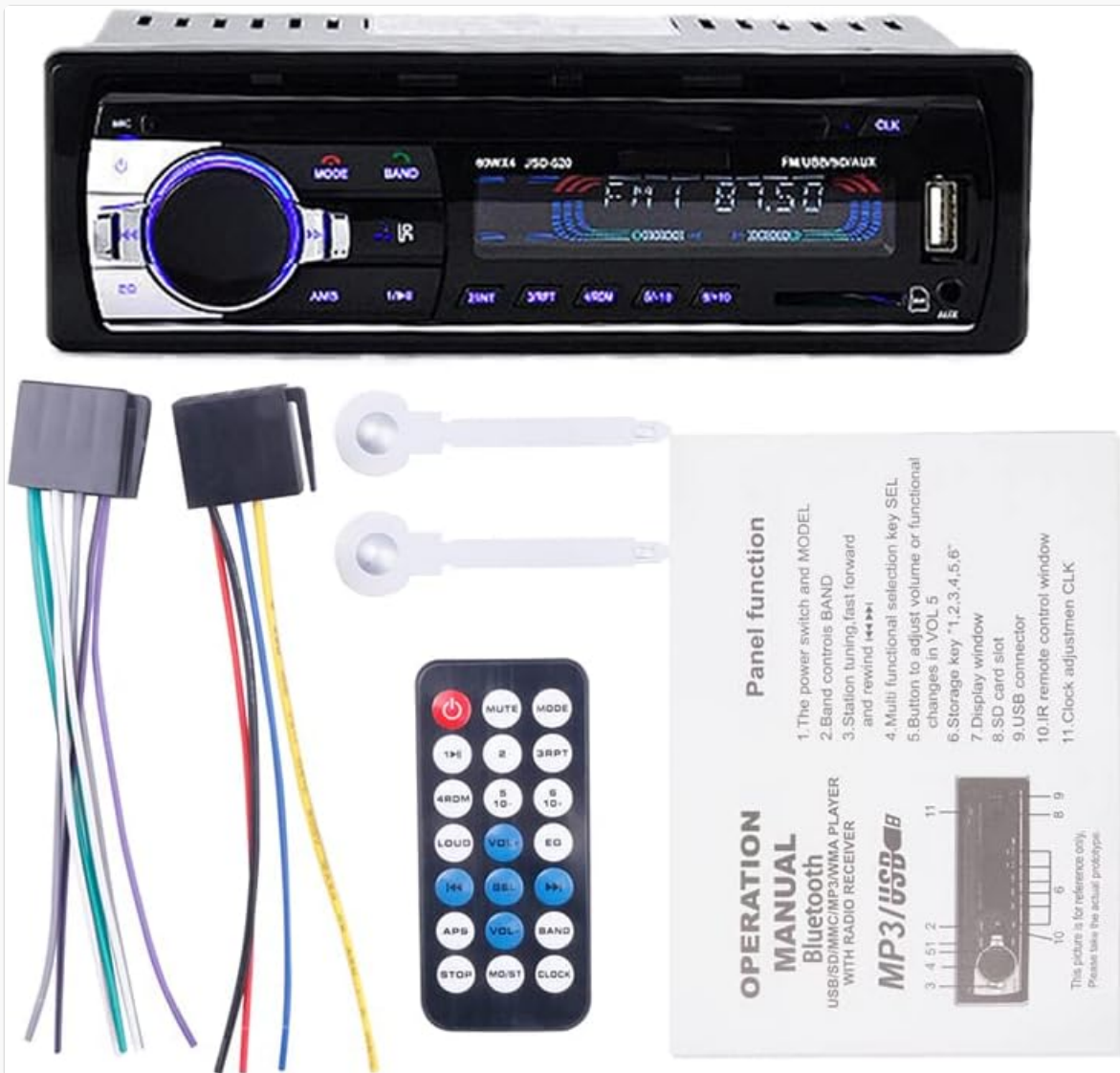
Image 3.1: Contents of the BOOMBOOST JSD520 package, showing the main unit, remote control, wiring harnesses, and user manual.