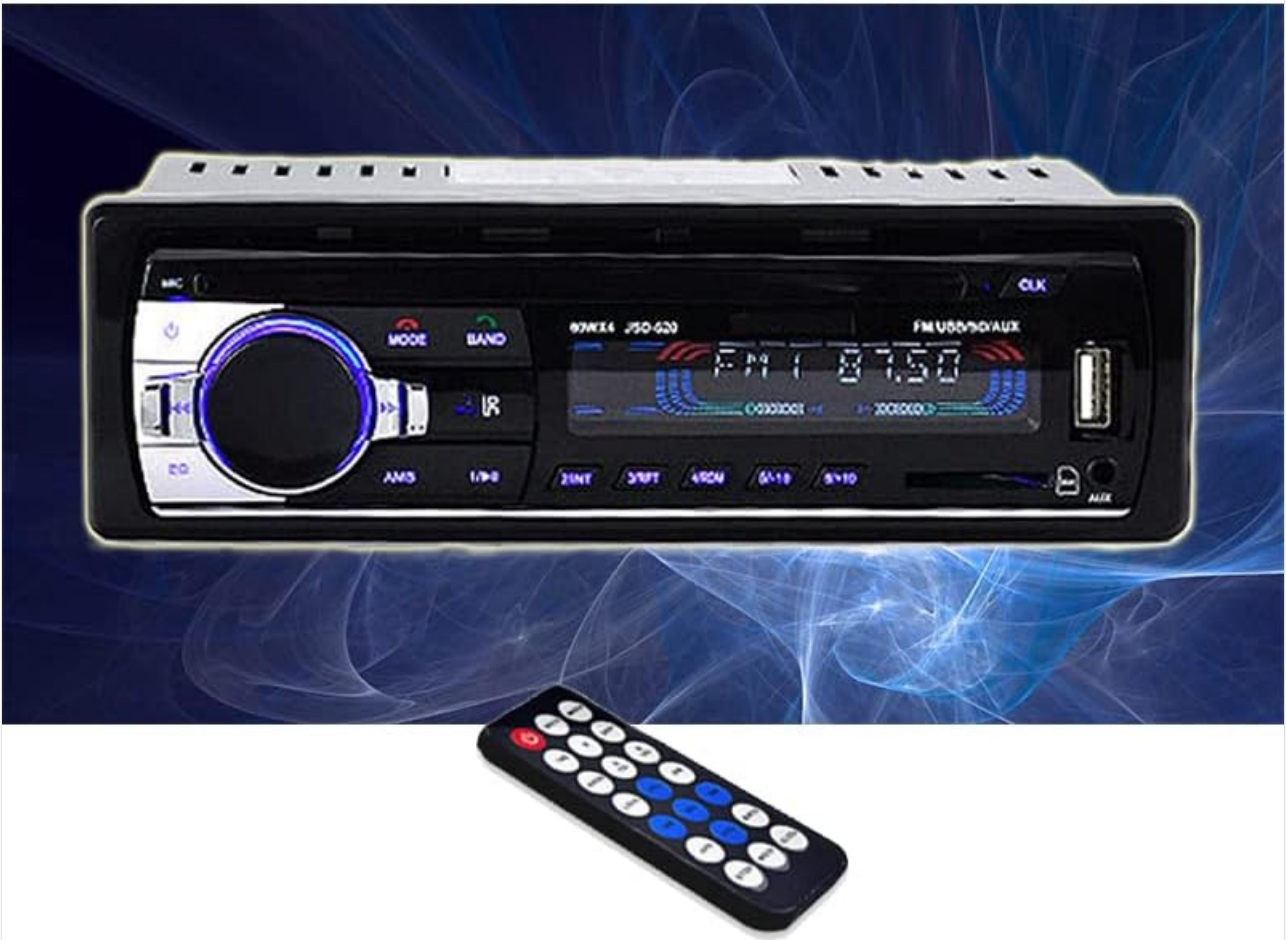
Image 5.4: Quick operation using the remote control for volume and music selection in SD or USB mode.

SD or USB mode. Use the remote control to switch the volume and music.