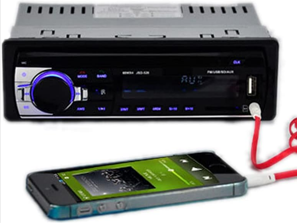
Image 5.3: Demonstration of AUX audio input, allowing external devices to play sound through the car's high-power speakers.

Support external AUX (3.5MM plug) input audio, such as navigation, MPS, mobile phone audio and so on, through the front-end AUX audio input, and output sound from the car's high-power speaker.