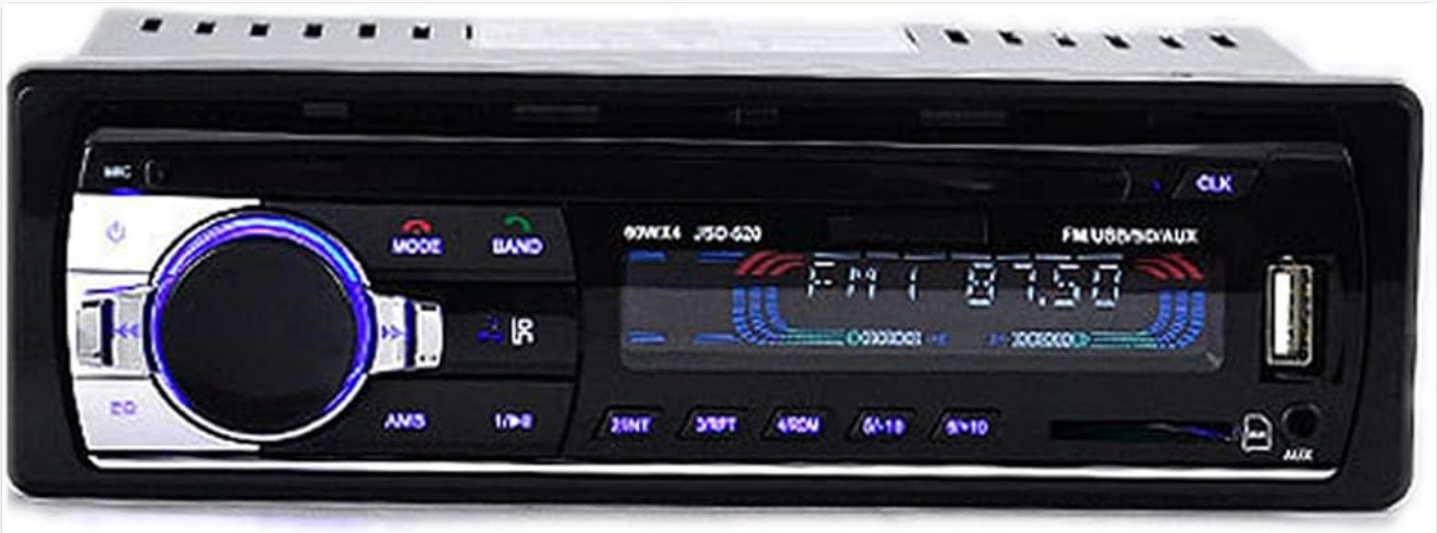
Image 1.1: Front view of the BOOMBOOST JSD520 Car MP3 Stereo Player, showing the display, control knob, and USB/AUX ports.

Thank you for purchasing the BOOMBOOST JSD520 Car MP3 Stereo Player. This manual provides detailed instructions for installation, operation, and maintenance of your new car audio system. Please read this manual thoroughly before use to ensure proper functionality and safety.