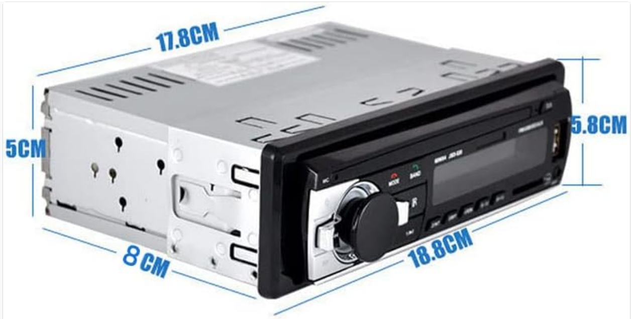
Image 8.1: Product dimensions, indicating length, width, and height in centimeters.