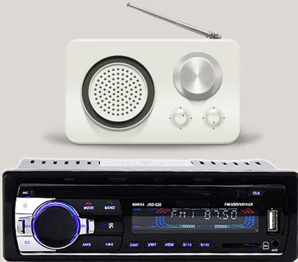
Image 5.1: Illustration of the FM Radio function, highlighting the frequency range and automatic search capability.