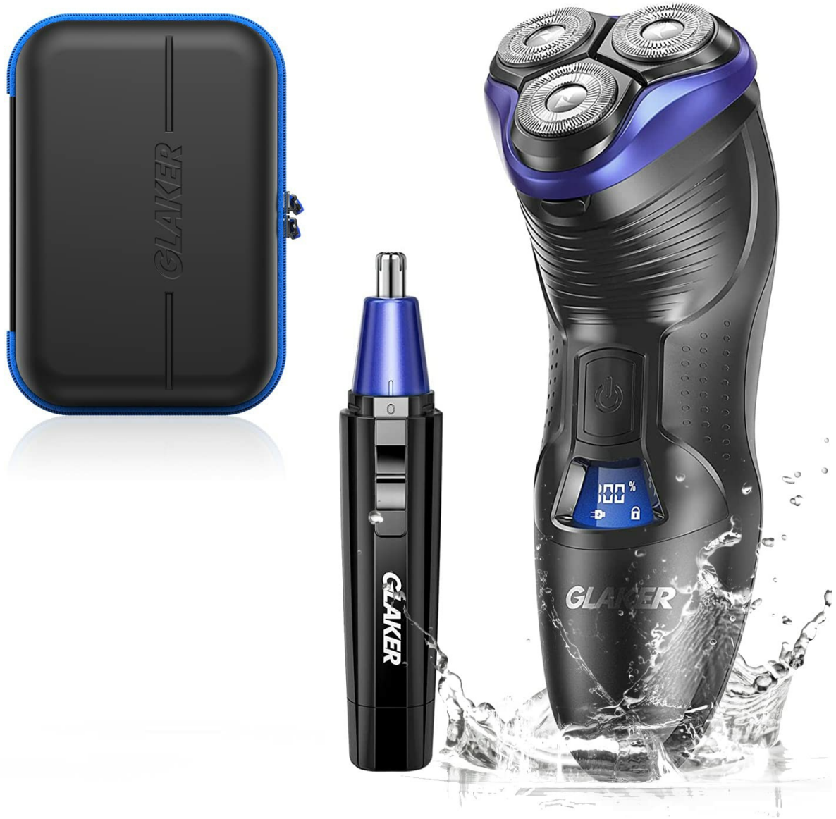
Figure 1.1: GLAKER Electric Rotary Shaver GLS03.