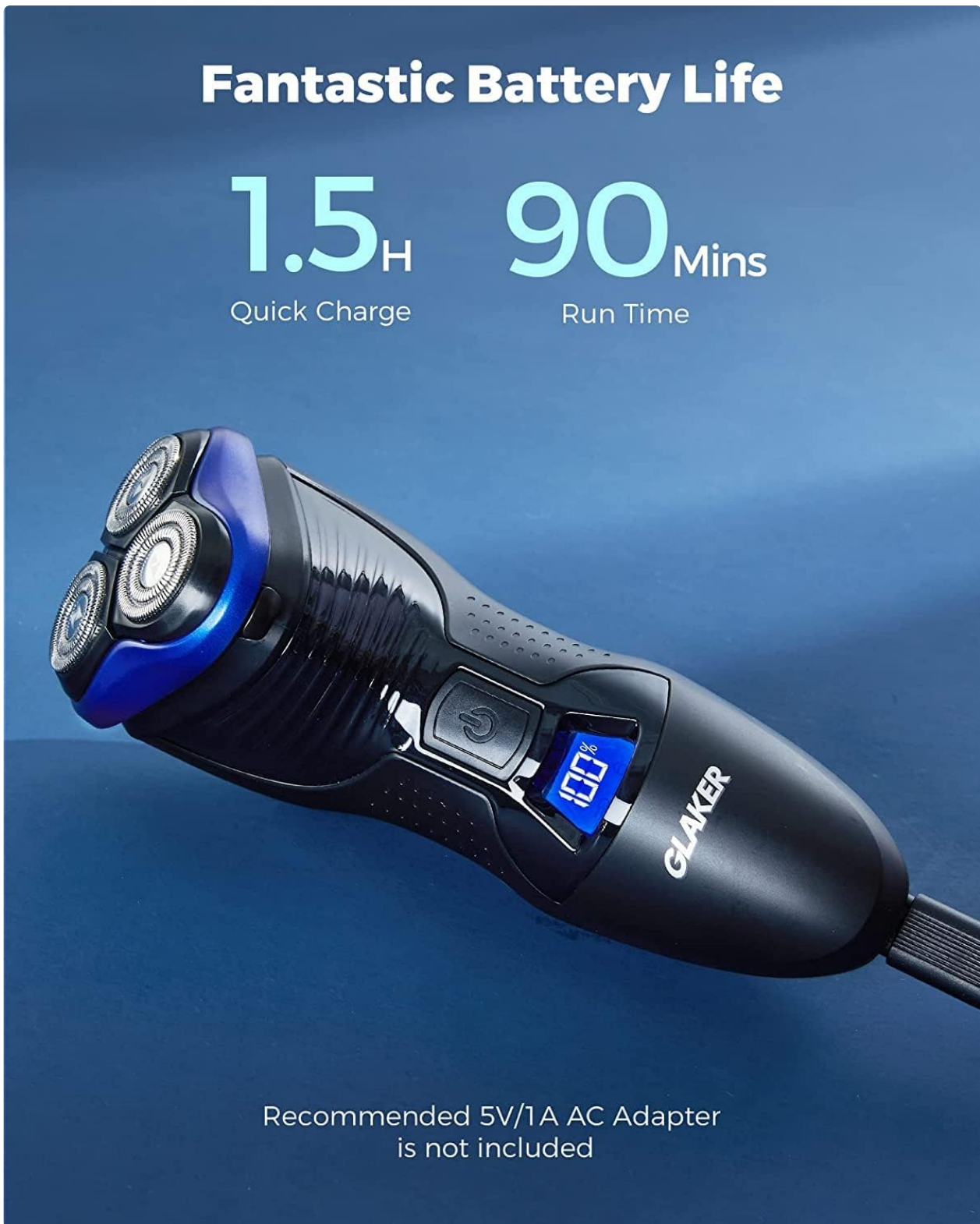
Figure 3.1: The shaver's LCD screen indicates battery percentage during charging and use.

4. Once fully charged (100% displayed), disconnect the shaver from the power source.