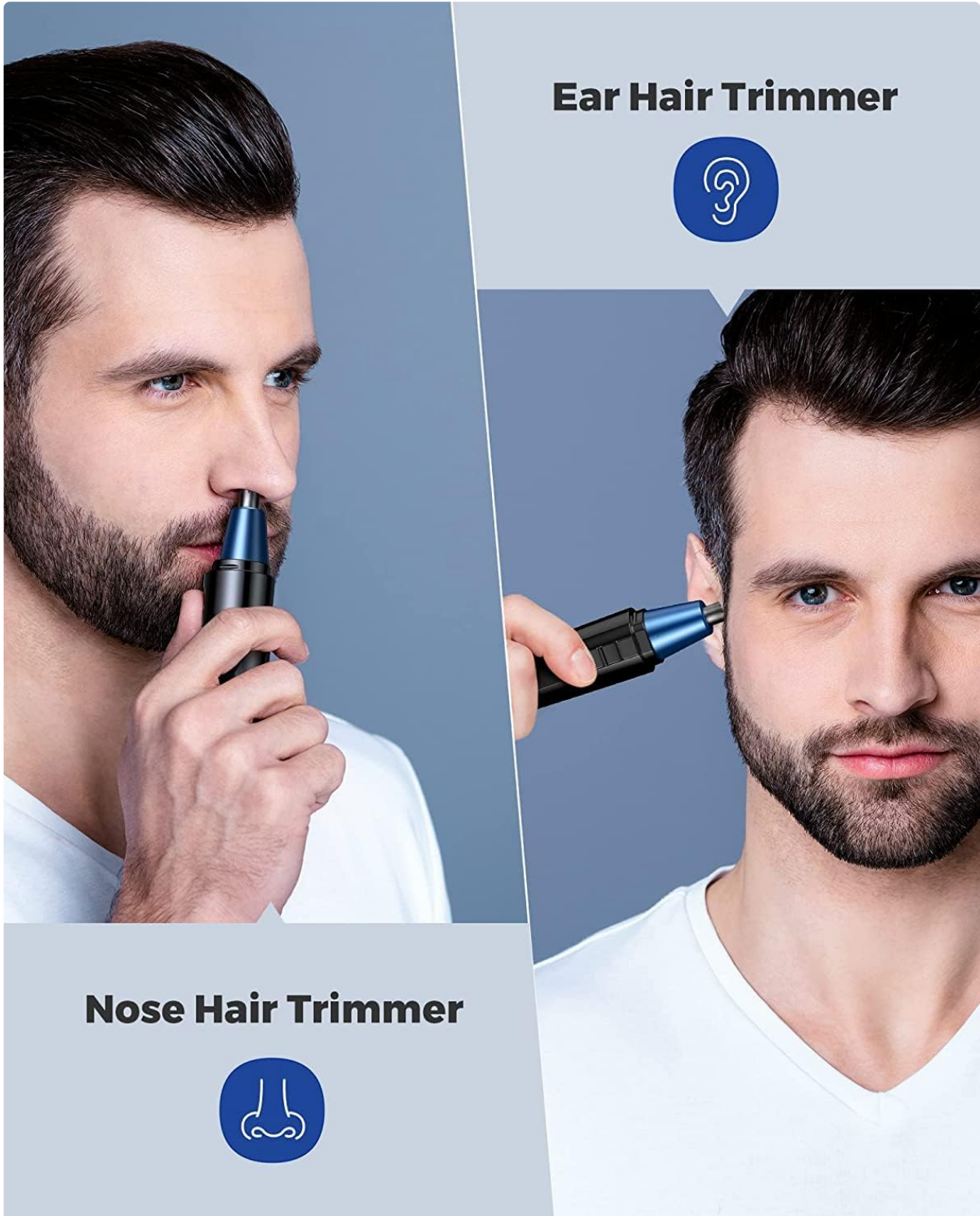
Figure 4.3: The nose and ear hair trimmer for precise grooming.