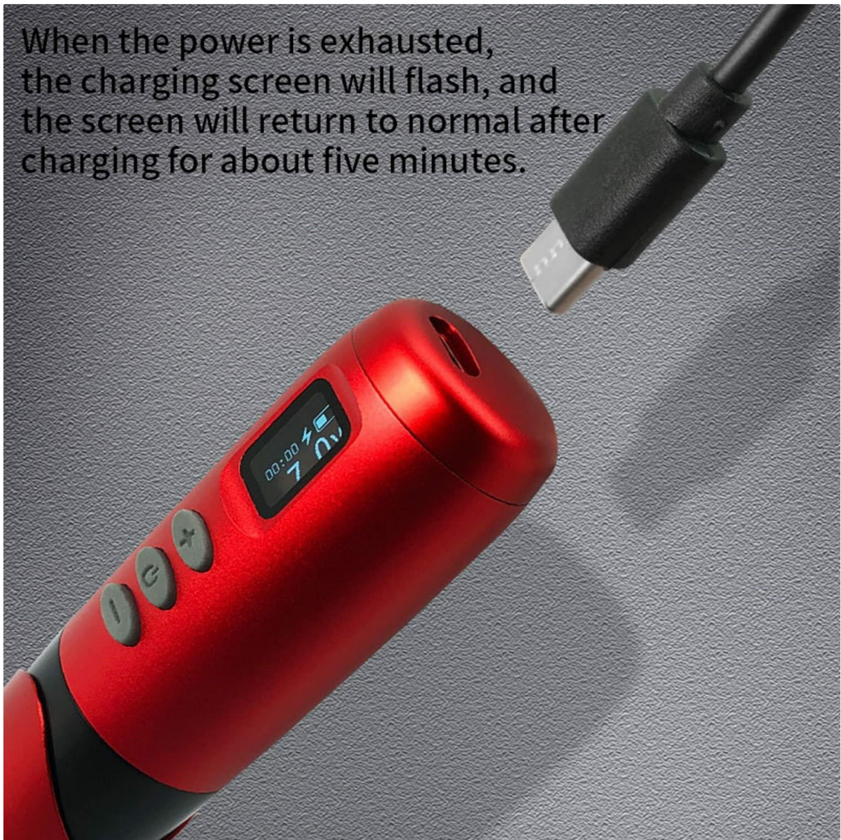
Image 6: The tattoo machine connected to a Type-C charging cable. The screen flashes when power is low and returns to normal after approximately five minutes of charging.

When the power is exhausted, the charging screen will flash, and the screen will return to normal after charging for about five minutes.