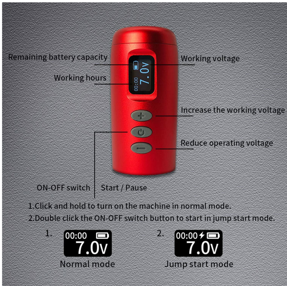
Image 2: Detailed view of the tattoo machine's control panel. Labels indicate remaining battery capacity, working voltage, working hours, and buttons for increasing/reducing operating voltage, and the ON-OFF switch/Start/Pause button. It also shows normal mode and jump start mode displays.