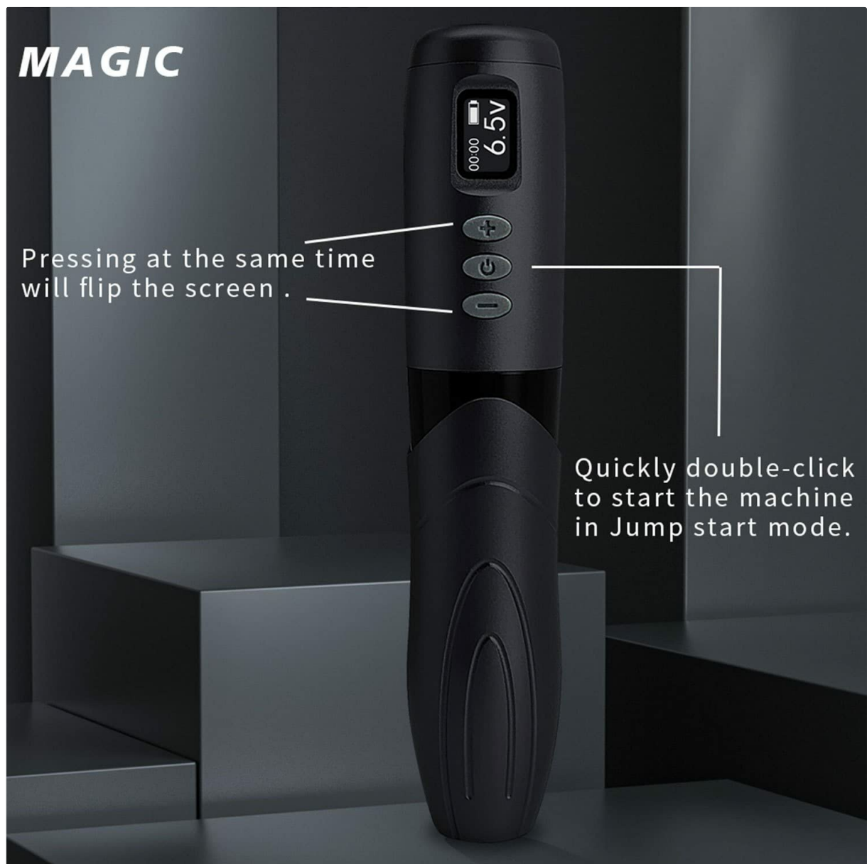
Image 3: Illustration of the screen flip function (pressing voltage buttons simultaneously) and how to quickly double-click to activate Jump Start mode on the BRONC Magic Wireless Tattoo Machine.