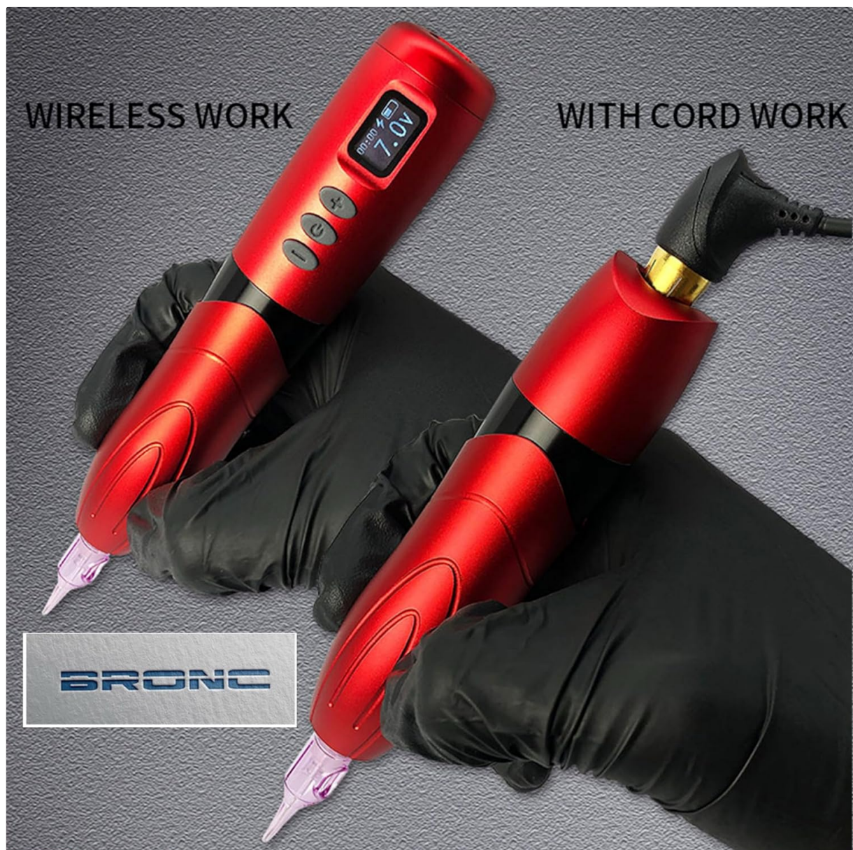
Image 1: BRONC Magic Wireless Tattoo Machine demonstrating both wireless and corded (RCA) operational modes. The machine is held by a gloved hand, highlighting its ergonomic design.