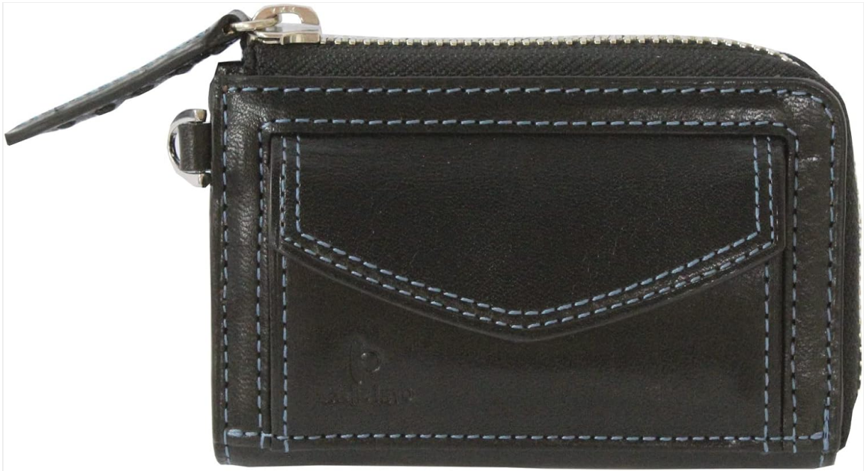
Figure 1: Front view of the CELESTE AZ106 Key Case. This image displays the compact size and the W-stitch design on the front pocket.