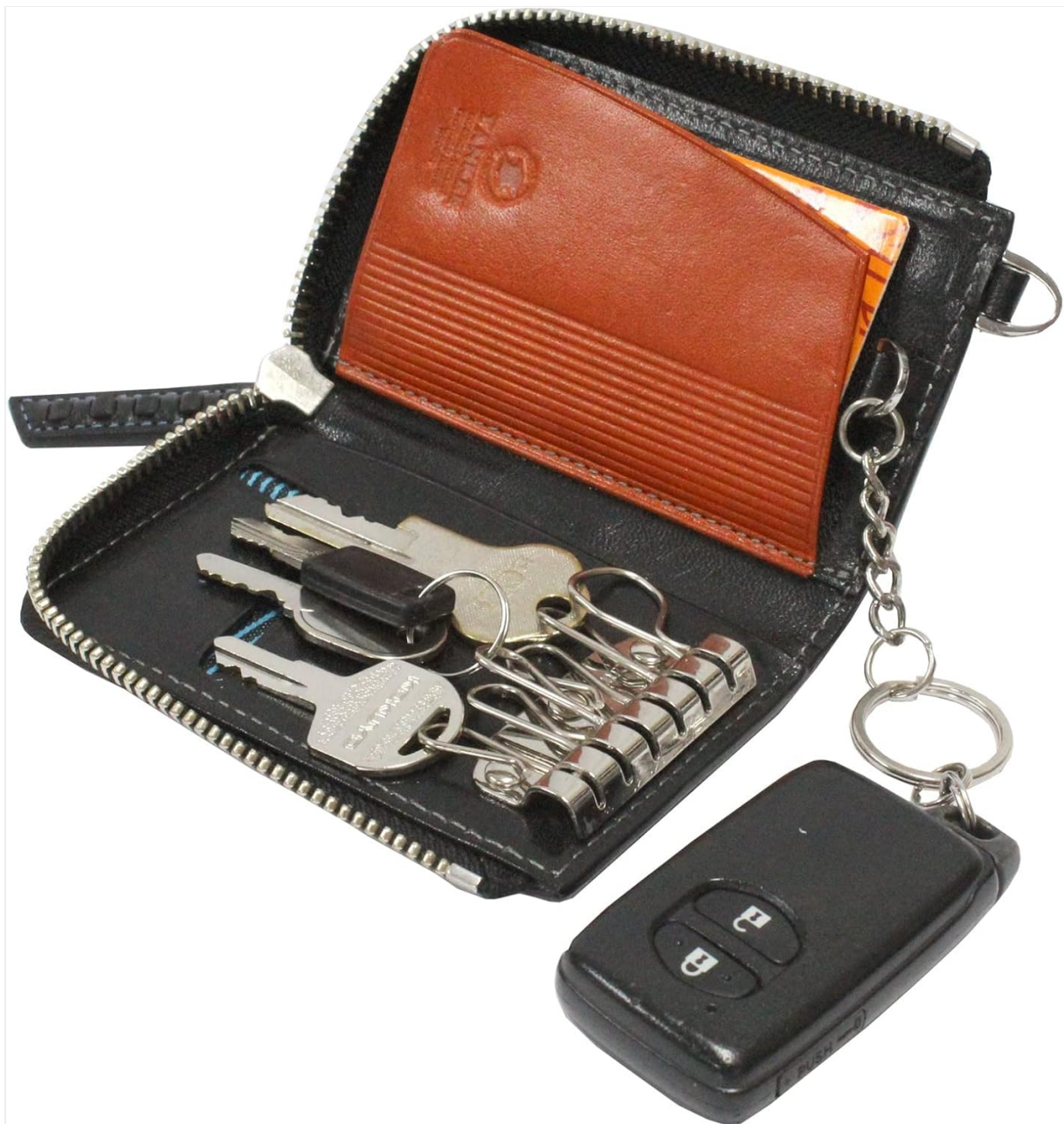
Figure 3: Example of key and smart key placement. This image shows how standard keys are attached to hooks and a smart key to its chain, with the leather divider in place.