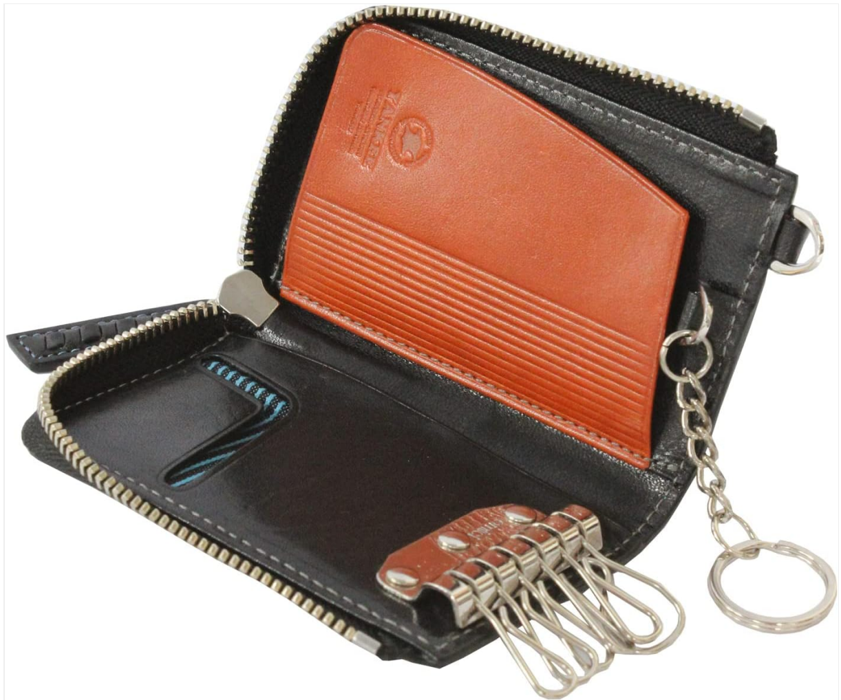
Figure 2: Interior layout of the key case. This image illustrates the arrangement of key hooks, the smart key chain, and internal pockets.