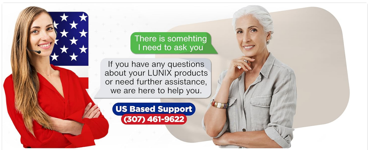
Image: Lunix customer support information, emphasizing wellness and assistance.