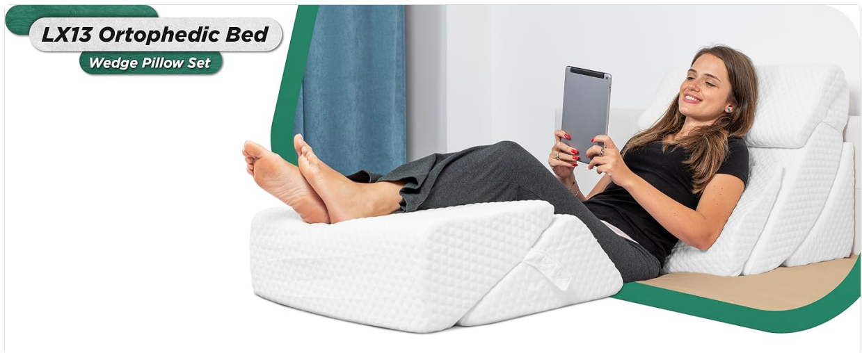
Image: A user demonstrating a comfortable reading position using the LX13 wedge pillow system.