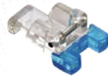
Pie M botones