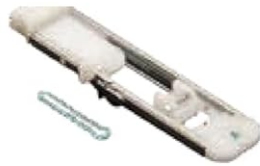
Pie A ojal