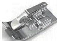
Pie R puntada