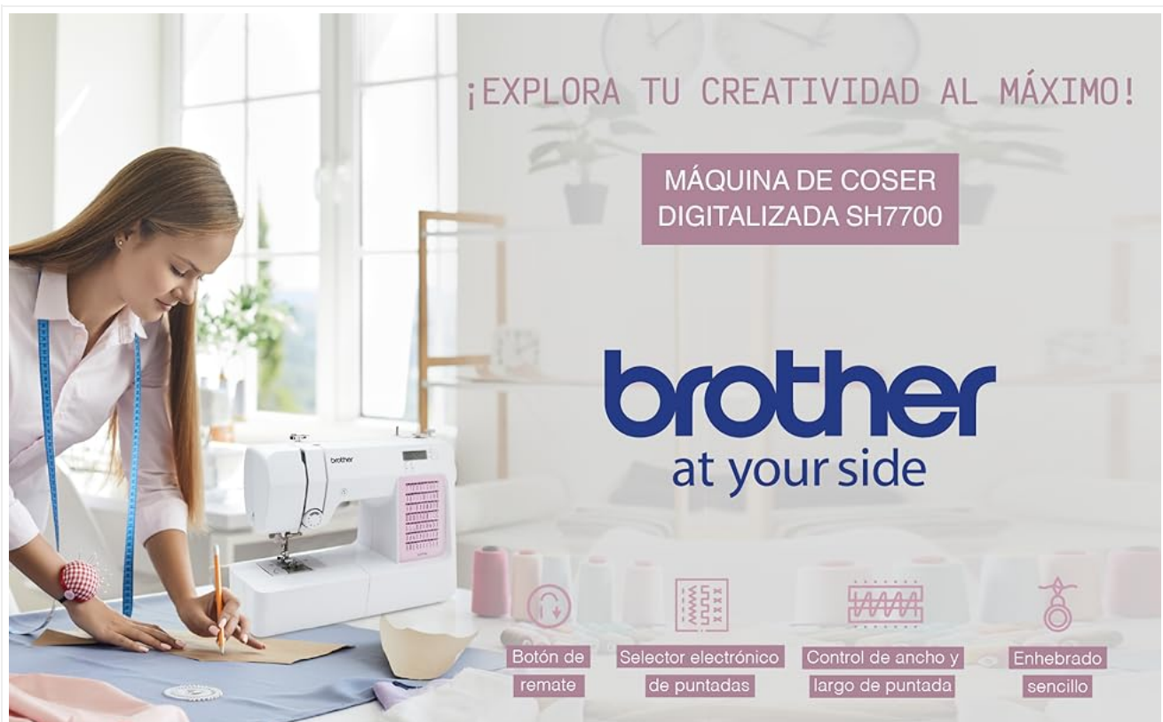
Image: The Brother SH7700 Digitalized Sewing Machine, emphasizing its lightweight and portable nature. The machine is white with

Thank you for choosing the Brother SH7700 Digitalized Sewing Machine. This portable and versatile machine is designed for a wide range of sewing projects, offering 120 sewing functions, 750 stitches per minute, and 7 types of one-step buttonholes. Its intuitive LCD screen and practical features make it suitable for both beginners and experienced users. This manual provides essential information for setting up, operating, maintaining, and troubleshooting your sewing machine to ensure optimal performance and longevity.