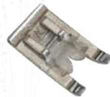
Pie N monogramas

Image: A clear display of the seven presser feet included with the Brother SH7700: Zigzag, Buttonhole, Zipper, Button Sewing, Overcasting, Blind Stitch, and Monogramming feet.