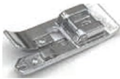
Pie G sobrehilado