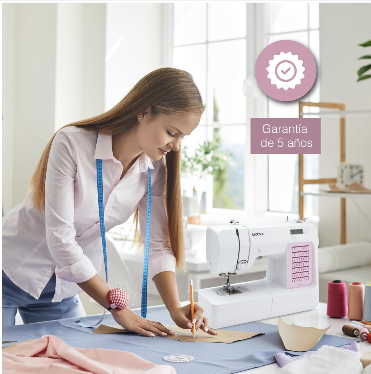
Image: A user operating the Brother SH7700 sewing machine, with a visual indicator of the 5-year warranty, emphasizing product reliability and support.