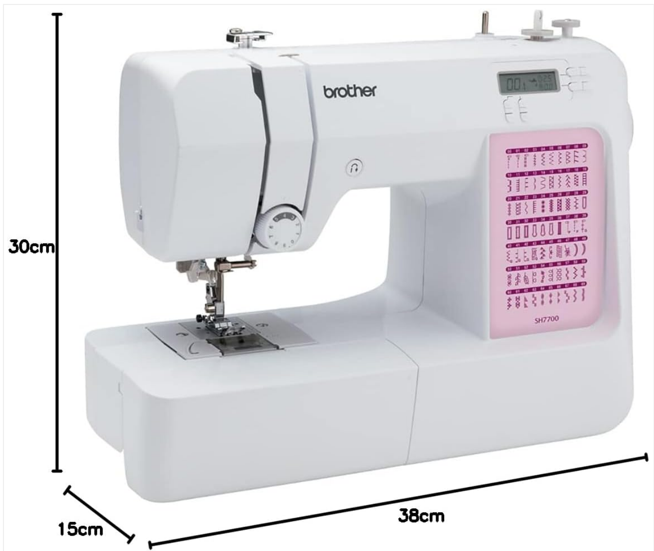
Image: A visual representation of the Brother SH7700 sewing machine with its key dimensions labeled: 30cm height, 15cm depth, and 38cm width.