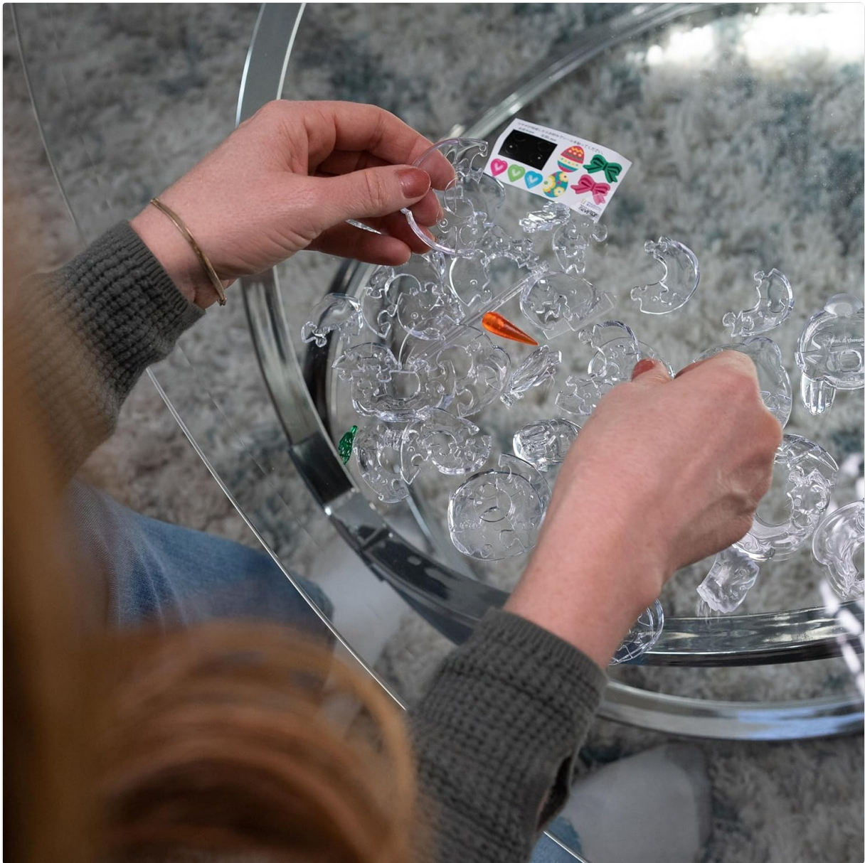
Image: Various transparent puzzle pieces spread out on a glass table, ready for assembly.