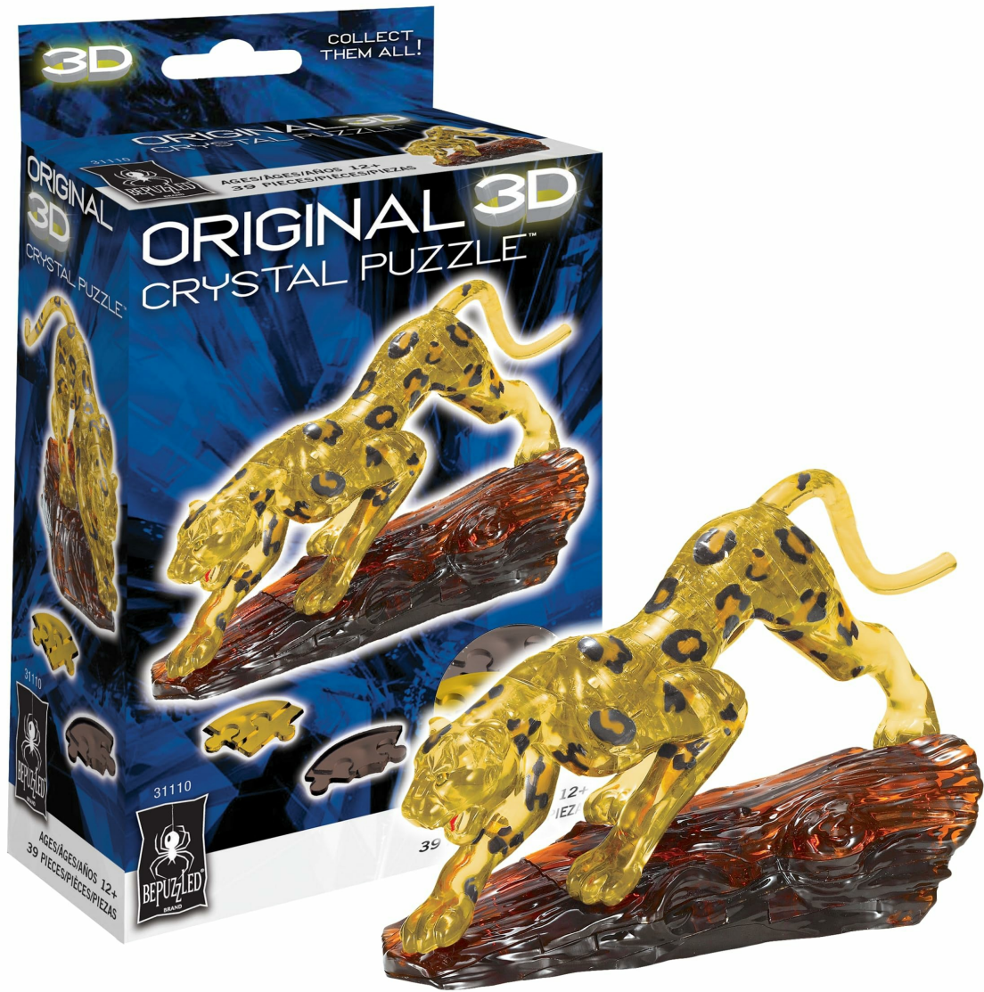
Image: The retail packaging for the BePuzzled Original 3D Crystal Puzzle Panther Standard, showing the completed panther model.