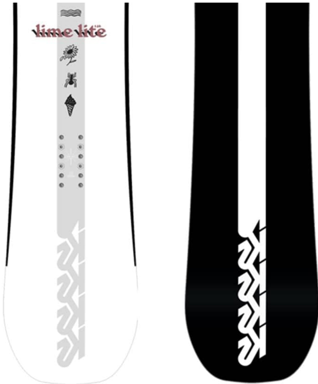
Image: The K2 Lime Lite Snowboard, showcasing both the white top sheet with graphics and the black base.