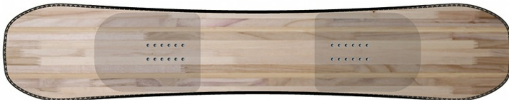
Image: Detailed view of the K2 Lime Lite's internal construction, highlighting the Rhythm Core, Biax Glass, and Extruded 2000 Base technologies.