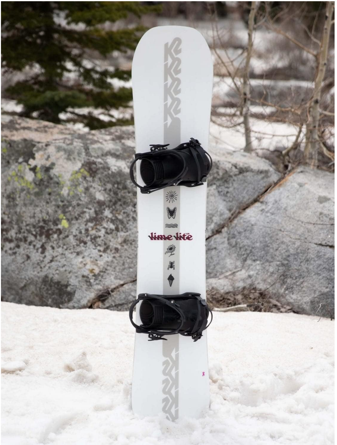
Image: The K2 Lime Lite Snowboard with black bindings mounted, resting on snow, ready for use.