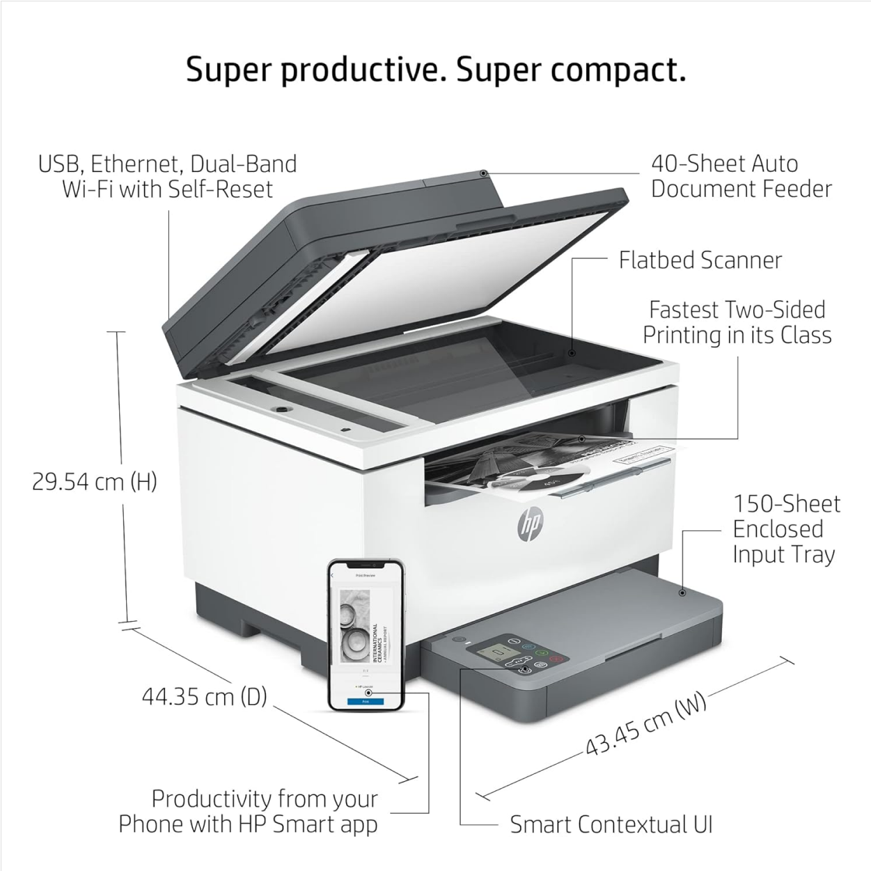
Image 4: An annotated diagram of the printer, highlighting key features like the ADF, flatbed scanner, input tray, and dimensions.