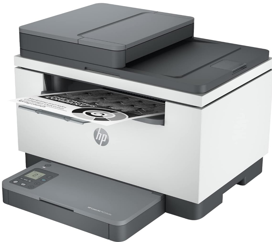
Image 3: The printer's Automatic Document Feeder (ADF) in action, allowing for multi-page scanning and copying.