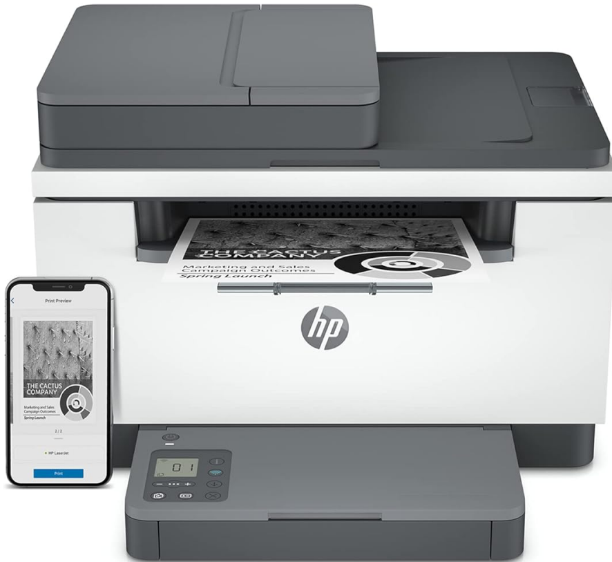
Image 2: The printer connected wirelessly to a smartphone via the HP Smart App, highlighting its WiFi Direct Dual Band capability.