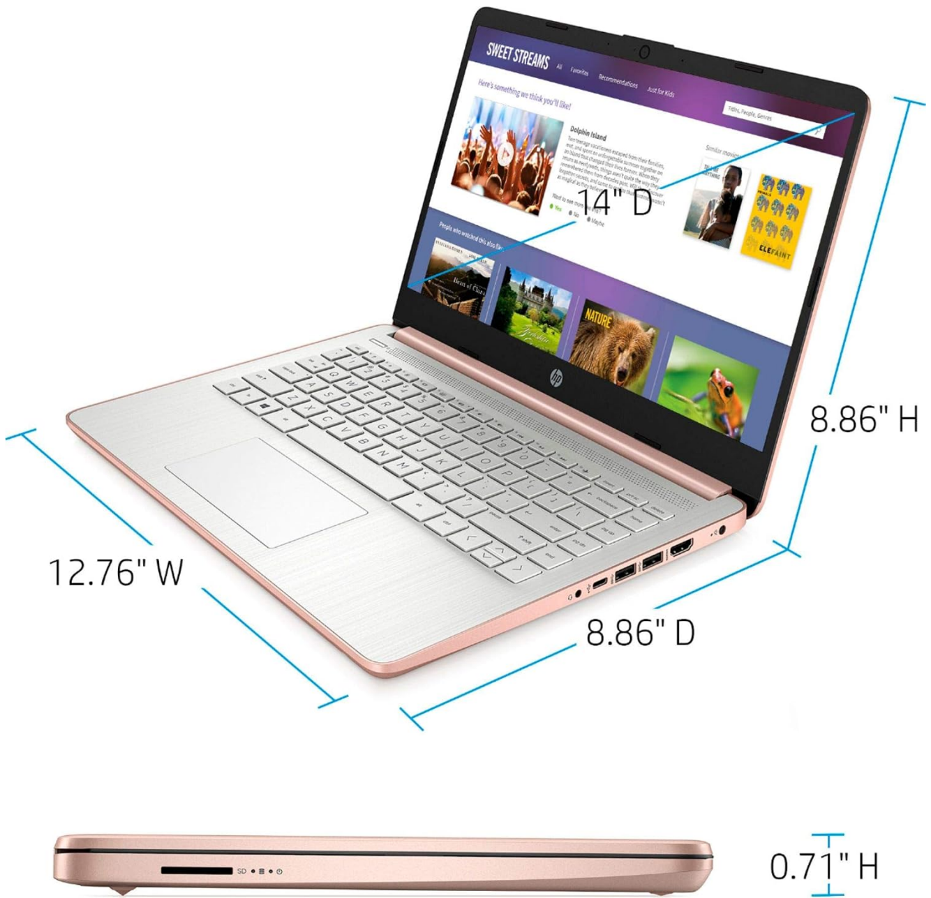
Image: Diagram showing the dimensions of the HP 14-inch laptop: 12.76 inches (W), 8.86 inches (D), and 0.71 inches (H).