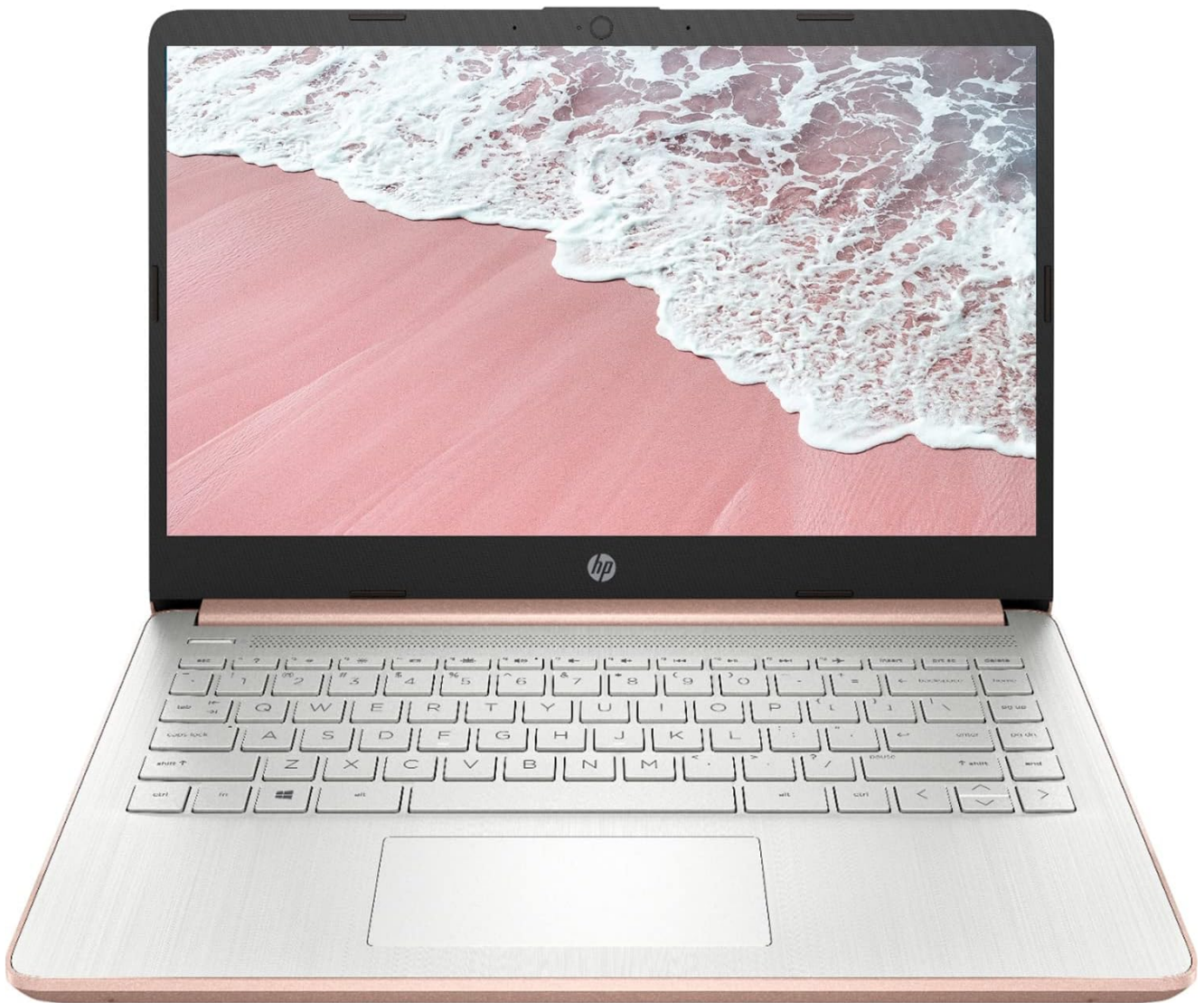
Image: Front view of the HP 2022 Premium 14-inch HD Thin and Light Laptop, showcasing its rose gold finish and narrow display bezels.