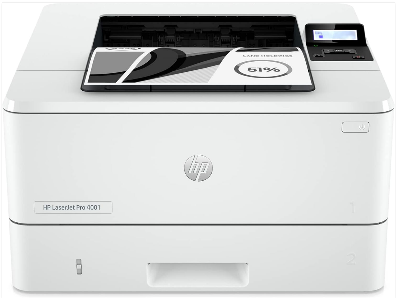
Figure 1.1: Front view of the HP LaserJet Pro 4001n printer.