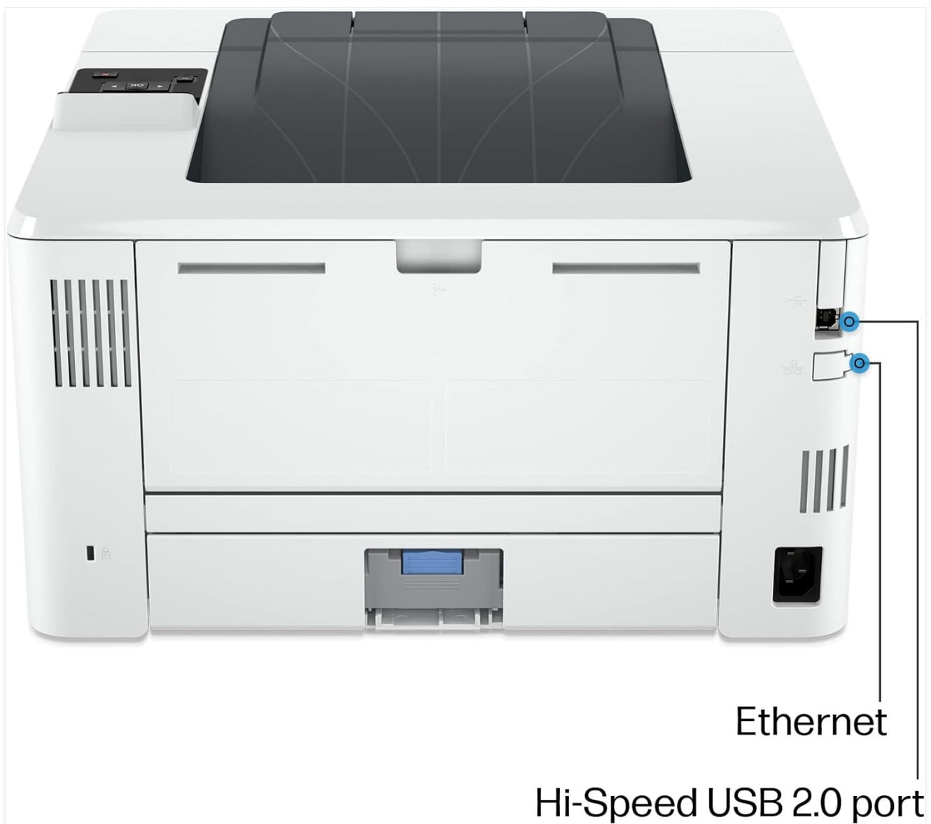
Figure 2.3: Rear view with Ethernet and USB ports.