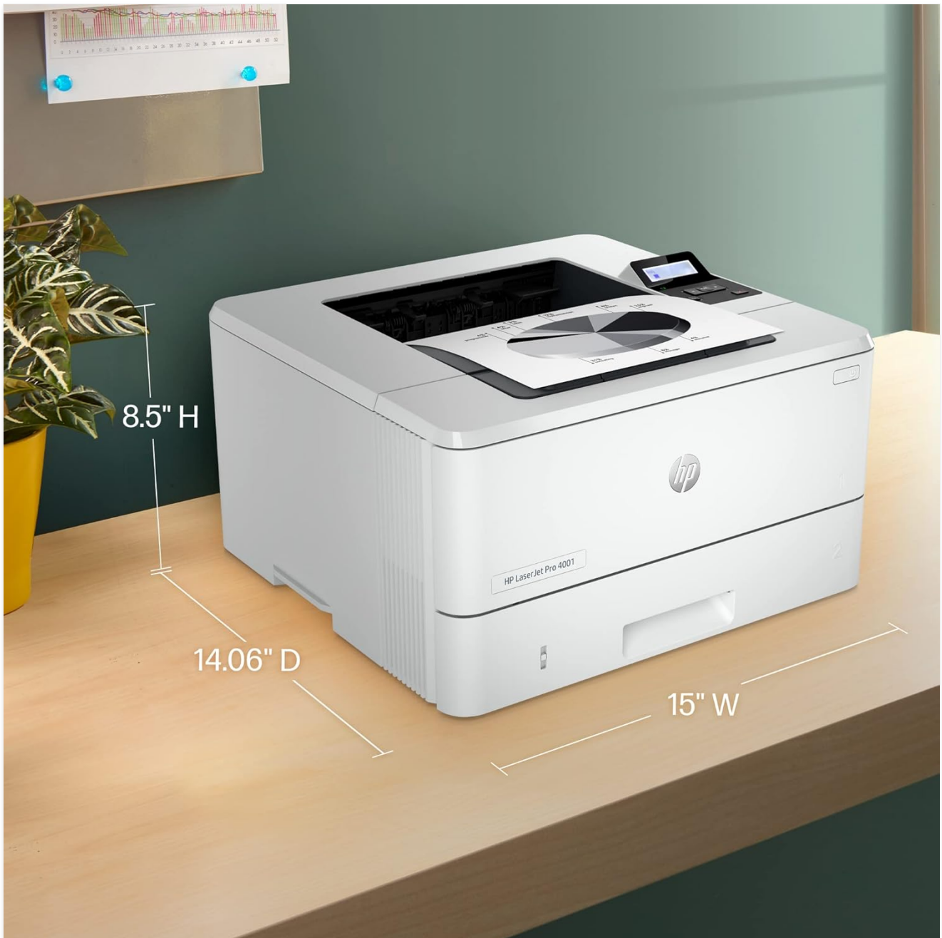
Figure 6.1: Product dimensions.