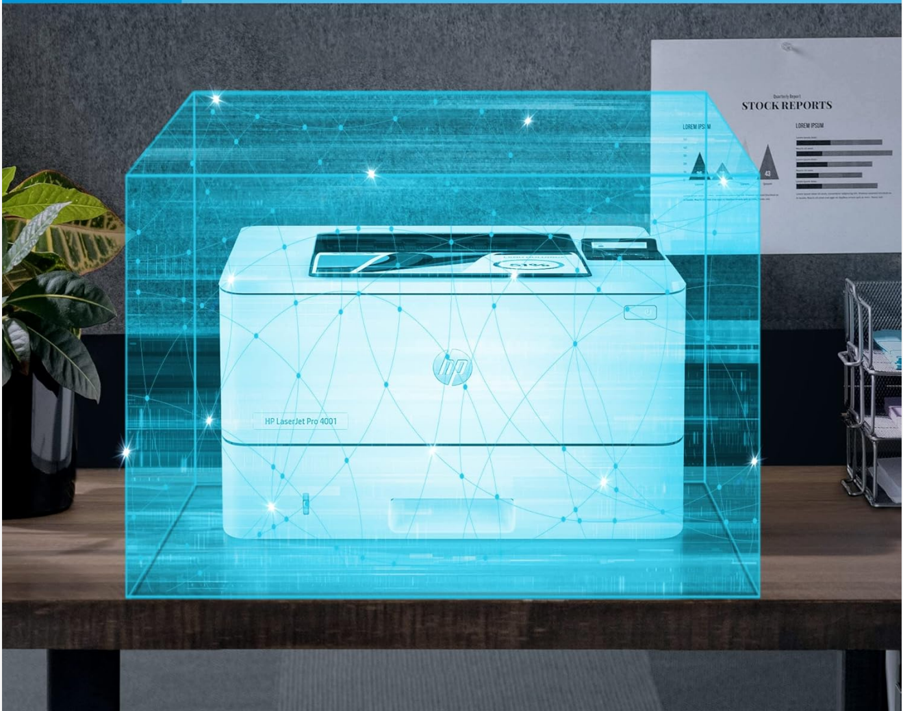
Figure 3.2: HP Wolf Pro Security ensures data and network safety.