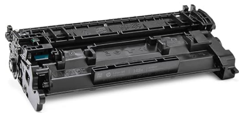
Original HP 148A Black Toner Cartridge