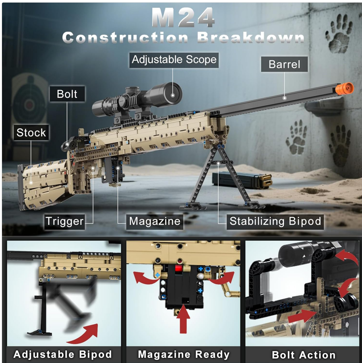
Figure 2: Construction breakdown of the M24 model, highlighting key components and their functions.