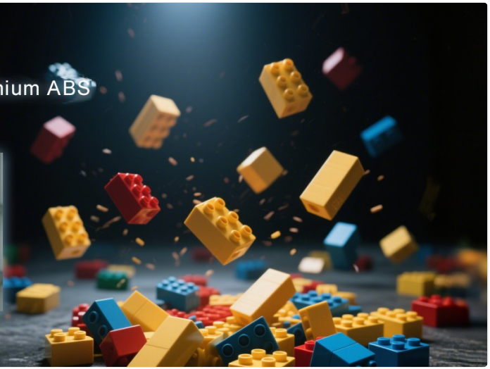
Figure 6: The product is made from premium, non-toxic ABS material.