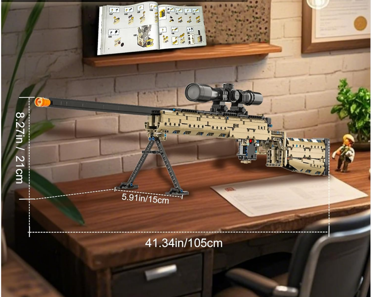
Figure 5: Physical dimensions of the assembled M24 model.

Imitation based on the actual proportion of the physical object