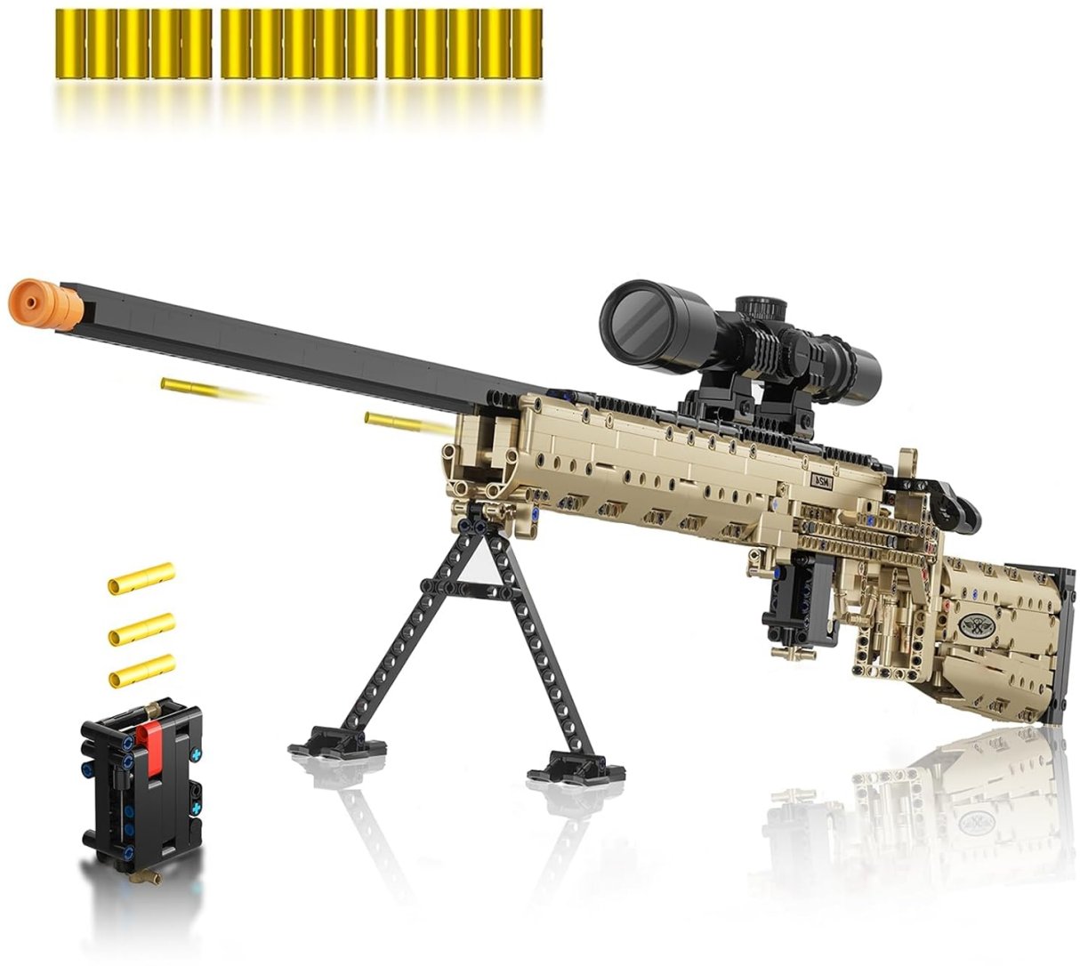
Figure 1: Fully assembled CASEIER M24 Building Blocks Sniper Rifle, showcasing its detailed design and included golden bullet accessories.