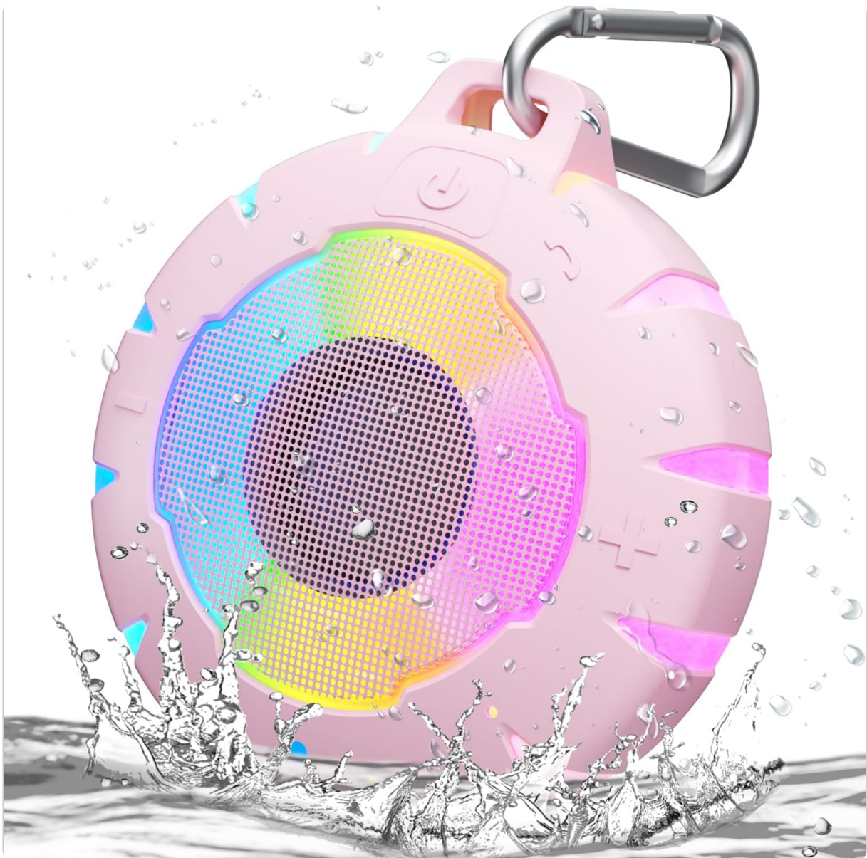
Figure 1: HEYSONG B18L Waterproof Shower Bluetooth Speaker in Pink, demonstrating its water resistance with splashes.