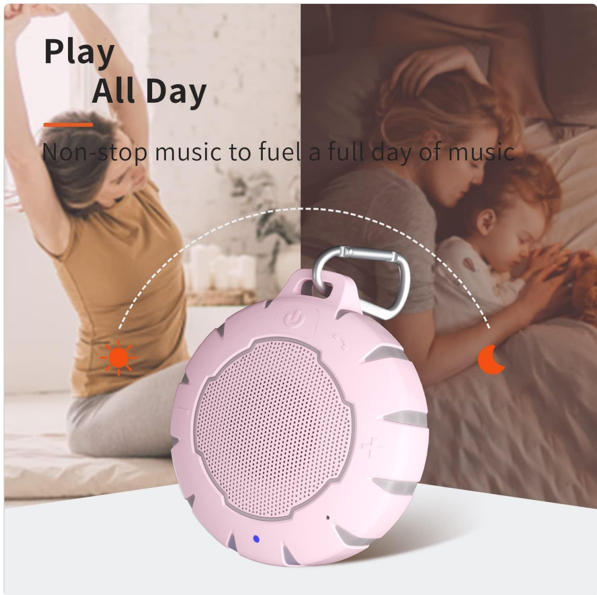
Figure 2: The speaker is designed for extended use, indicating its long battery life after a full charge.