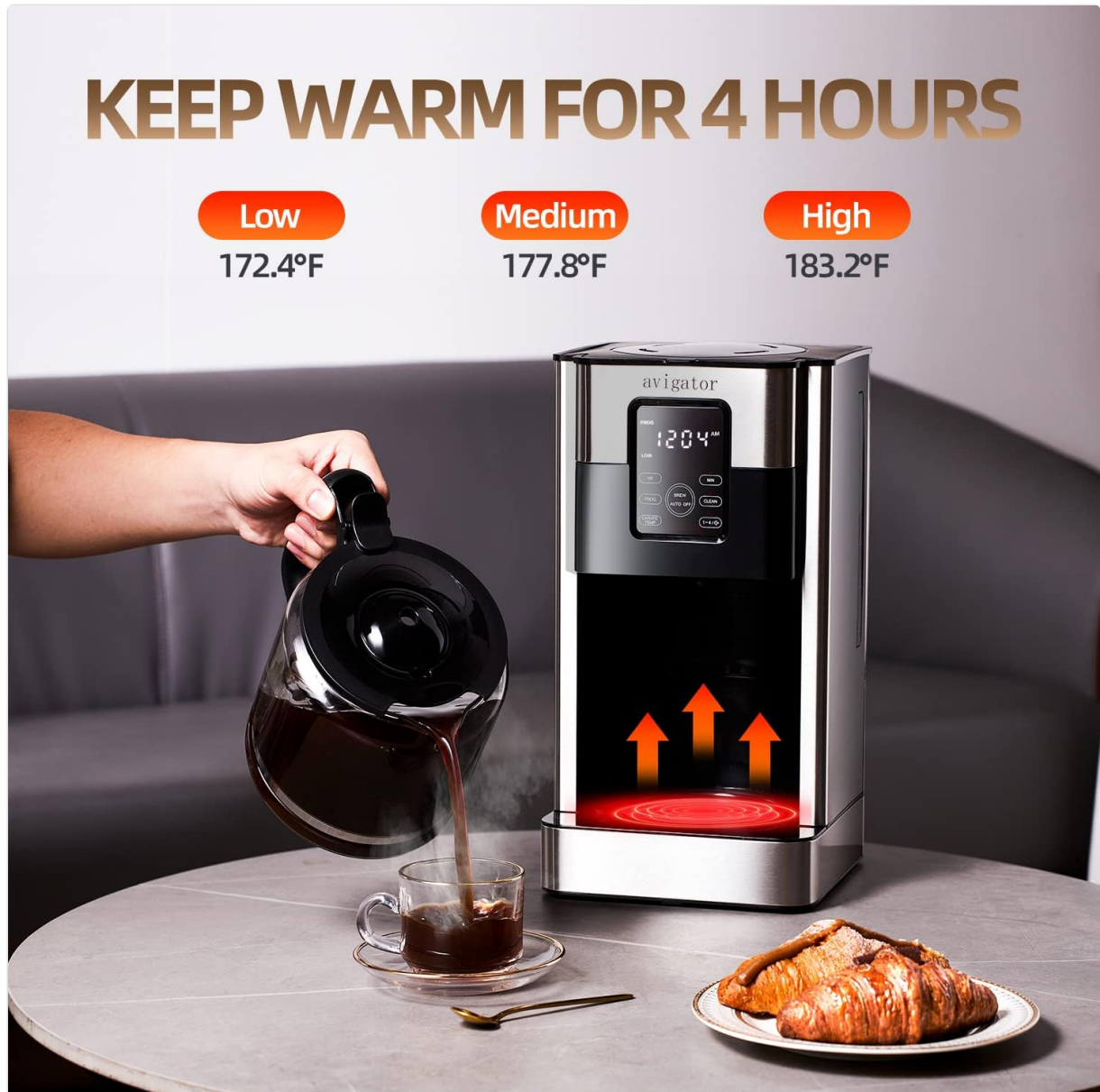
Image: The coffee maker demonstrating its "Keep Warm" feature with three temperature levels: Low (172.4°F), Medium (177.8°F), and High (183.2°F).