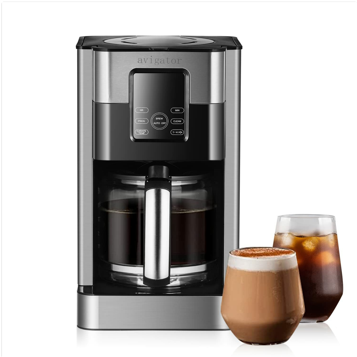
Image: The touchscreen control panel with buttons like PROG, AUTO OFF, CLEAN, BREW, and CARAFE TEMP.