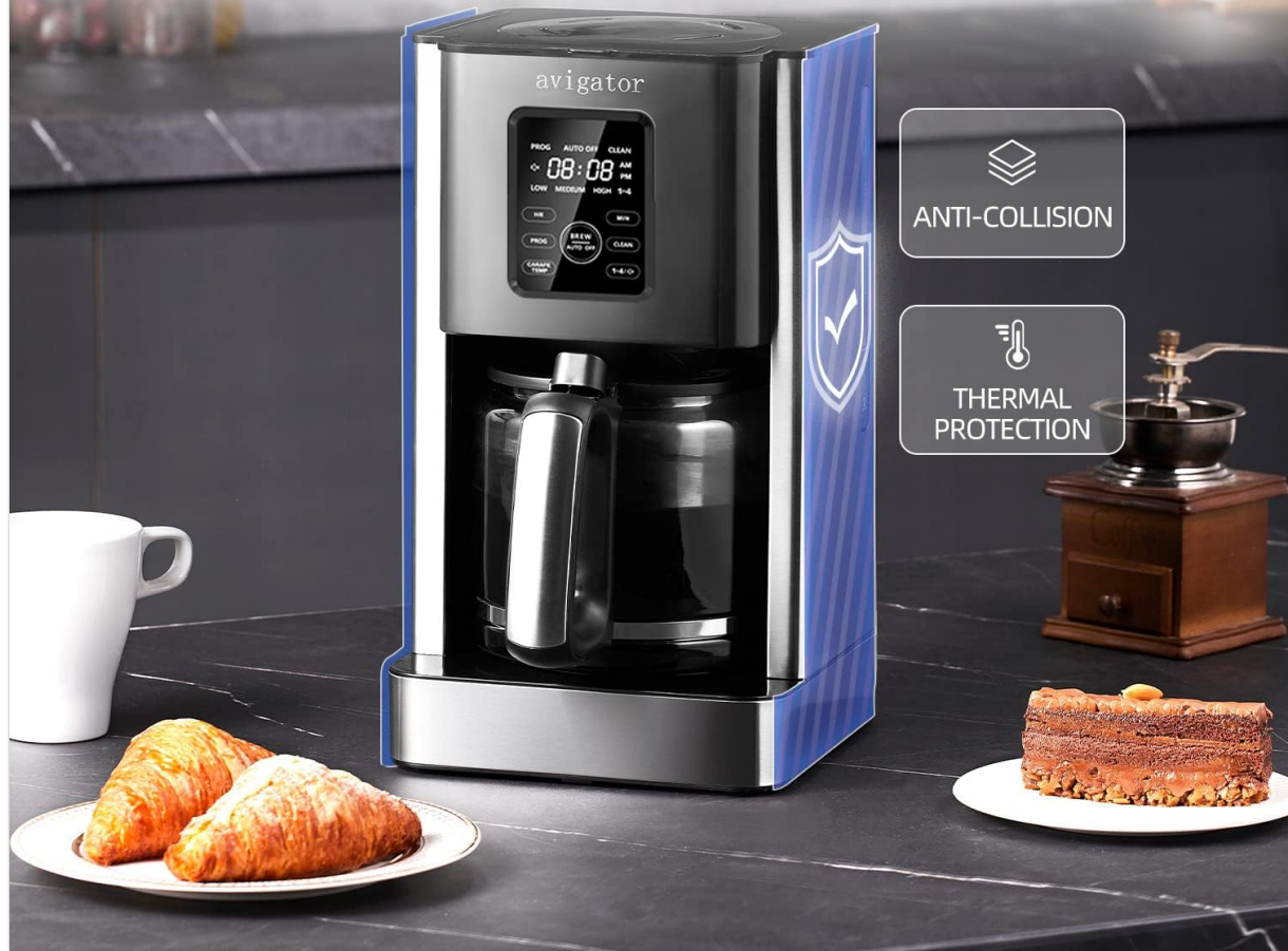
Image: The avigator CM1706 coffee maker highlighting its anti-collision and thermal protection features, ensuring safe operation.