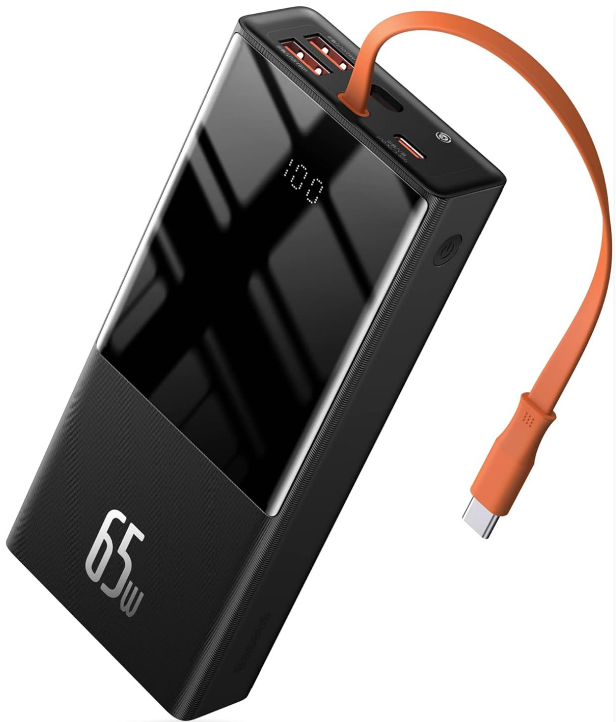
Front view of the Baseus 65W Power Bank, showcasing its sleek black design, digital display, and integrated orange USB-C cable.