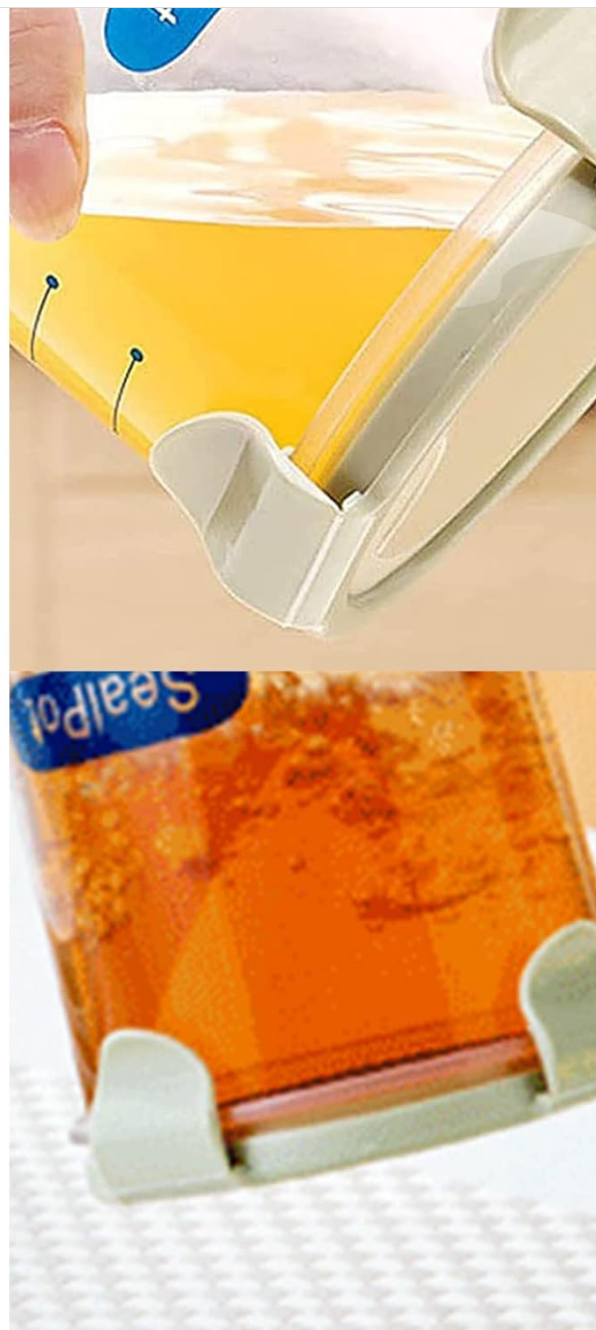
Image: A Yiser 600ml container holding liquid, illustrating the effective airtight seal that prevents leakage.