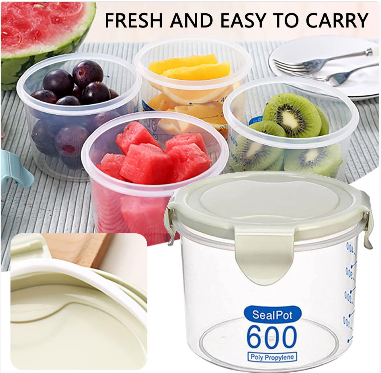
Image: Yiser containers holding different fresh fruits, highlighting their utility for keeping produce fresh and organized.