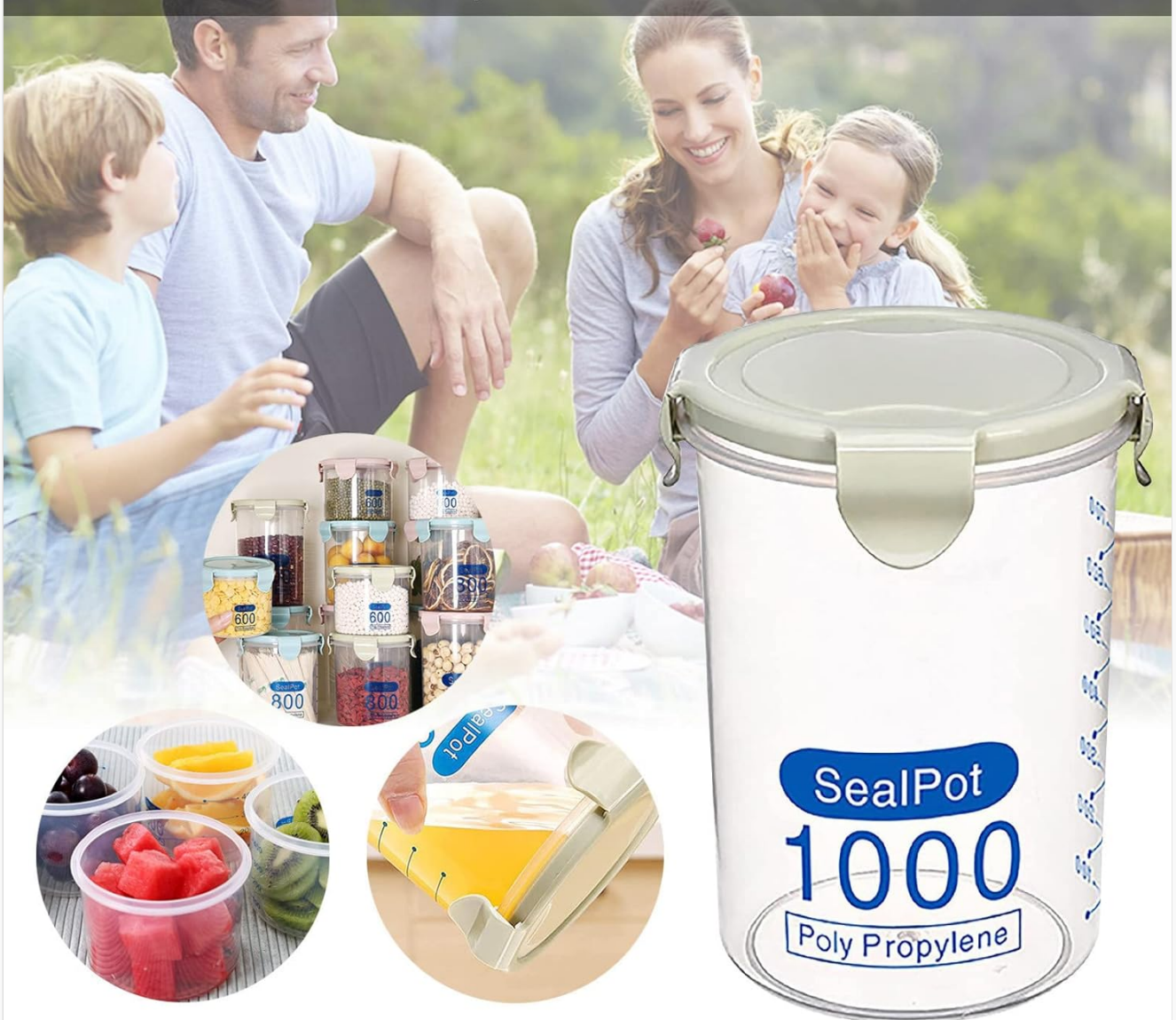
Image: A family outdoors with Yiser containers, illustrating the product's suitability for various applications including picnics and daily use.