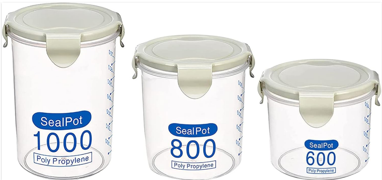
Image: A set of three Yiser food storage containers, clearly showing their respective capacities (1000ml, 800ml, 600ml) and the 'SealPot Poly Propylene' branding.