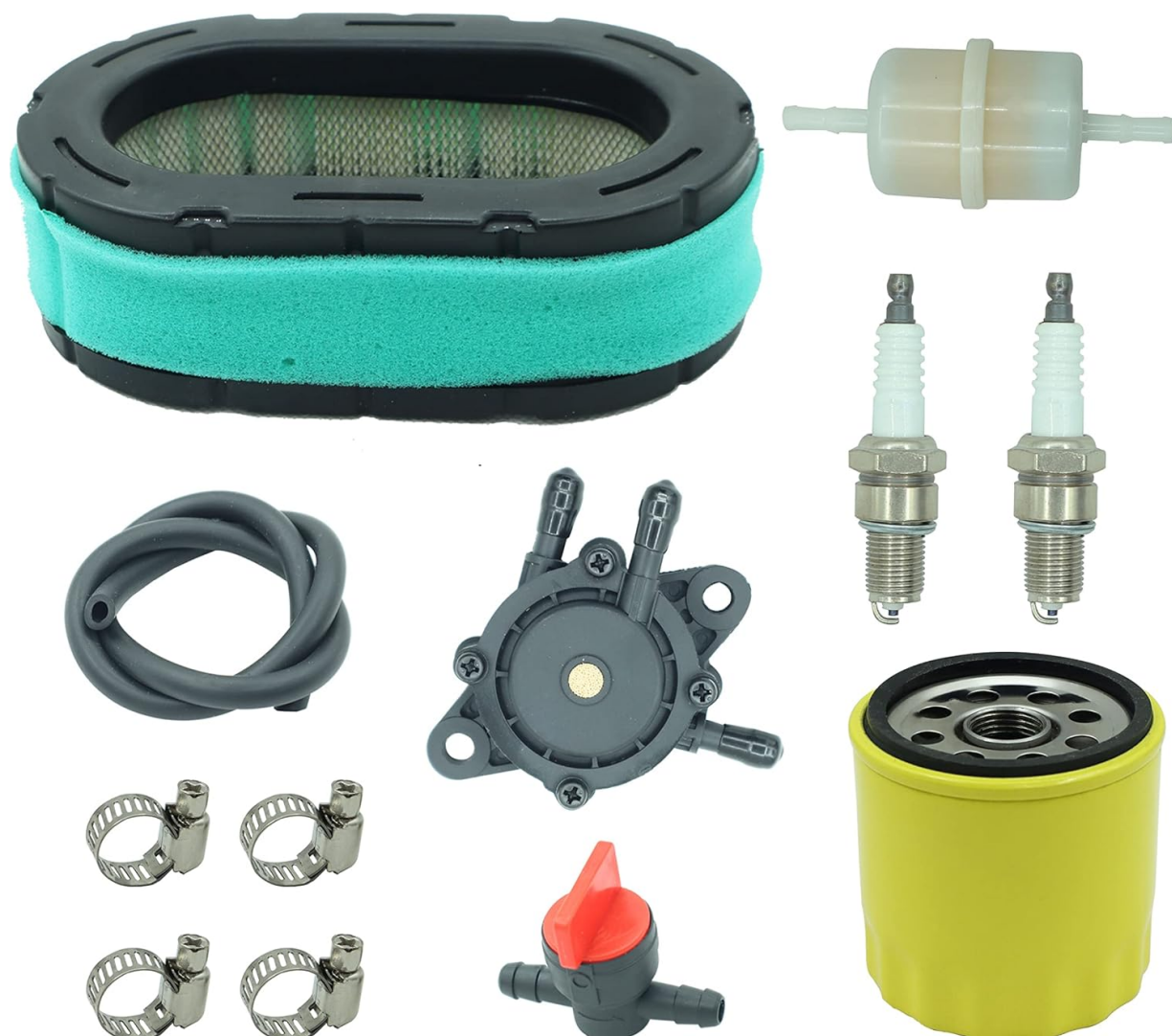
Image: All components included in the DABAZUALY tune-up kit.