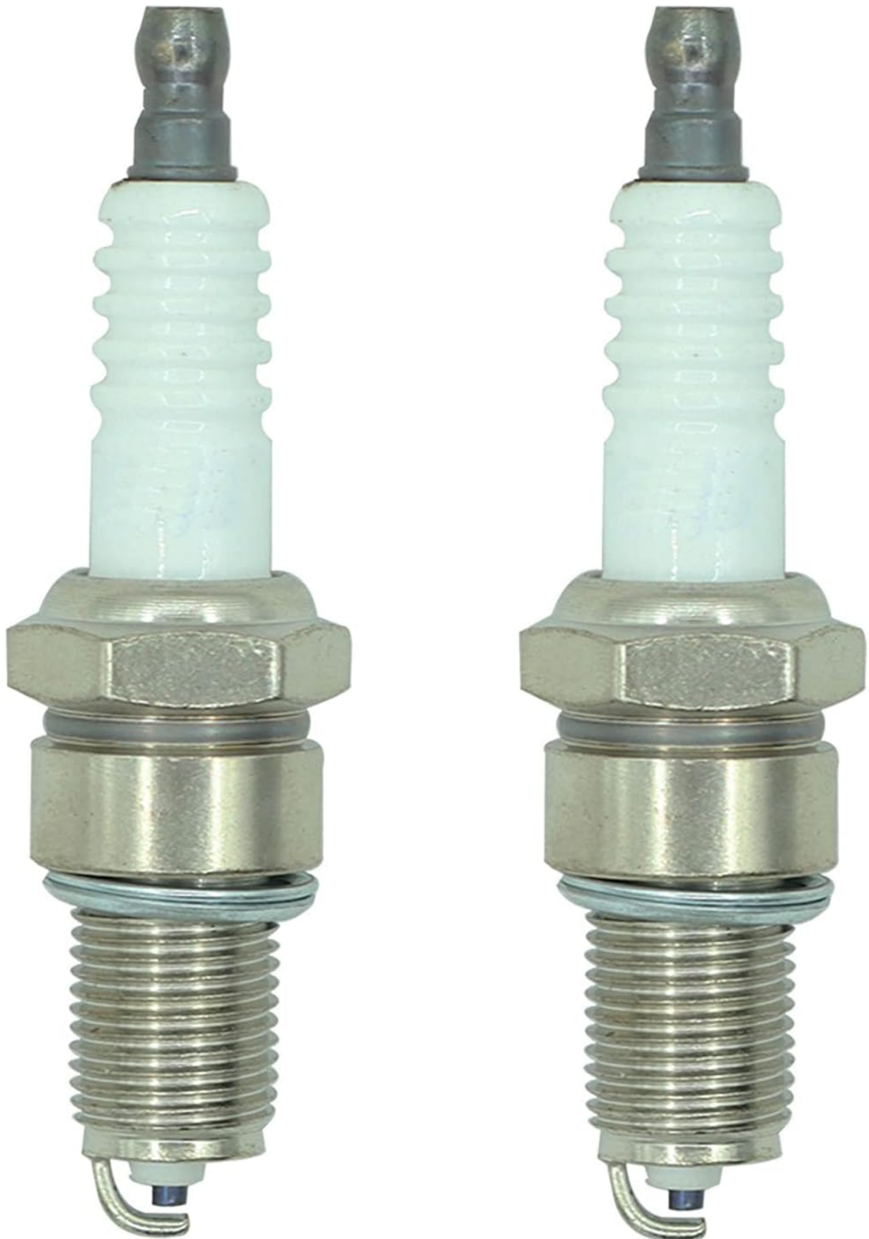
Image: The two replacement spark plugs.