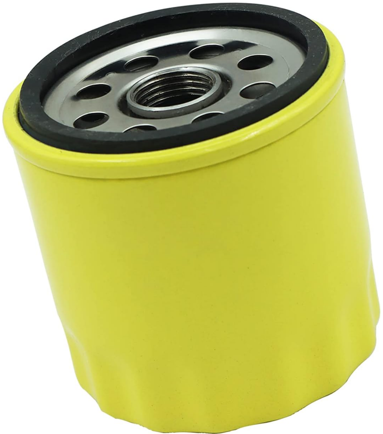
Image: The replacement oil filter.