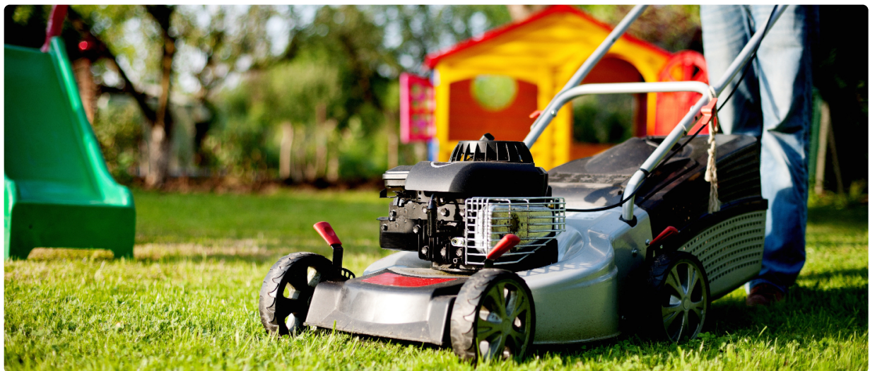
Image: A lawn mower in use, demonstrating the application of the tune-up kit components.

This manual provides detailed instructions for the installation and maintenance of the DABAZUALY Air Filter and Oil Filter Tune-Up Kit. This kit is designed to maintain optimal performance for Kohler KT610, KT620, KT715, KT725, KT730, KT735, KT740, and KT745 19-26 HP 7000 Series lawn mower engines. Regular replacement of these components is crucial for engine longevity and efficiency.