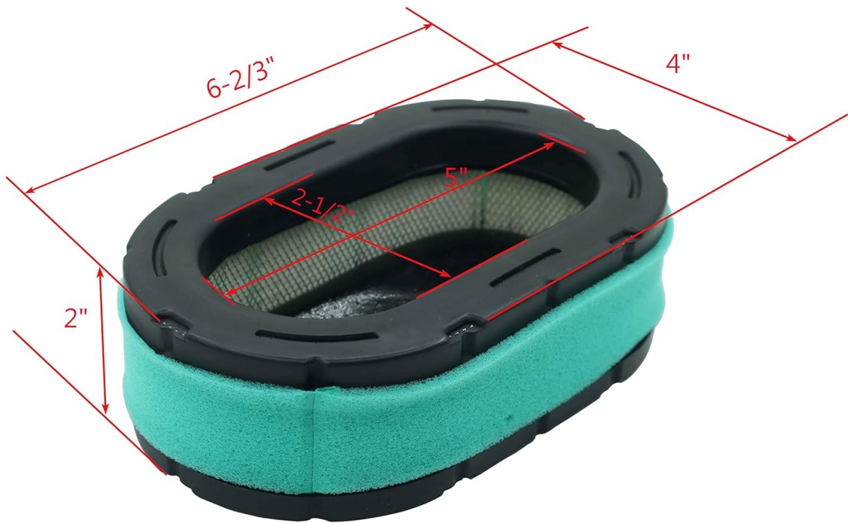
Image: Air filter with key dimensions for fitment verification.