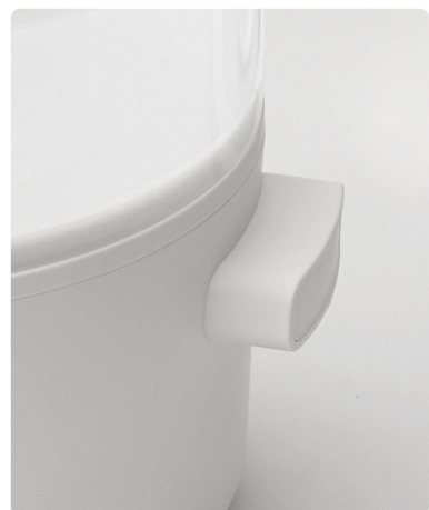
Image 3.2: Detailed views highlighting the control knob, the transparent glass lid, and the ergonomic side handles of the electric cooker.