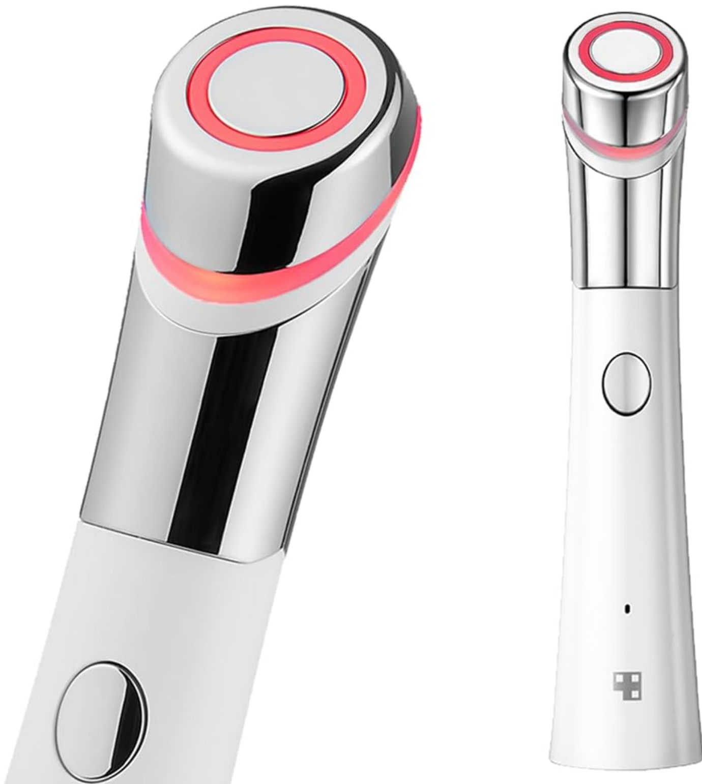
Image: The Medicube Age-R ATS Air Shot device, showcasing its sleek white and silver design with a red illuminated ring at the top.