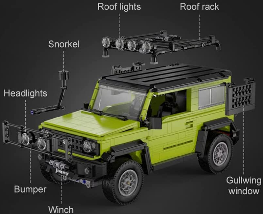
Image 5: Illustrates the various modifications and accessories for the off-road version, including roof lights, snorkel, and winch.