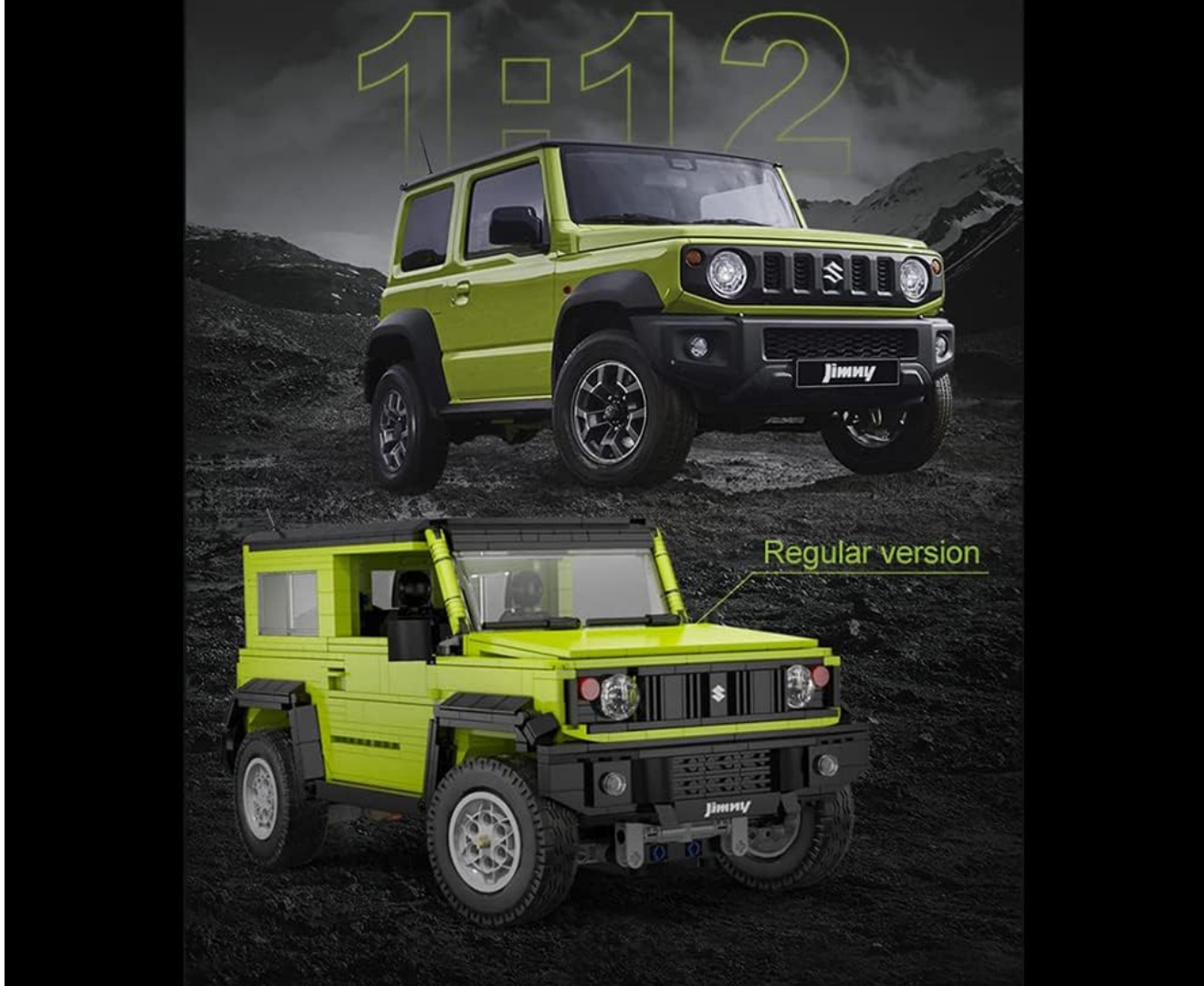
Image 1: The CaDA C62001W Suzuki Jimny 1:12 scale building block model, showcasing its detailed exterior.