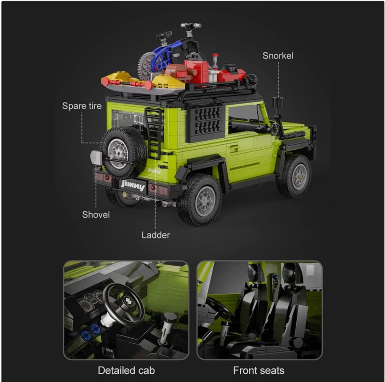
Image 3: Shows the detailed cab and front seats, along with the rear view of the model featuring a spare tire, shovel, ladder, and snorkel.