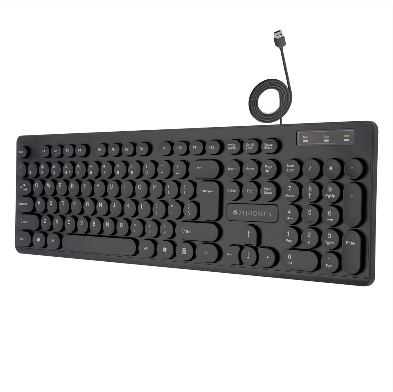
Image: ZEBRONICS K24 Wired USB Keyboard, showing the keyboard and its USB cable.