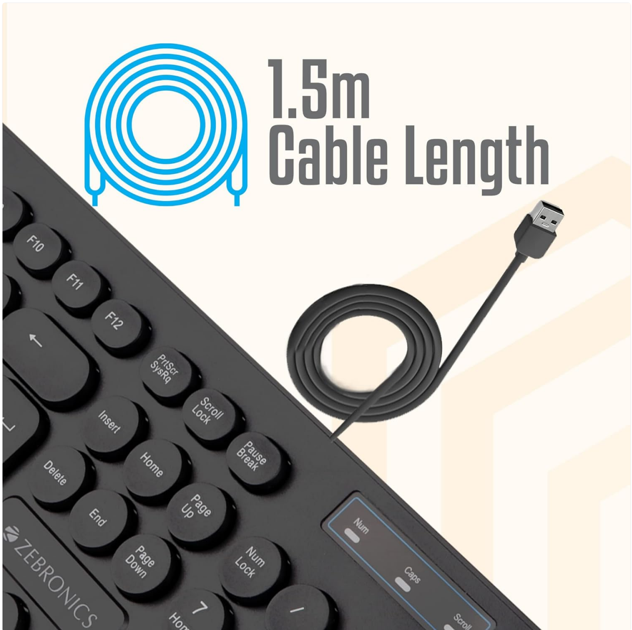
Image: Close-up of the keyboard keys, showing their round, chiclet style and UV coating.