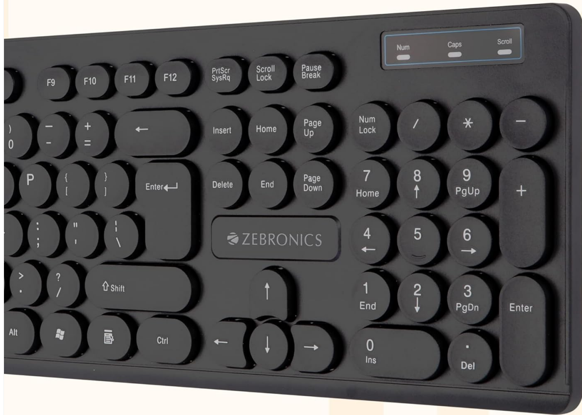
Image: Close-up of the keyboard highlighting the Rupee symbol on a key.