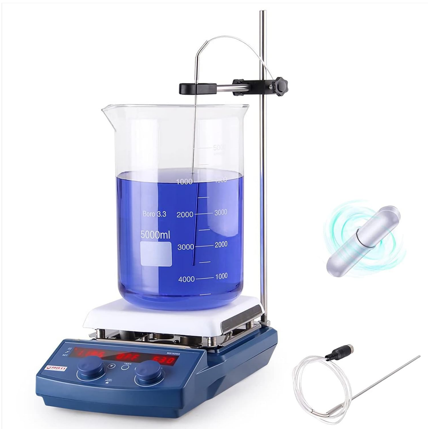
Figure 1: FOUR E'S SCIENTIFIC 7 Inch Hotplate Magnetic Stirrer setup.