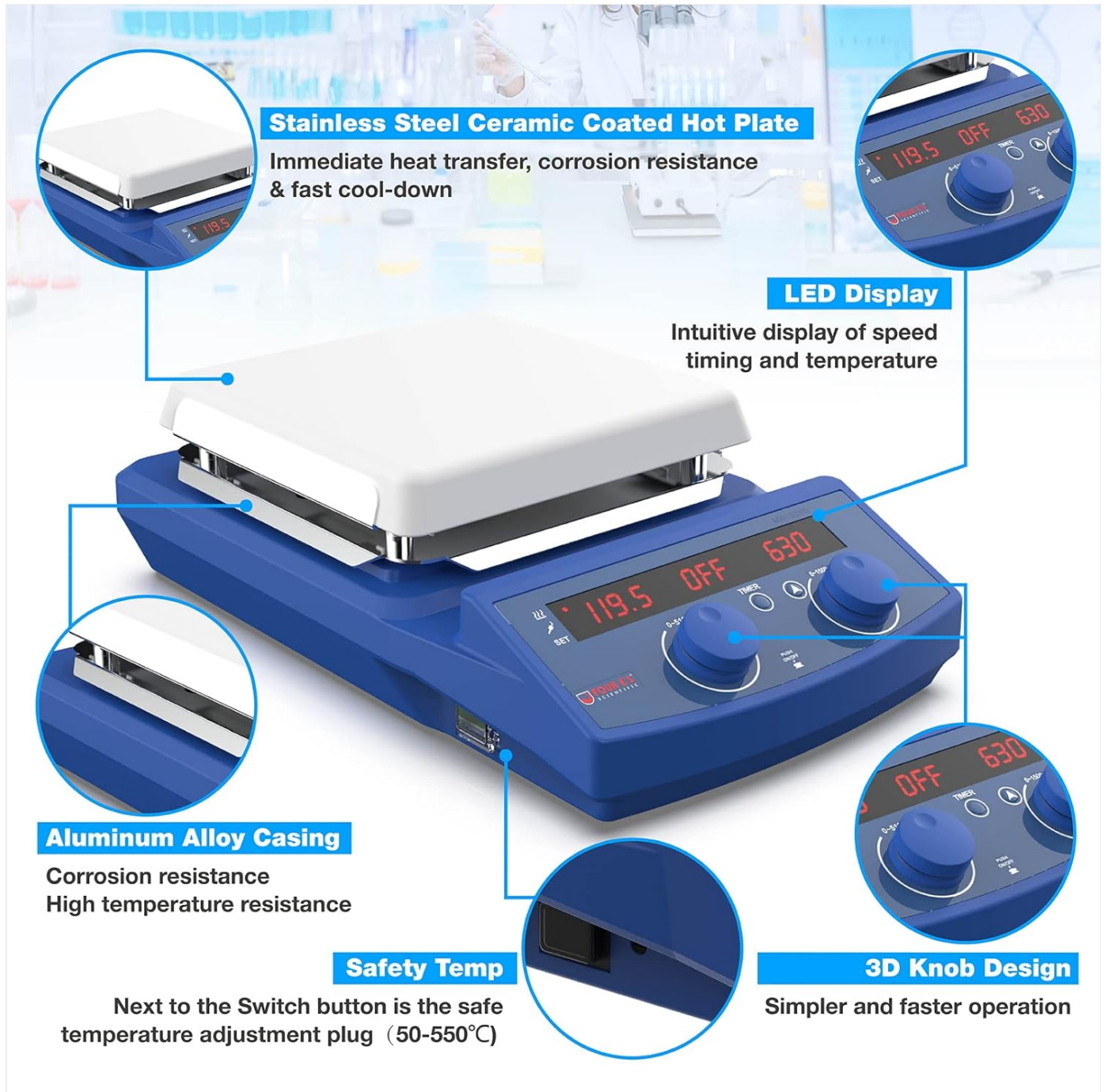
Figure 2: Detailed view of the hotplate stirrer's main features.