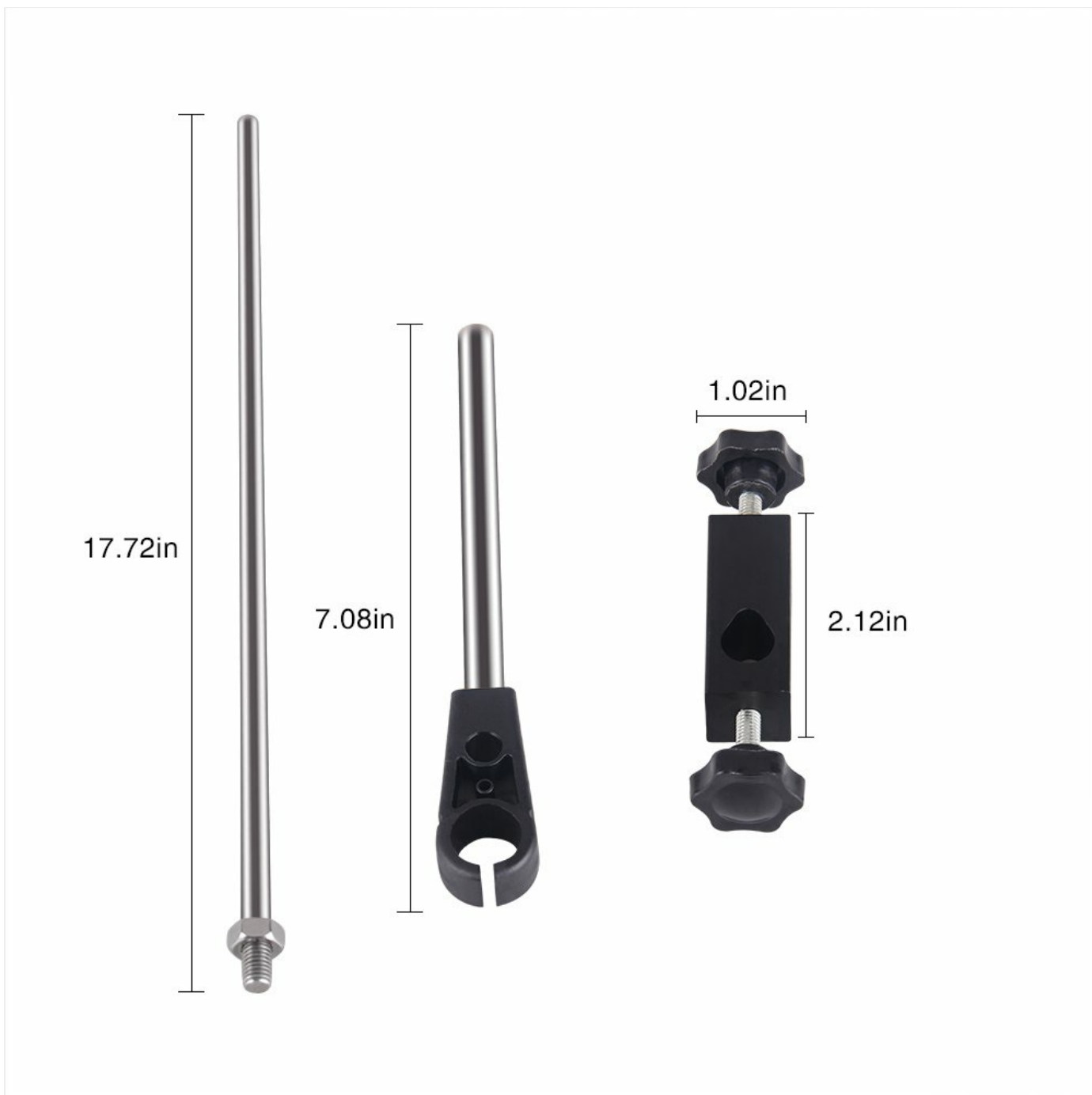
Figure 3: Support stand components and their dimensions.