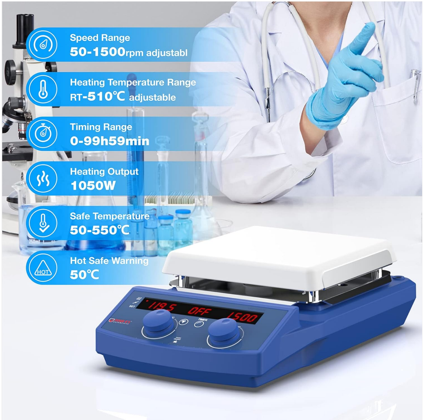
Figure 5: Key operational specifications.